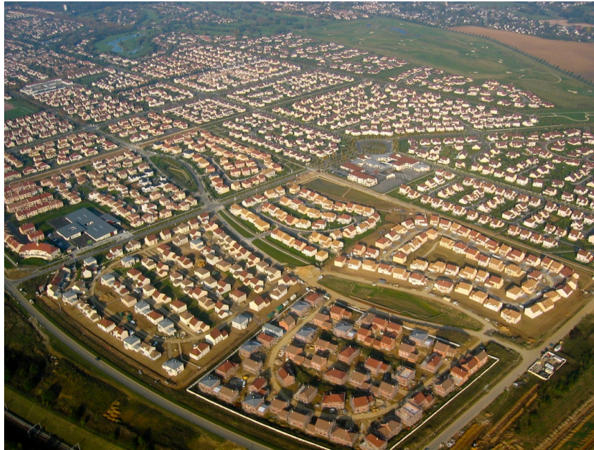
Figure 12.2. Residential subdivisions in Bussy-Saint-Georges ( Ville Nouvelle , Marne-la-Vallée), 2007. Marne-la-Vallée's new town program is often describe as an "edge city," a "boomburb," and a model of "new urbanism."

Recently the term "boomburb" has become increasingly common as an analytical category adopted from the United States. Chalard (2011) has explicitly used it to analyse the dynamics of fifty-four French suburban municipalities with populations of more than 10,000 located in the outer suburban rings around larger metropolitan areas (specifically Paris, Aix-Marseille, Lyon, Rennes, and Toulouse). The term "baby boomburbs" refers to smaller municipalities following the same dynamics (Chalard, 2011). Originally coined by Lang and LeFurgy (2007), the term specifically refers to a trend identified since the 1970s. They define "boomburbs" as "having more than 100,000 residents, as not the core city in the their region, and as having maintained double-digit rates of population growth for each census since the beginning year (1970)" (6). Neither Chalard nor Lang and LeFurgy actually discuss the arbitrary (yet very symbolic) choice of thresholds (within a range of 10,000 to 100,000 inhabitants), but they nevertheless use the "boomburb" category as a heuristic device in their analyses of sub-central growth and suburban fragmentation in larger metropolitan regions. They describe "boomburbs" as "accidental cities" because of their lack of planning. In addition, they point to the lack of political recognition such developments are accorded, especially when compared to major central cities.