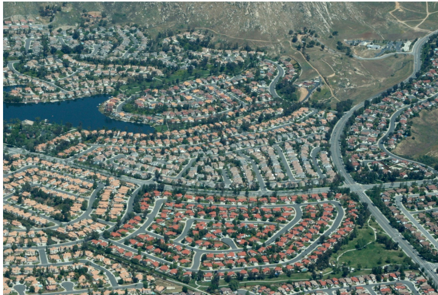
Figure 12.1. Typical post-suburbia in southern California. A master-planned development in Moreno Valley, Riverside County. Source: R. Le Goix, G. Averlant, M. Schwarz, April 2010.

gradually generated interest among those French scholars who focus on the dynamics of densification, especially in transit-oriented neighbourhoods. Whereas some papers published in French may be restricted to U.S. case studies (Billard, 2010; Ghorra-Gobin, 2010 and 2011), others focus on the wide use of U.S. terms as analytical categories in the French context. Good examples of the latter can be found in case studies of Bussy-Saint-Georges and Val-d'Europe, both located in the “new town” of Marne-la-Vallée, developed in the late 1990s and reflecting the “new urbanism” movement (Picon and Orillard, 2012; Choplin and Delage, 2014) (see figures 12.1 and 12.2). This example of the “new towns” program would once have been categorized as an “edge city” by Garreau (1991: 235). 2