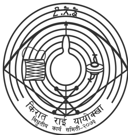
Fig. 3: emblem of the Kirat Rai Yayokkha, the main Rai association, showing ritual artefacts (gourd, drum, cymbal, bow).

process is to unify Rai religious practices in order to strengthen the group's identity.