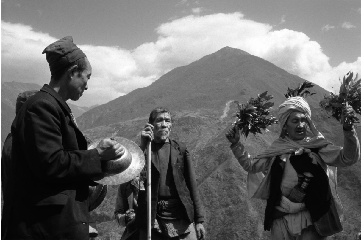
Fig. 1: elder and priest ( nokcho ) dancing for the land.

Among these spirits, those living in the forest are considered to have been the first occupants and owners of the world. Their relationship with humans is one of confrontation. But in this case, the predation is mutual: humans use the land and take forest resources, while these spirits take human souls in order to nourish themselves and to punish humans for their disruptive activities. Sometimes, this relationship can be beneficial. The “Master of the Game” (Diburim, Dibumi, etc.), that is, the supposed owner of wild animals, favors the catching of the prey (prey is the ideal food for the ancestors, and ritual hunts are sometime still performed in honor of both Diburim and the ancestors). A female forest spirit (known as Laladum and Dolemku among the Kulung and by many other names among other Rai) chooses some humans and gives them the power to see the invisible and to divine the future: they become shamans ( selemop , mangpa , etc.; Nep. jhānkri ). Inspired by his or her spiritual guru , who makes him or her tremble, the shaman drums and dances along the mythical path of the first divination, after which he or she then smells the unseen and tells people what the causes of their diseases and misfortunes are, or in other words: which spirits need to be conciliated. Shamans are also the ones who trap bad spirits, exorcise witches, or kill the spirits of bad death; they are, in a way, the specialists in the handling of disorder.