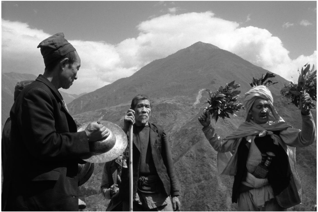
Fig. 1: elder and priest (nokcho) dancing for the land.

Among these spirits, those living in the forest are considered to have been the first occupants and owners of the world. Their relationship with humans is one of confrontation. But in this case, the predation is mutual: humans use the land and take forest resources, while these spirits take human souls in order to nourish themselves and to punish humans for their disruptive activities. Sometimes, this relationship can be beneficial. The "Master of the Game" (Diburim, Dibumi, etc.), that is, the supposed owner of wild animals, favors the catching of the prey (prey is the ideal food for the ancestors, and ritual hunts are sometime still performed in honor of both Diburim and the ancestors). A female forest spirit (known as Laladum and Dolemku among the Kulung and by many other names among other Rai) chooses some humans and gives them the power to see the invisible and to divine the future: they become shamans (selemop, mangpa, etc.; Nep. jhānkri). Inspired by his or her spiritual guru , who makes him or her tremble, the shaman drums and dances along the mythical path of the first divination, after which he or she then smells the unseen and tells people what the causes of their diseases and misfortunes are, or in other words: which spirits need to be conciliated. Shamans are also the ones who trap bad spirits, exorcise witches, or kill the spirits of bad death; they are, in a way, the specialists in the handling of disorder.