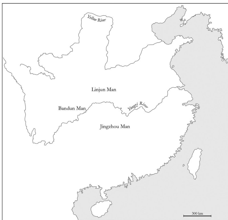
FIGURE 1. The inner Man according to the Hou Hanshu