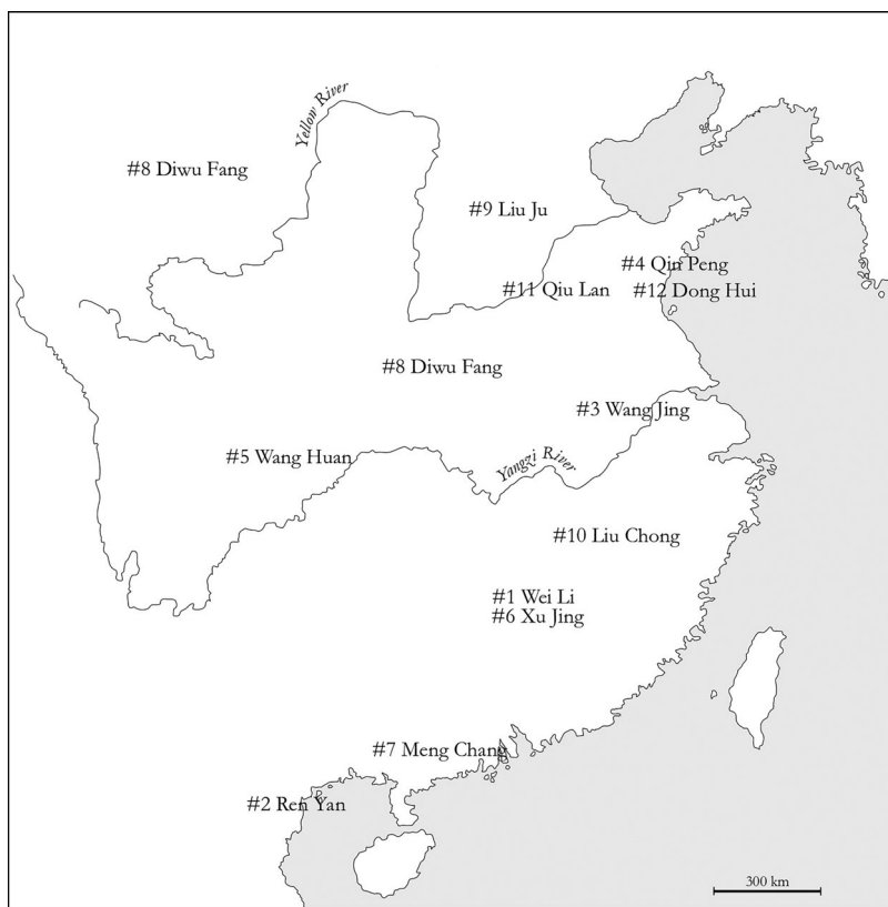
FIGURE 3. Spatial distribution of the benevolent officials according to the Hou Hanshu