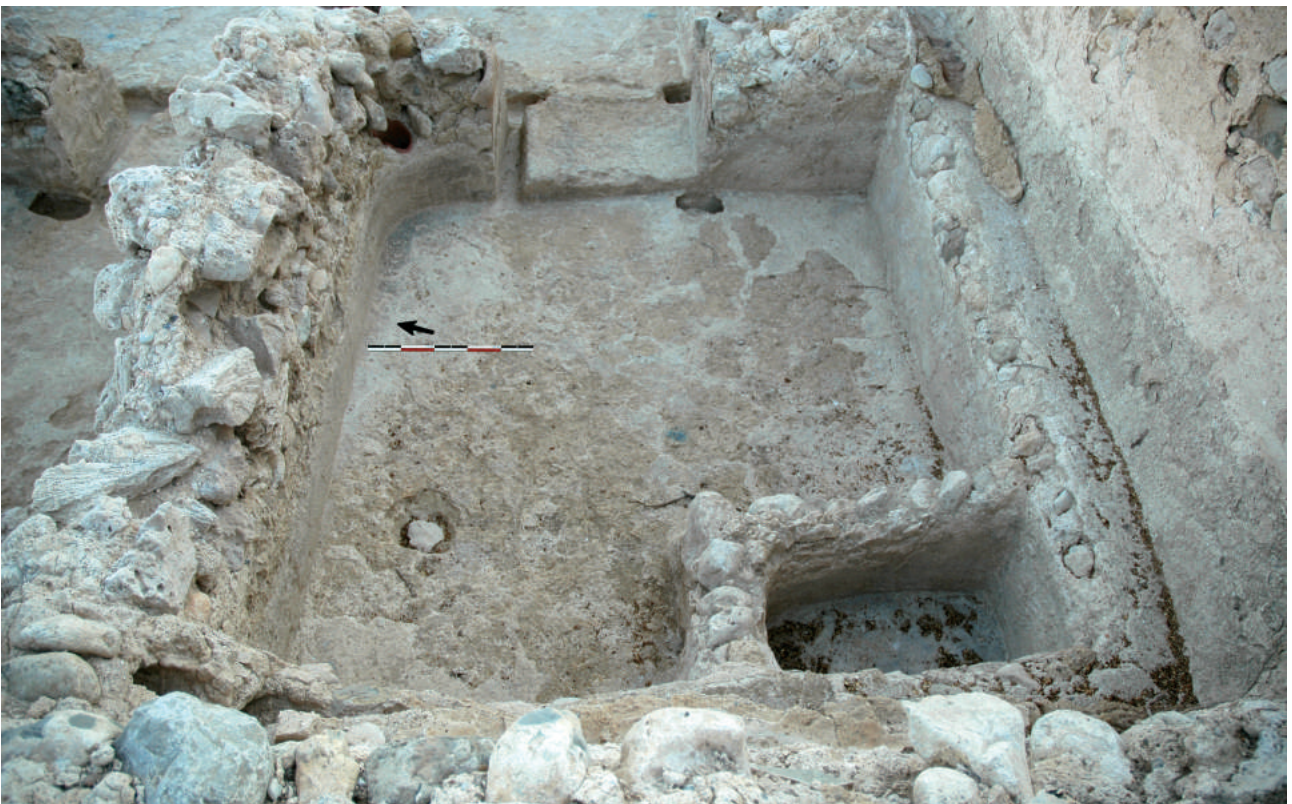
Figure 9. General view of room D.