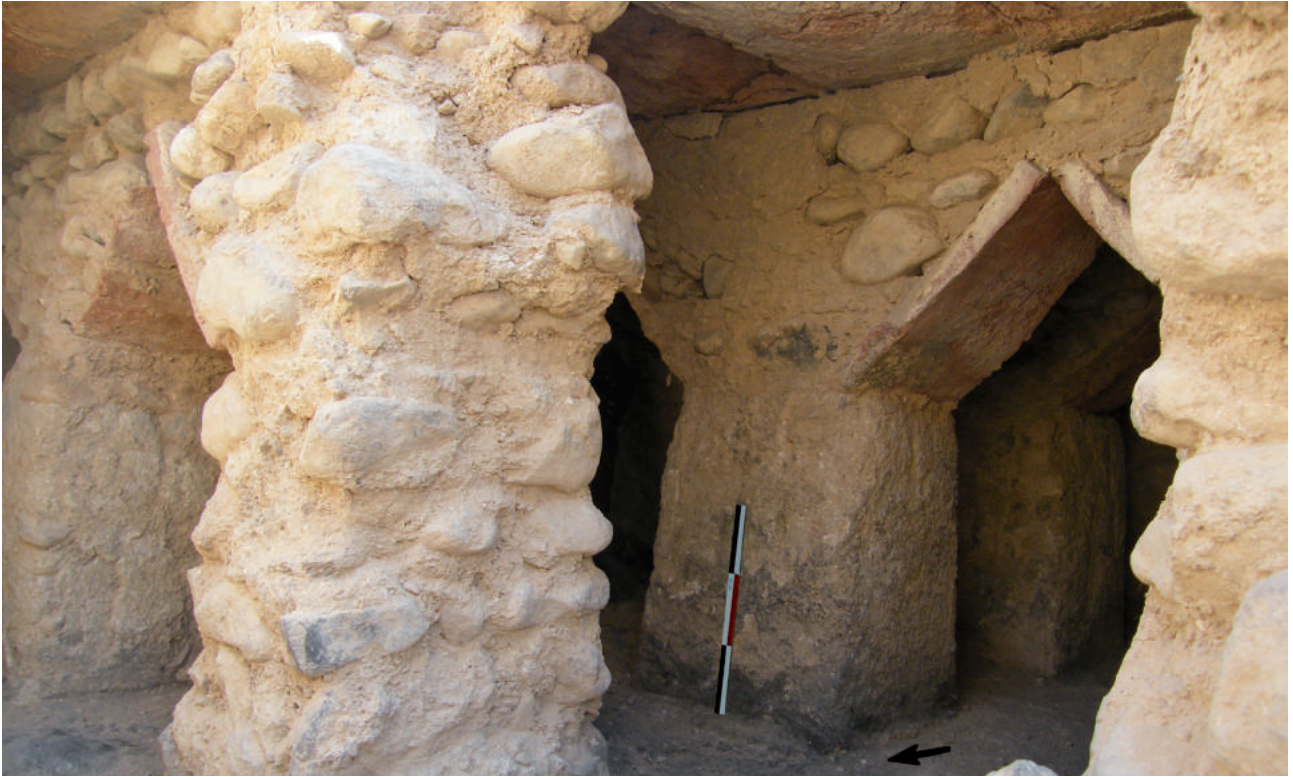
Figure 13. The northern hypocaust, west part under the hot rooms F-G.