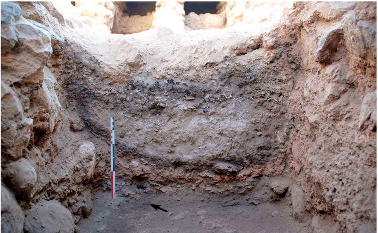
Figure 17. Section in the fire chamber showing layers of ash.