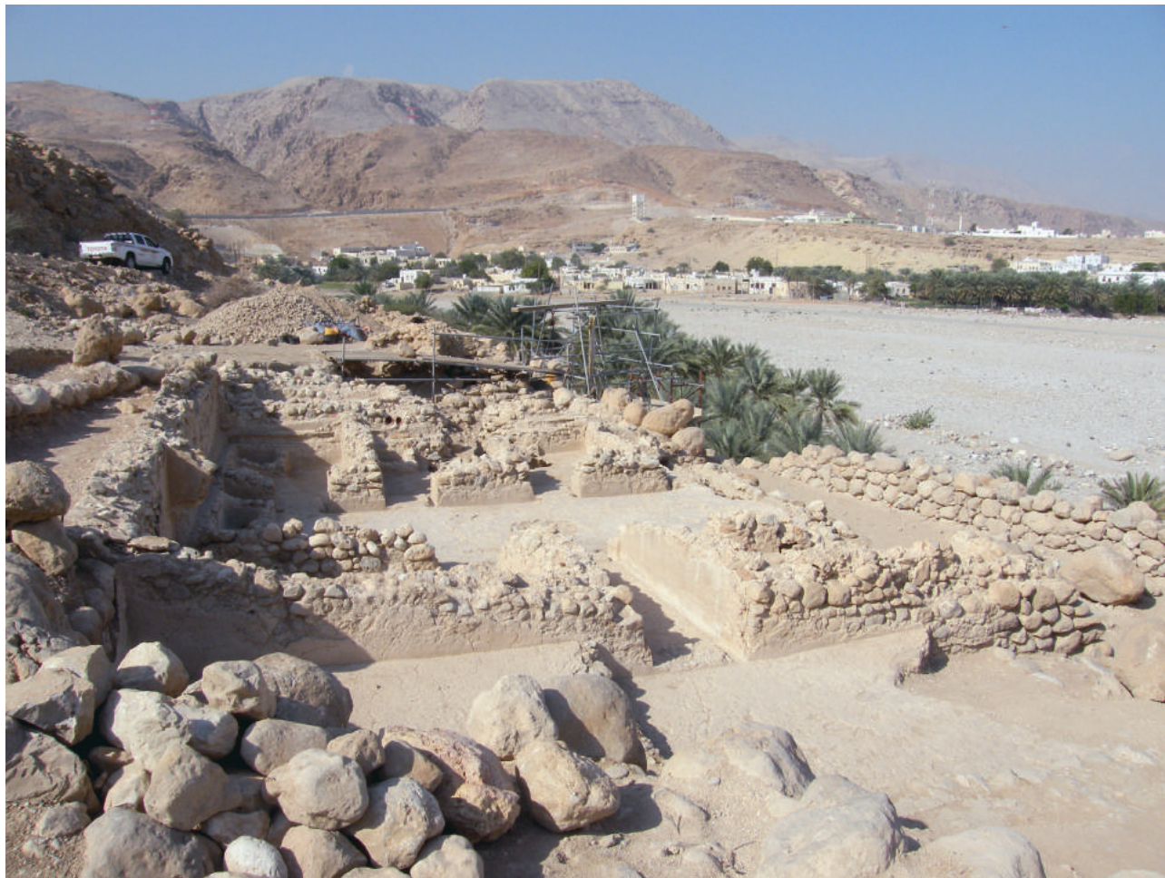
Figure 7. General view of the hammām from the east.

room at ambient temperature where the clients of the hammām could change, storing their personal belongings in the niches, and relax on the platform and benches ( dikka in Yemen, maṣṭaba or ḡulūs in Syria). No trace was found of a central fountain or basin, a very common feature in the dressing room of Islamic hammāms. It was also probably the place where the person in charge stood to check and collect fees. , and