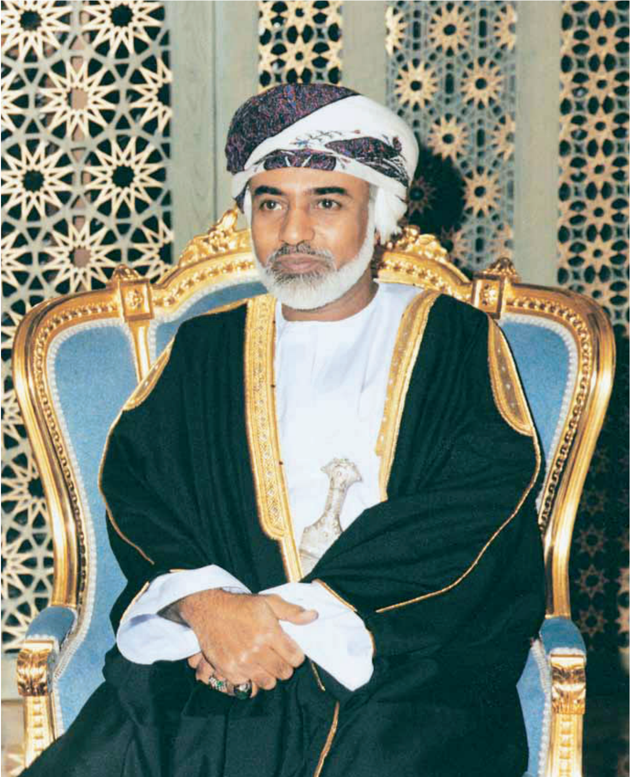
His Majesty Sultan Qaboos bin Said, Sultan of Oman