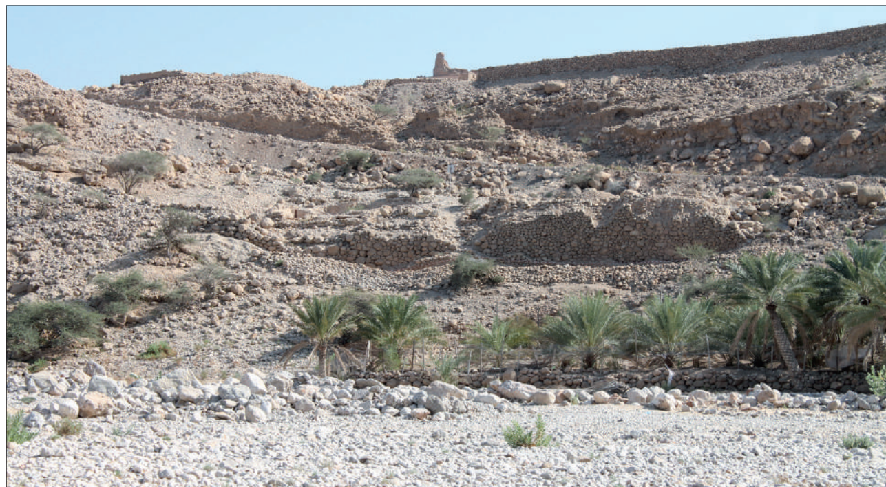
Figure 3. View from the Wādī Hilm of the northwestern gate before conservation work, the terrace, the city and wadi walls, and the modern track.