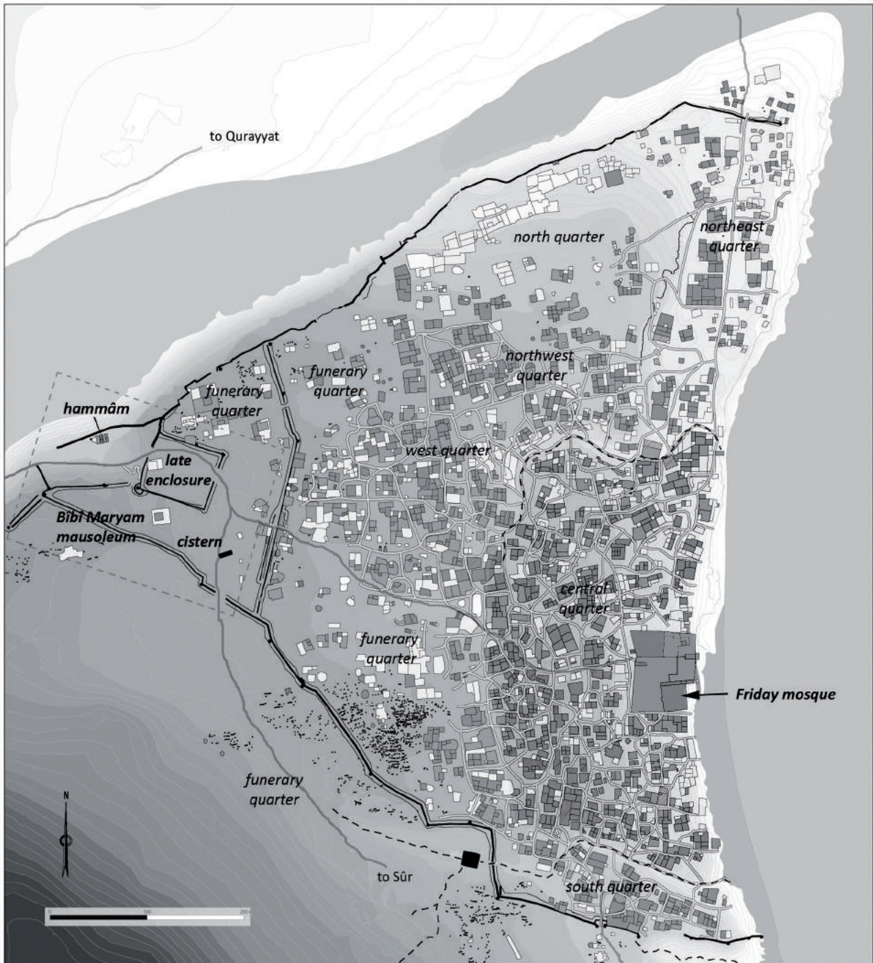
Figure 1. Preliminary map of the medieval city of Qalhāt (c.14th-15th c.) and location of the hammām (the frame indicates the area illustrated in Fig.2).

on that side therefore is unknown, whether it was completely opened to the plateau or was closed by a wall with an inner door to the city, this gate thus acting as an airlock. The then existing rampart