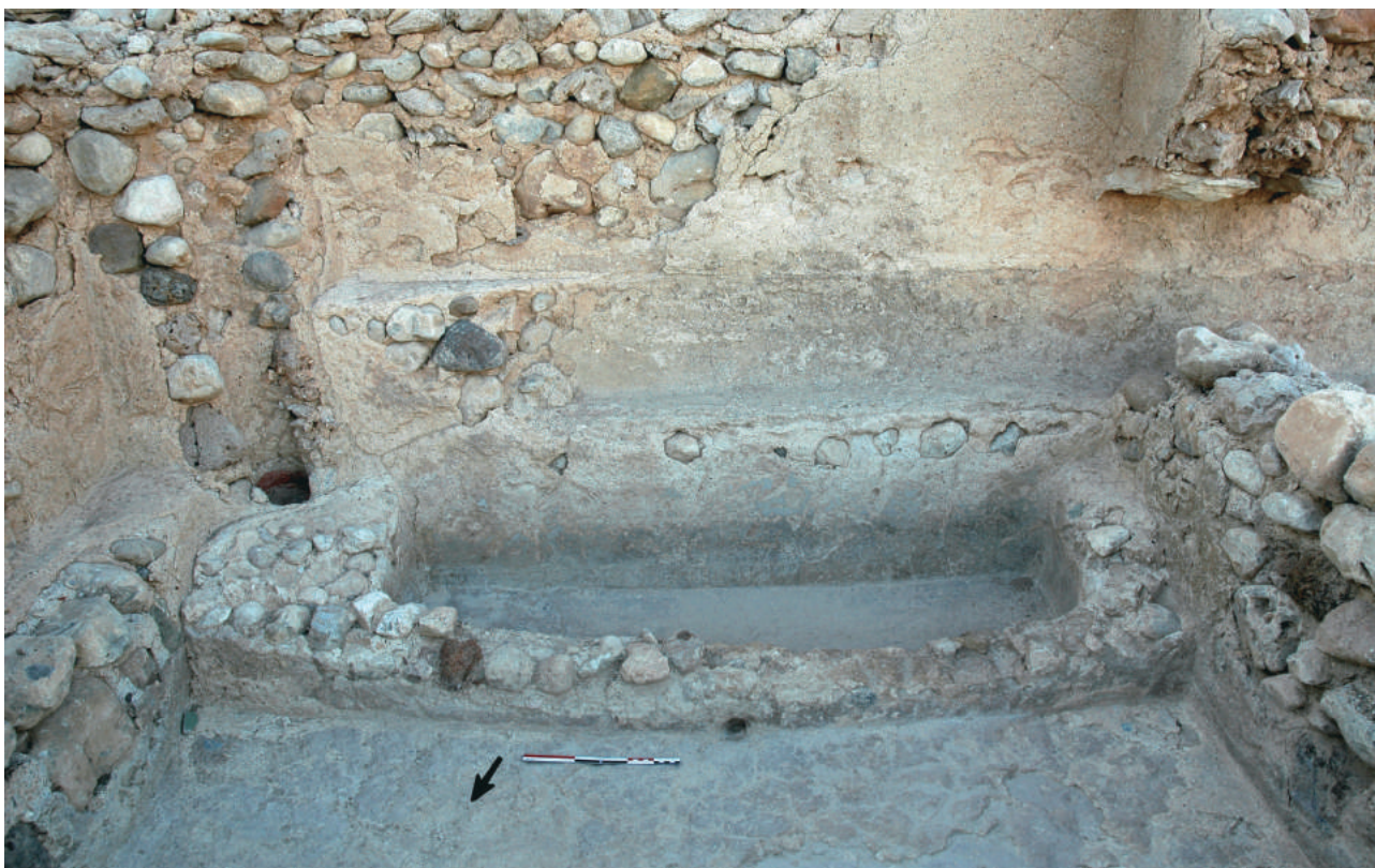
Figure 11. The tub in room A.

and east limestone slabs occur (figure 14). On this surface a thin level of plaster lies topped by a concrete layer of medium pebbles in strong cement (thickness 5.5cm), which is in turn covered by the two successive floors (2cm and 2.5cm). The total thickness between the hypocausts and the hammām therefore reaches 17cm (figures 8 and 14).