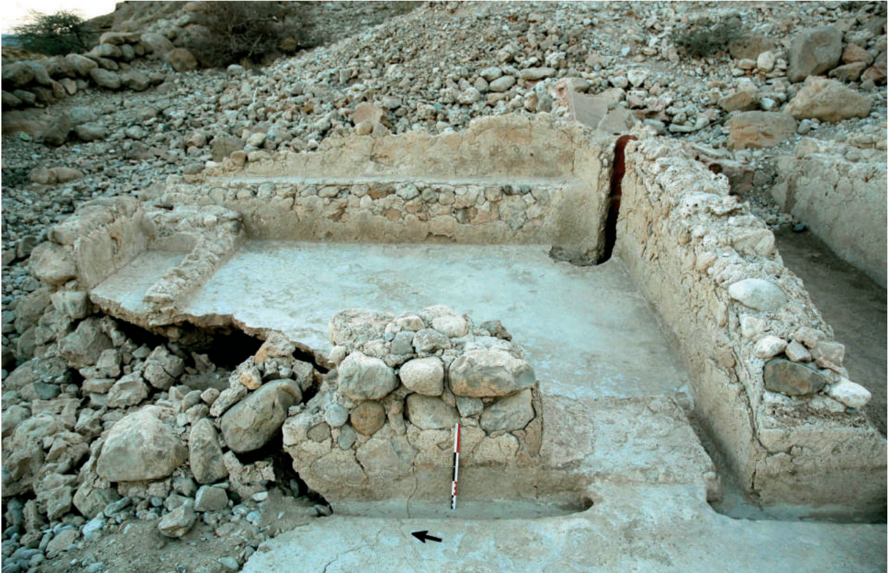
Figure 10. General view of room B.

boulders bounded with mortar, as a foundation. The interior space measures 92cm from the floor to the ceiling, and is divided into three separate parts by a west-east wall which runs under the partition wall between rooms E and F and subsequently divides itself in two branches which underline the middle part of the central room C and then the corridor H. This central part of the basement was most certainly backfilled, when the northern and southern parts were empty, acting as two hypocausts ( shawāri' in Yemen, zuqāqāt in Syria, sarādīb or külhan in Turkish, gorbehro in Farsi). In each hypocaust east-west rows of small pillars support the walls and floors of the hammām. According to the location, two to four rows occur, 30cm wide and regularly spaced 35cm apart.