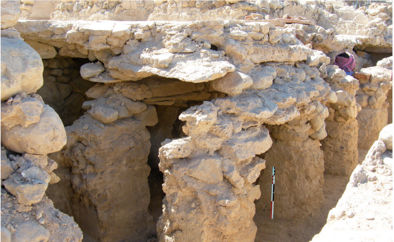
Figure 14. The northern hypocaust, east part under the central room C.