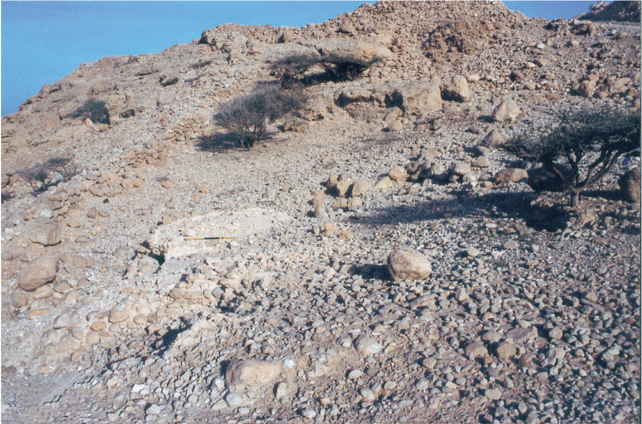
Figure 4. The area of the hammām before the 2003 excavations, from the west.

Due to erosion, the terrace extant before the onset of excavation in 2003 presented a flattish surface sloping from the east and south, down the plateau, to the west and north, on the wadi side, covered with many pebbles and cobbles, and some boulders (figure 4). But the study of the hammām proved that it was extensively landscaped in the medieval period. The fortification wall on the wadi side was built in front of the bank of the Wādī Hilm as a retaining wall to enlarge and frame the surface of the terrace. This surface was itself arranged, at least in its northern part near the wall, in successive artificial terraces. Two such structures were identified in the area of the hammām, with a seemingly angular or curved layout which looks more or less parallel to the edges of the plateau to the south and east 4 . The retaining walls were built of boulders from the