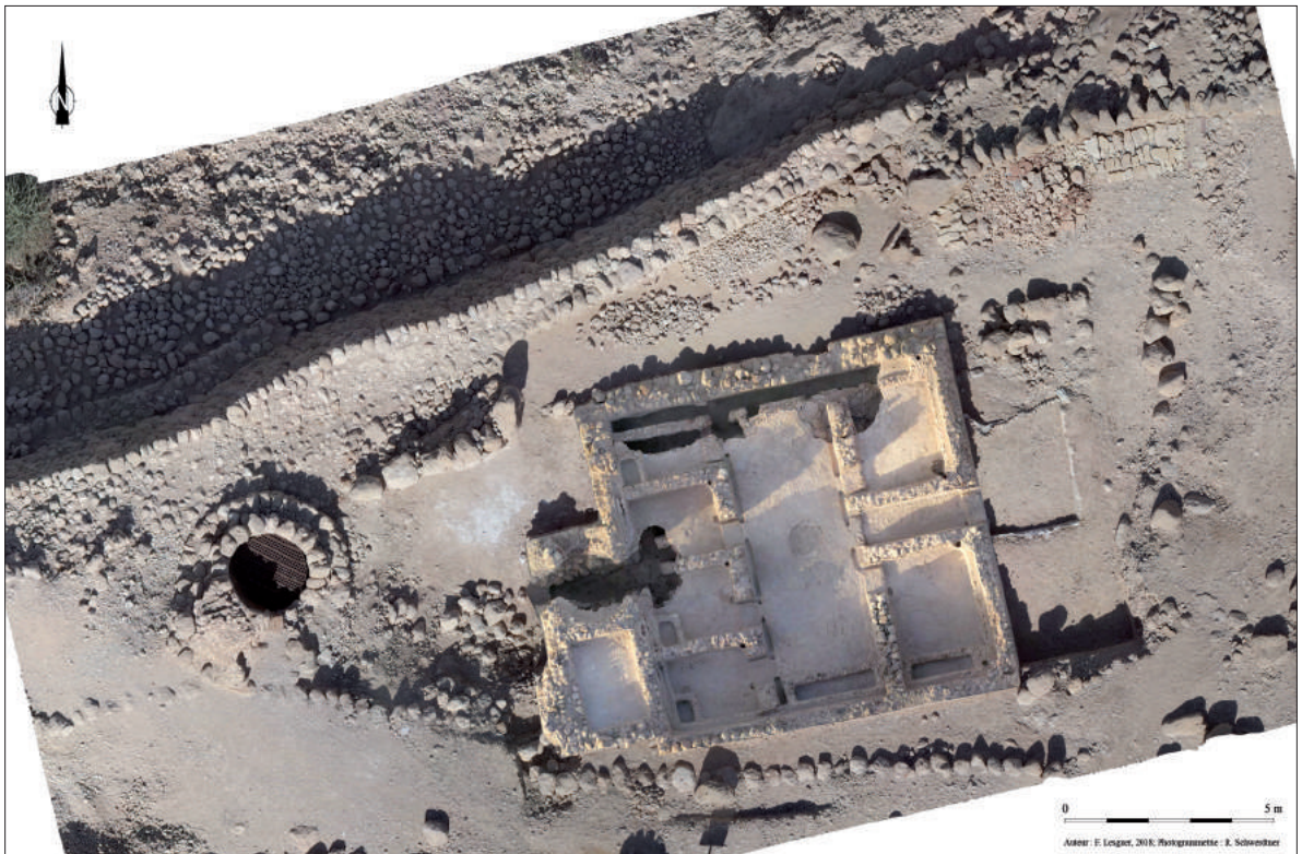
Figure 6. Orthophotograph of the hammām during the conservation work.