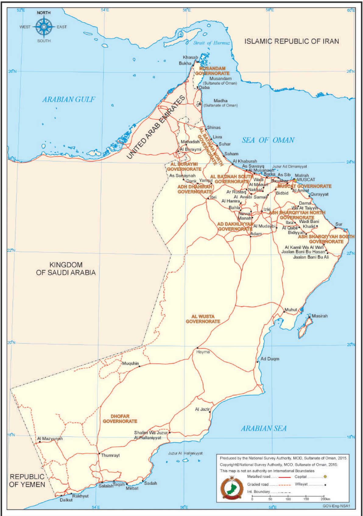
MAP OF THE SULTANATE OF OMAN