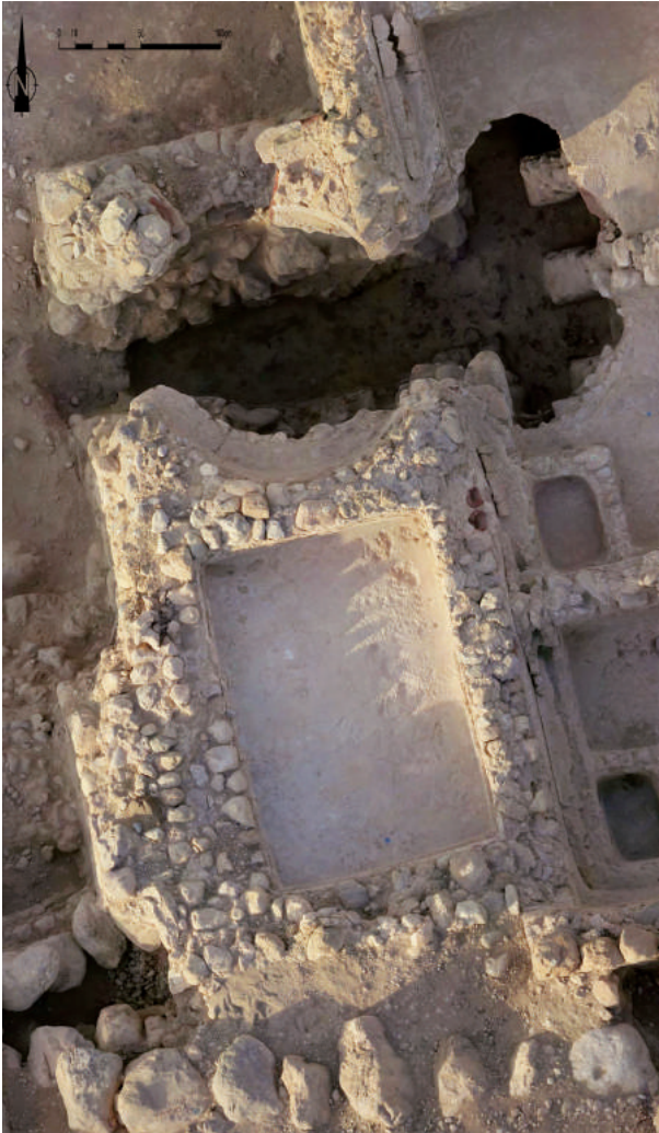
Figure 15. Zenithal view of the western massif with the fire chamber and tanks.

mostly destroyed (area L). The depth of this tank is unknown, at least 50cm deep, but possibly much more. It was most probably covered to help keep the water warm which was heated by the fire below. Immediately south of this tank, in the southern part of the extension, a rectangular tank ( minqāṣa in Yemen), 2.10 x 1.50m, is located atop of what seems to be a massive basement as no access to a subfloor inside chamber is visible. The bottom of this tank is situated an average 35cm higher than the floor of the circular tank nearby (see below). But it is approximately at the same altitude as the present surface of the upper terrace lying to the south. This tank for cold water stood possibly in the open air. Its original height is