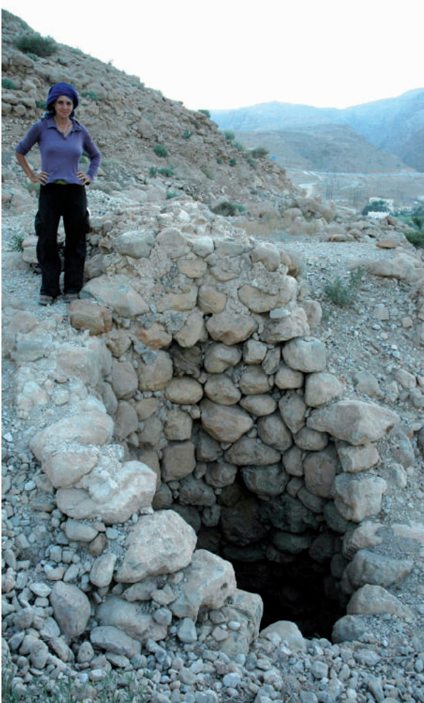
Figure 18. The well west of the hammām, from the northeast.

of the small rooms D-G, in the northeastern corner, two are located inside the large rooms A and B, in the northeastern and southeastern corners. The pipes average 10cm in diameter and are masoned alongside the corner which therefore shows a bevelled profile (figures 9-11). Thus these rooms were heated through the floor and also through some of the walls. We located no pipe in the central room C, and its central part was insulated from the heat of the hypocausts thanks to the underfloor filling, its northern and southern extremities only, below the tubs, being heated. As for the corridor, it was also protected from the heat of the hypocausts as a result of the filling in the basement below, and from the heat of the rooms by the door.