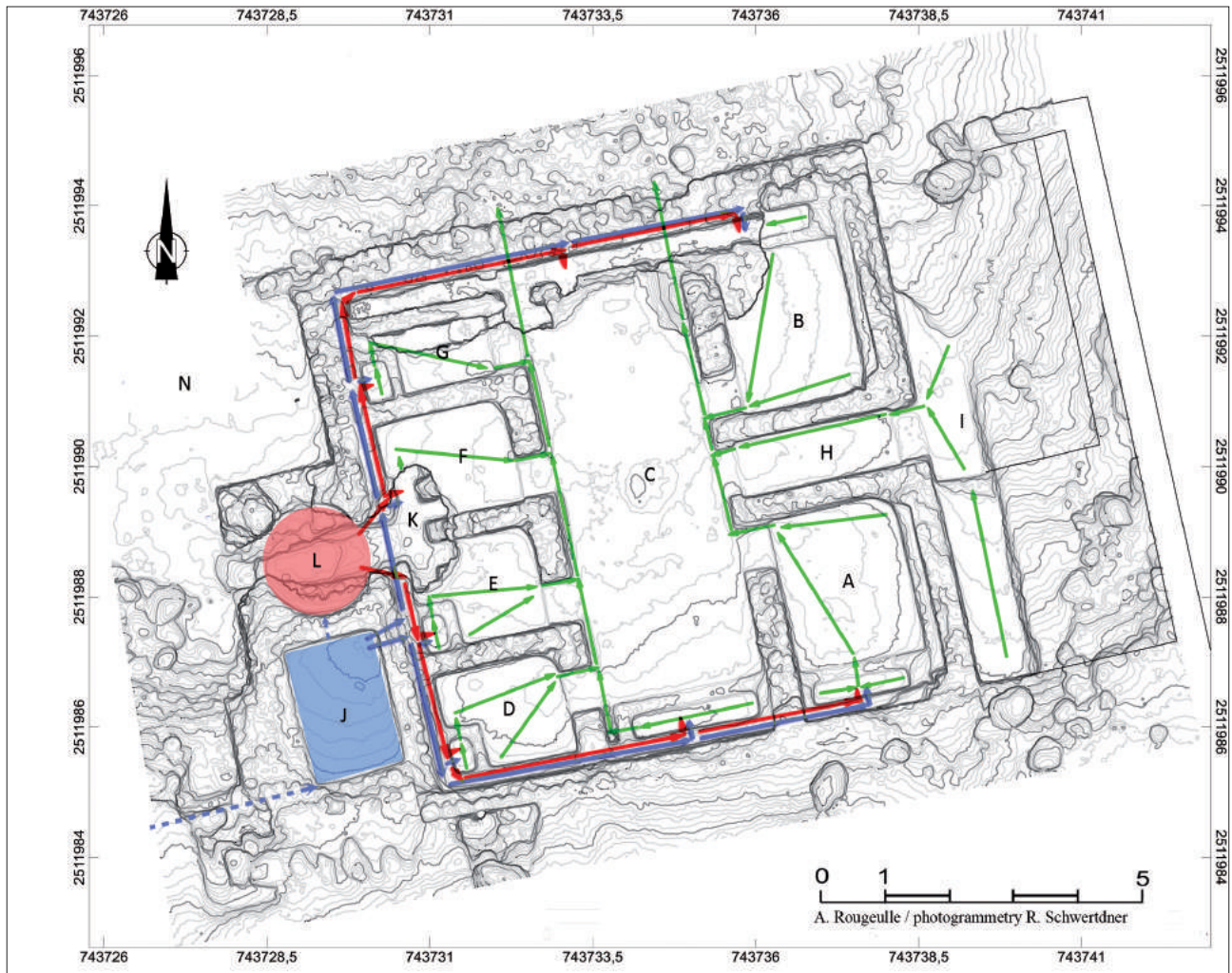
Figure 19. Photogrammetric plan of the hammām and plan of the water circulation systems (red: hot water / blue: cold water / green: waste water).

Nothing remains either of the system of taps which certainly were located in the pipes up the basins and tubs to enable the supplying of water in each room. The detailed study of the levels of the southern system shows that the benches, and therefore the pipes, were slightly sloping up, the altitude from 22.28m in room E to 22.38m in room A, probably to control the water flow and therefore to avoid waste.