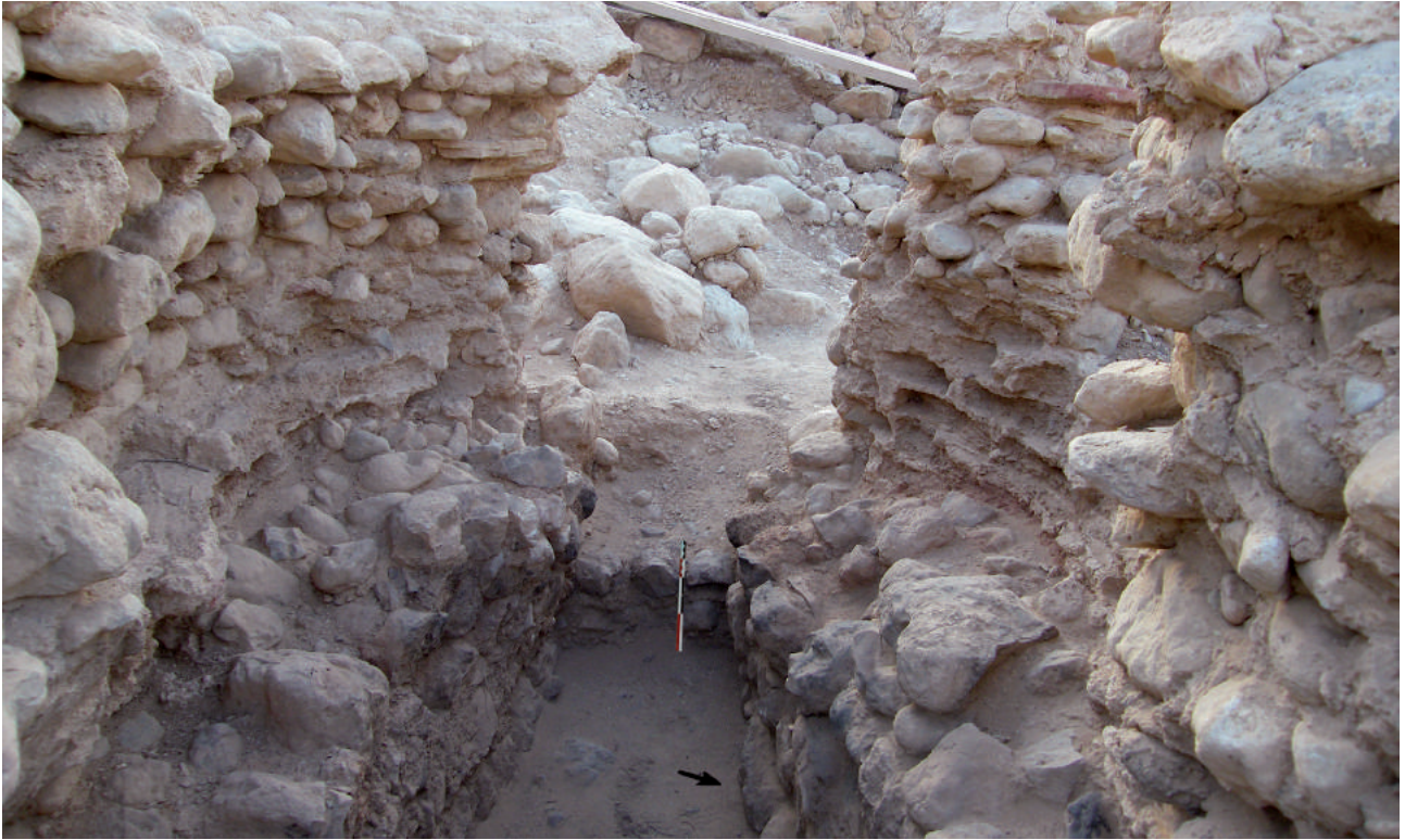
Figure 16. The fire chamber.