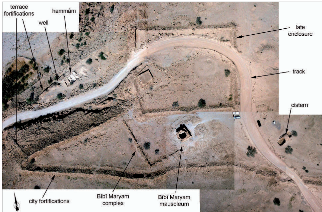
Figure 2. Zenithal view of the area of the northwestern gate and of the hammām.