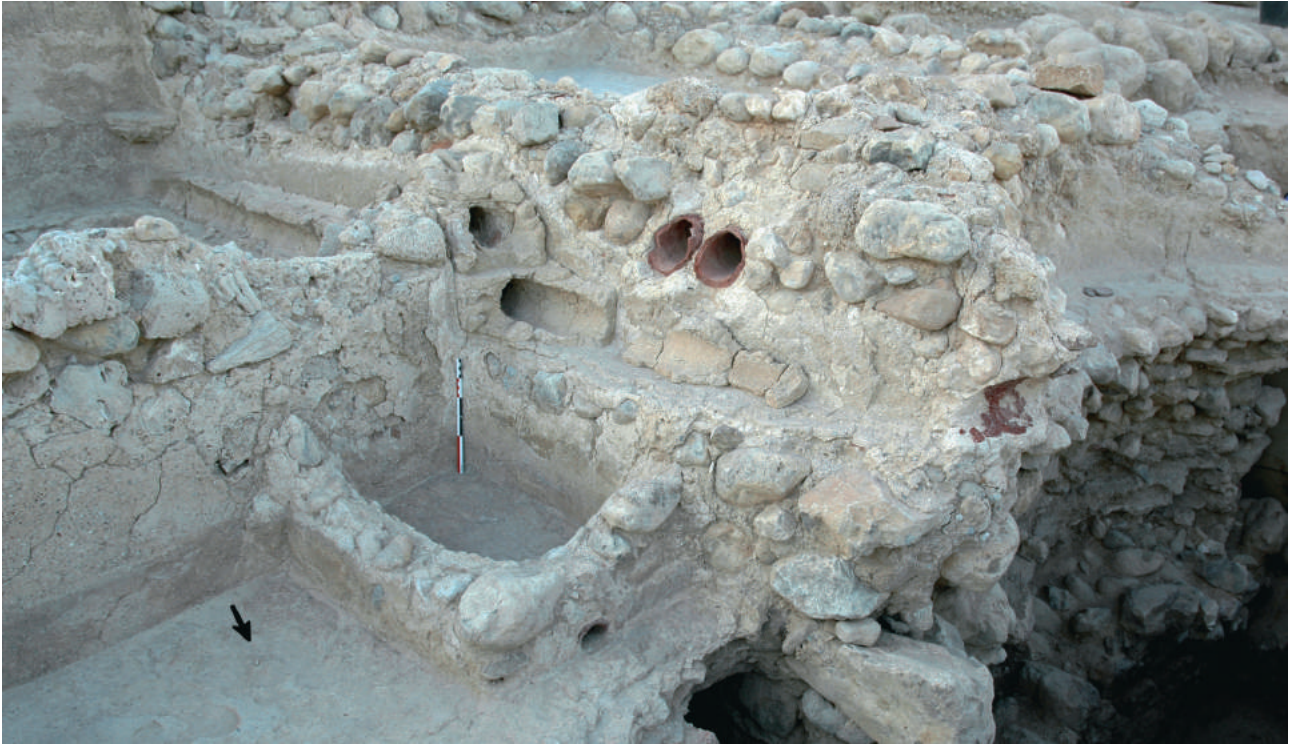
Figure 20. The hot and cold water circulation systems from the tanks and on the benches; and the waste water canalization from the basin in room E.

from the entrance room was evacuated to room C through similar channels along the northern side of both thresholds of the corridor. All channels in the thresholds were connected to similar perpendicular channels running along the western and eastern sides of the central room C. In front of each door they lie below the floor of the thresholds and room C, as terracotta or masoned pipes (inside diameter 8cm), with an overall slope of c.15cm between the south and north sides of the room. The two channels then transgressed the now destroyed northern wall of the hammām, either through two separate exits or connected into a single one, depending whether a tub was located against the northern wall or not. Ultimately the effluent flowed down into the wadi bed through the fortification wall, although nothing of this remains.