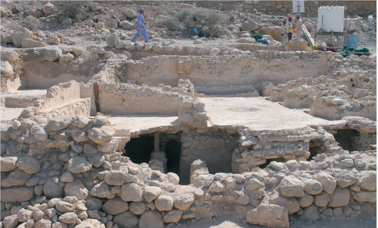
Figure 8. General view of the hammām from the north.