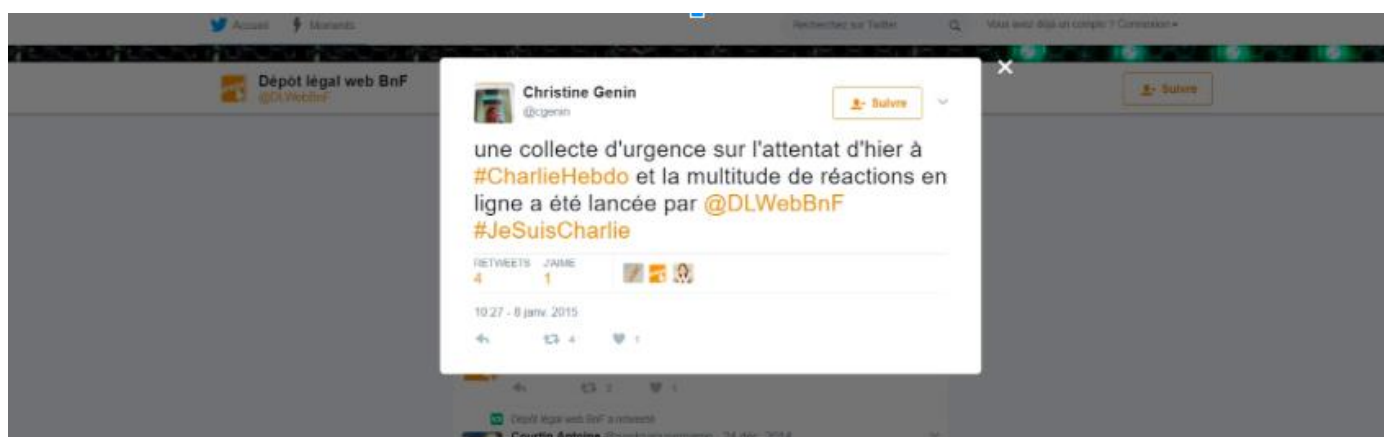
Figure 1: Emergency collection on Charlie Hebdo attacks announced by Christine Genin (BnF) on Twitter on 8 January 2015.

From the day after the attack, Ina established a collection based on Twitter, while the BnF sought to capture a broad range of reactions to events from the Web (tributes, support, analysis, critical or hostile reactions). In the following days the BnF launched an appeal for suggestions both among the network of correspondents of its own Web legal deposit, who worked on specific themes and would continue to point out content of archival interest over the following months, and on the international network of the International Internet Preservation Consortium. 8