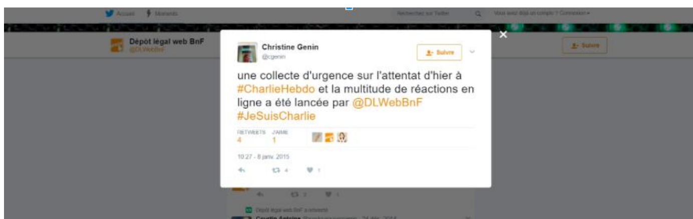
Figure 1: Emergency collection on Charlie Hebdo attacks announced by Christine Genin (BnF) on Twitter on 8 January 2015.

From the day after the attack, Ina established a collection based on Twitter, while the BnF sought to capture a broad range of reactions to events from the Web (tributes, support, analysis, critical or hostile reactions). In the following days the BnF launched an appeal for suggestions both among the network of correspondents of its own Web legal deposit, who worked on specific themes and would continue to point out content of archival interest over the following months, and on the international network of the International Internet Preservation Consortium. 8