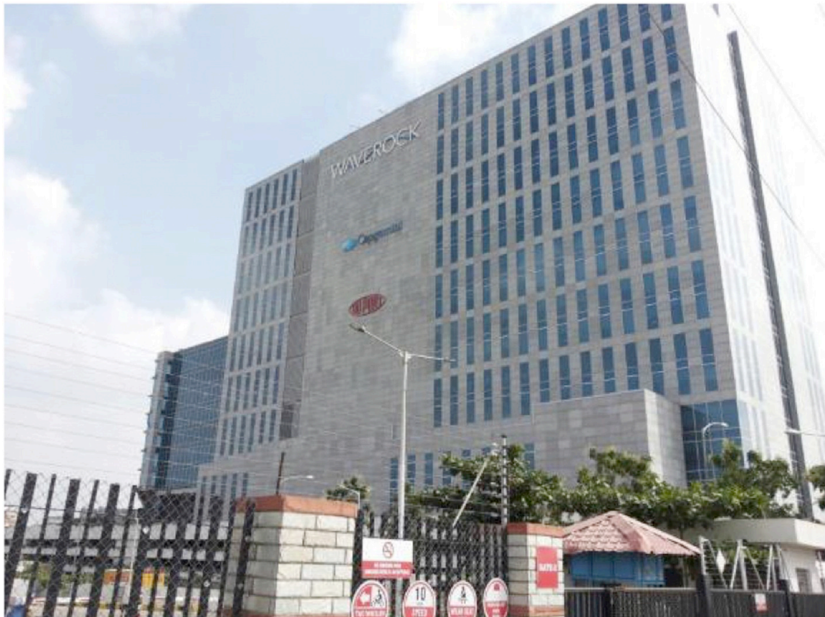
Photo 1. Waverock SEZ, Nanakramguda IT Park, Hyderabad.

private development of large-scale industrial projects, starting with HITEC City, one of its flagship projects, a first step in the creation of a cluster of export-oriented service sector activities that has been pursued, for instance with the Nanakramguda IT Park and Financial District. Here, international investors have set up and equipped globally connected platforms, like the Waverock Special Economic Zone, developed by a US-based company (see Photo 1).