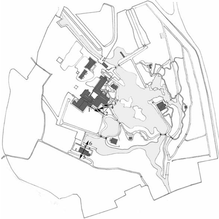
Figure 7. Plan of Katsura Villa showing the locations of the photographs from Fig. 1 to 6.