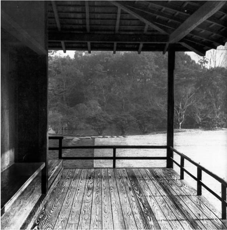
Figure 1. Katsura Villa's broad verandah, view from the residential building towards the garden (cf. Katsura Villa plan, Fig. 7, no. 1). From Horiguchi and Satō, Katsura rikyū (1952), no. 29. Photograph by Satō Tatsuzō