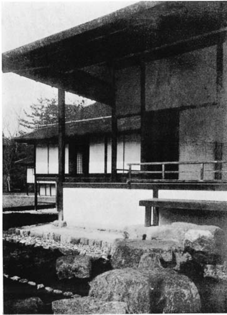
Figure 3. View of Katsura Villa's main building from the garden (cf. Fig. 7, no. 3). From Kishida, Kako no kōsei (1929), pl. 54. Photograph by Kishida Hideto

どんな細かな部分をも疎かにしないこ と。こゝに最も大きな教訓を自分は感ず る。従来日本の建築を添してゐた大きな ことは建築のある重要な部分——それも 主として單なる外觀上の——受けを入念 に考へ、他の部分をあつさり片づけして まふ習慣であつたと思ふ。一線一劃をも 忽にしないといふ名人肌の氣質が次第に 忘れられて行くのは残念である。昔流の 巧麗よりは拙速を建築家も一般社會も喜 ぶといふことは、それがモダンである といふてしまへばそれまでであるが、掌 中の珠を失ふやうな惜しさがして、なら ぬ。深く考へて見る。建築のどんな細か な部分をも忽にしないといふ心掛け、そ れはとりも直さず建築を最も秩序あるも の、合理的なもの、且つよきものとしや うとする現代建築の本領と、その結果に 於いて概を一にするものであると信ず る。魂のいつた建築が欲しい。今の日 本には餘りに營利を對象とした建築が多 すぎる。