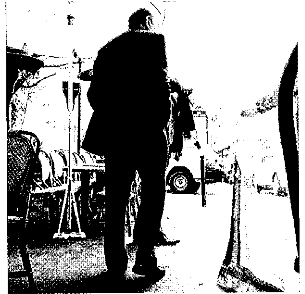
After retiring from politics, Jacques Chirac (here in 2011), was a popular figure.

After a life in public service, Chirac will be remembered as a man who enjoyed getting up close with the public and wasn't shy about visiting France's annual Salon de l'Agriculture, one of the world's largest agricultural shows. He was also an ardent defender of France's Republican values, and worked on the international scene to make the voice of France heard and to defend a multipolar world.