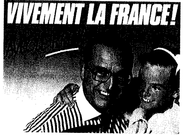
Campaign poster for Jacques Chirac's RPR party in 1986.

including lowering income taxes, improving road safety and measures to help the disabled. However, on the international stage his administration was most clearly distinguished by its anti-American