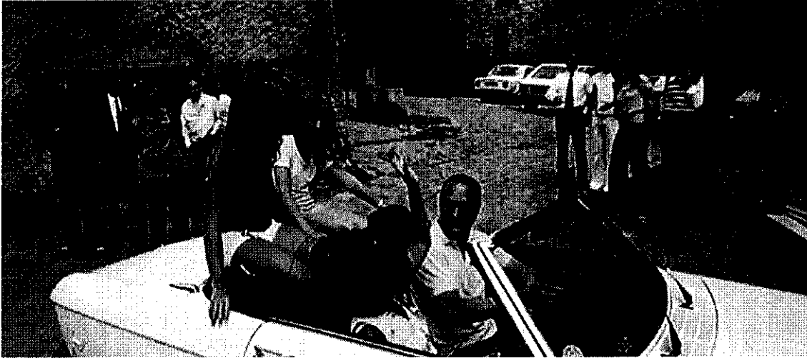
Jacques Chirac and family during the 1970s.

campaigned actively and against all expectations, won.