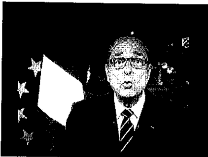
Chirac addresses the nation in response to the 2005 riots in France.

The 2002 election was a watershed for France in a number of ways. The outgoing prime minister, Lionel Jospin, was expected to make it into the second round, but was led by Jean-Marie Le Pen of the far-right National Front party, 16.9% to 16.2%. In the second round, Chirac won easily against Le Pen, 82.2% to 17.8%.