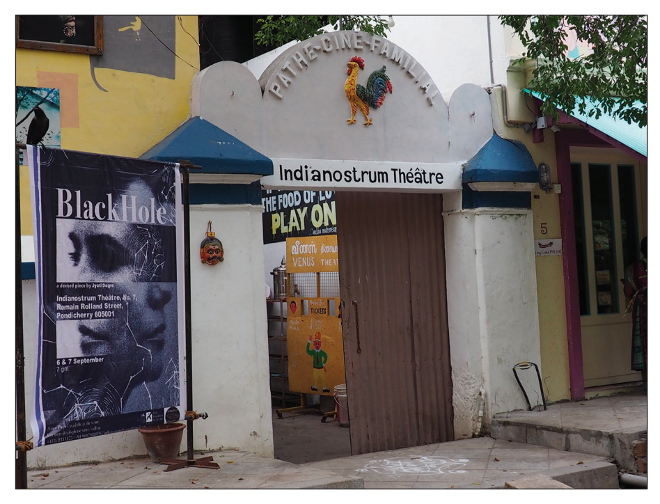
Photo 1 - Front door of Indianostrum next to a trendy café on Romain Rolland Street, in a neighborhood commonly known as « White Town. » During the colonial era the building was used for a time as a cinema hall, the Pathé Ciné Familial

art forms" (Anantharam 2018). At the same time, IN has a relationship with Théâtre du Soleil, a French theatre company of great repute.