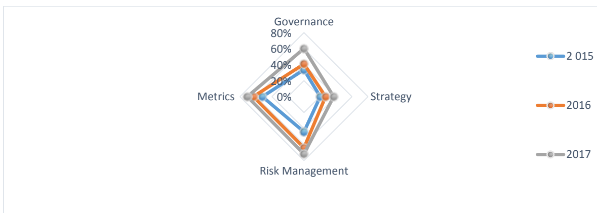
Figure 4 : CCI according to the four TCFD areas

In 2017, CAC 40 companies communicated the most in the areas of risk management (71%), metrics (70%) and governance (60%), far ahead of strategy (37%), and there was an improvement in the environmental disclosure in each area (see figure 4).