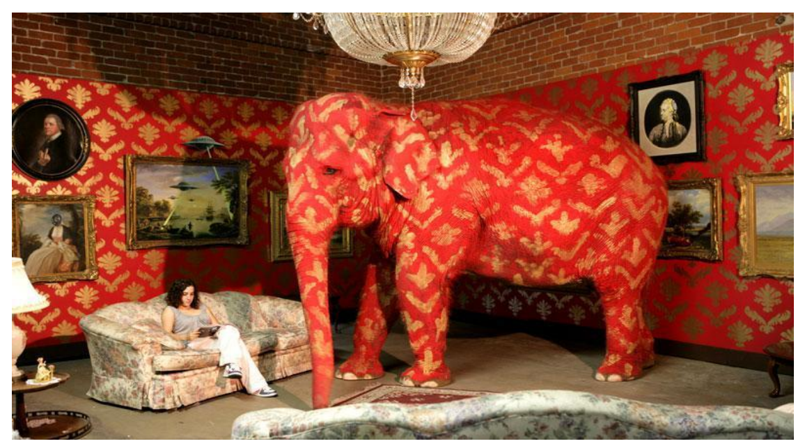
Figure 1. Photograph of 'The Elephant in the Room' installation by Banksy (Los Angeles, 2006).

The elephant in the room is huge, but quiet. It is so taken for granted that it melts into the tapestry. Nobody in the room notes its presence. Though disregarded, it is still strikingly present, a massive force that people must walk around if they wish to move within the room.