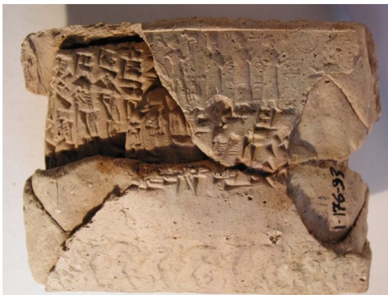
Figure 4.3 An Old Assyrian letter comprising a main tablet and a small second one preserved together in their sealed envelope. Kt 93/k 211, Ankara, Anadolu Medeniyetleri Müzesi.

Non-commercial loans with interest between individuals consisted of small quantities of silver or cereals. Silver could be borrowed with interest from the house of a tamkārum . For the Assyrians, the interest fixed by the kārum office amounted to 30 percent per year; it was even higher for the Anatolians. The creditor could ask for guaranties: a guarantor, the joint responsibility of debtors, or a surety (such as members of the family, the house, or other goods). If a guarantor had to borrow silver in order to pay the loan, the creditor could impose an interest on top of the established interest of the debtor. Loan contracts were for short periods of time, generally shorter than a year.