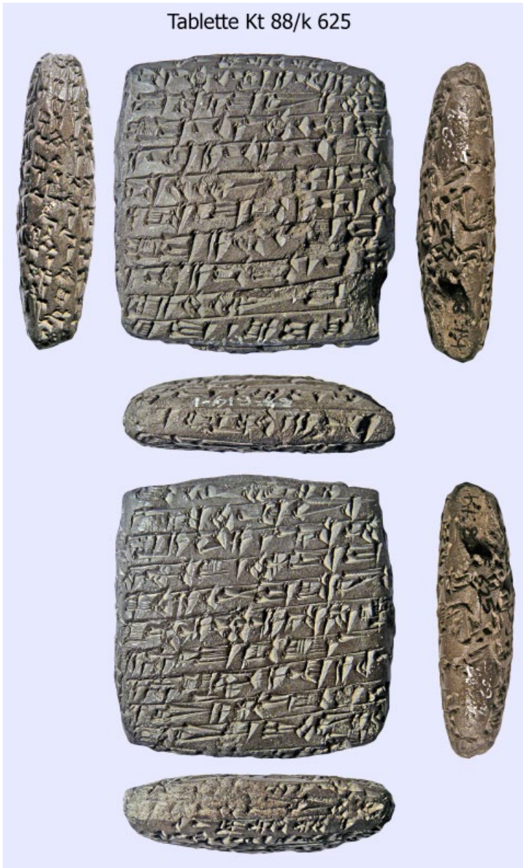
Figure 4.2 The Old Assyrian letter Kt 88/k 625. Ankara, Anadolu Medeniyetleri Müzesi.

One can thus easily imagine that only wealthy merchants could financially support two wives and households at the same time.