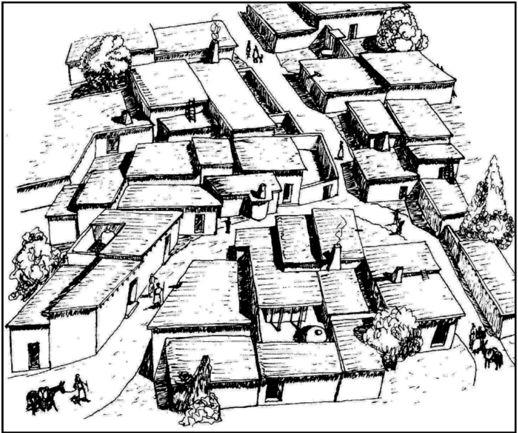
Figure 4.4 Private houses in the lower town level II, reconstruction.

Inside houses in Kaniš, various domestic objects were excavated; for example, clay and metal vessels such as bowls, vases, jars, pans, and cauldrons. Weapons and tools were found in the graves under the floor of some houses, including arrowheads, axes, spearheads, knives, pitchforks, shears, needles, nails, sickles, as well as other objects, such as divine statuettes, reels for spinning, gold and lapis lazuli jewelry, seals, and belt loops (Emre 2008; Kulakoğlu and Kangal 2010; Özgüç 2003: 142–281). Some rare texts record house inventories; one refers to the household of a woman that contained, among other things, grooved stands, lamps, bowls, measuring cups, various vessels, spoons, tables, containers, and cauldrons (Kt h/k 87; Dercksen 1996: 77; Michel forthcoming: no. 135).