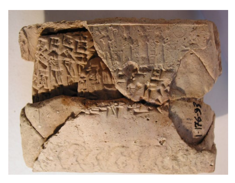
Figure 4.3 An Old Assyrian letter comprising a main tablet and a small second one preserved together in their sealed envelope. Kt 93/k 211, Ankara, Anadolu Medeniyetleri Müzesi.

Non-commercial loans with interest between individuals consisted of small quantities of silver or cereals. Silver could be borrowed with interest from the house of a tamkārum . For the Assyrians, the interest fixed by the kārum office amounted to 30 percent per year; it was even higher for the Anatolians. The creditor could ask for guaranties: a guarantor, the joint responsibility of debtors, or a surety (such as members of the family, the house, or other goods). If a guarantor had to borrow silver in order to pay the loan, the creditor could impose an interest on top of the established interest of the debtor. Loan contracts were for short periods of time, generally shorter than a year.