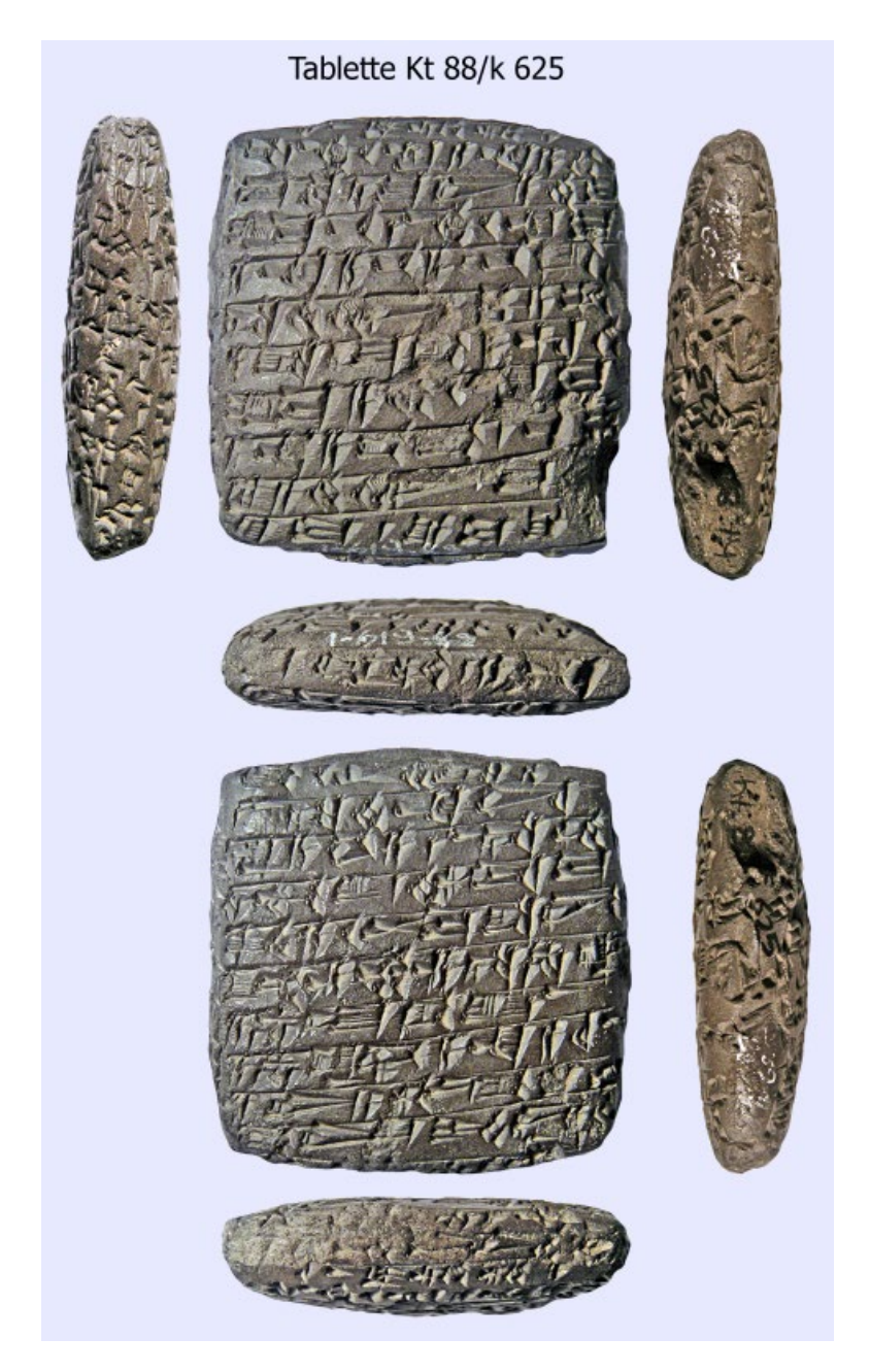
Figure 4.2 The Old Assyrian letter Kt 88/k 625. Ankara, Anadolu Medeniyetleri Müzesi.

One can thus easily imagine that only wealthy merchants could financially support two wives and households at the same time.