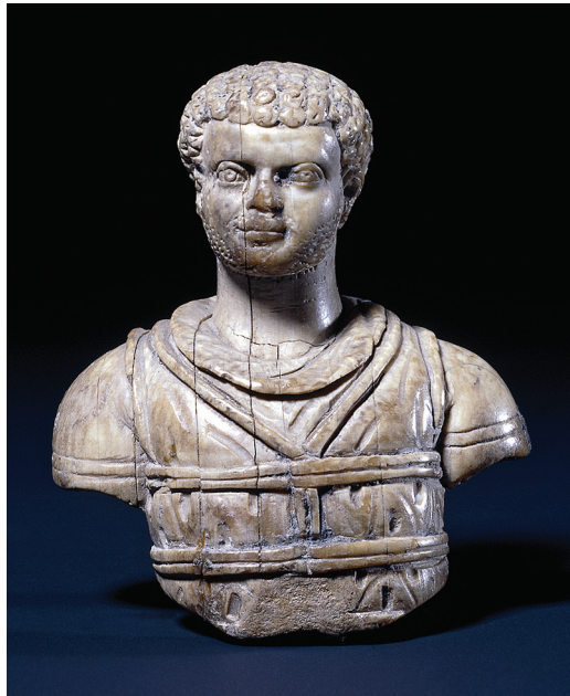
Fig. 5. Ivory bust of a male, possibly the emperor Caracalla, dressed as a charioteer in a thick, horizontally banded tunic. Ca. 200–225 C.E. H. 5.08 cm. Said to be from the amphitheater in Arles. London, British Museum, inv. no. 1851,0813.175 (photo © Trustees of the British Museum).

this legend, if only through literature. In addition, the author of his biography in the Scriptores Historiae Augustae as well as Cassius Dio insist on his cruelty. 70 He was also passionate about chariot racing, according to different literary accounts. 71 Admittedly, a passion for the chariot races of the “bad emperors” is a leitmotif of ancient literature. However, the British Museum possesses an ivory bust of a charioteer ( fig. 5 ), which some have interpreted as representing the emperor Caracalla in the guise of a charioteer. 72 If this identification is correct, this object would confirm the emperor’s alleged passion for chariot races. Could he be in this case the sponsor of this punishment, thereby reconciling his passion for chariot racing, his cruelty, and his attraction to Egyptian civilization?