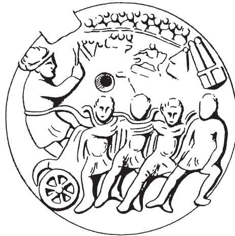
Fig. 4. Drawing of Fig. 1 by Bailey (after Bailey 1980, 56, fig. 58, Q 1348).

race in a circus on Q 1349 ( fig. 2 ), and a chariot pulled by men in a circus on Q 1348 ( fig. 1 ). On the last lamp (Q 1344), we can see a group of men carrying a cask. H. B. Walters had assumed that these lamps marked SAECVL/SAECVLI could have been linked to the Saecular Games ( Ludi Saeculares ) and that they could have been used to illuminate the entertainment buildings during these celebrations. 5 With the exception of lamps Q 1348 ( fig. 1 ) and Q 1349 ( fig. 2 ), which include performances of shows in circuses, the scenes represented on the three other lamps have a priori no relation with the Saecular Games. Furthermore, there is no evidence that the shows on the lamps Q 1348 ( fig. 1 ) and Q 1349 ( fig. 2 ) took place during the Saecular Games. This is why the hypothesis of Bailey seems to me much more likely. According to him, it is actually the name of the potter who made them. 6 Thus these five lamps could come from the same workshop, although this remains very hypothetical for lamp Q 1341.