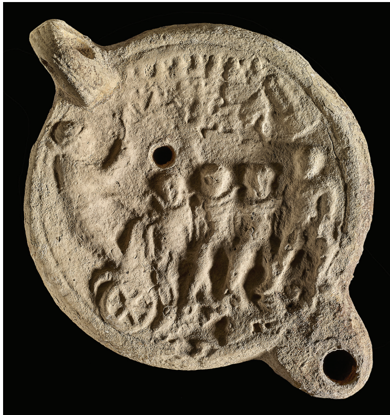
Fig. 1. Oil lamp with a chariot drawn by four (or three ?) men in a circus (15.20 × 11 cm). London, British Museum, inv. no. 1878,1019.316.