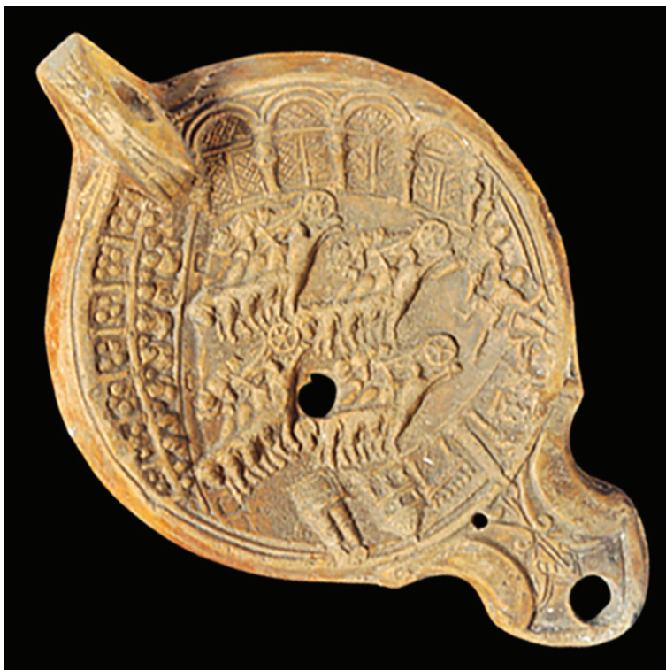
Fig. 2. Oil lamp with horse racing scene in a circus (14.70 × 9.60 cm). London, British Museum, inv. no. 1814,0704.106.