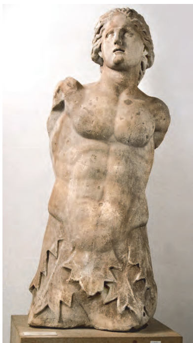
Fig. 24 Marble statue of a Triton; copy of the 1 st century AD after a Hellenistic original.