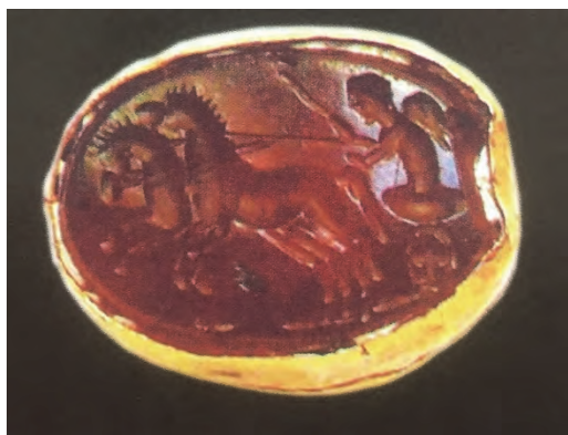
Fig. 28 Golden ring with agate seal representing Eros driving a two-horse chariot, 3rd century AD

numerous than Parthian objects, which reflect a longer and stronger connection between Albanians and their Iranian neighbors. But the Baku Archaeological and Ethnographical Museum preserves at least one other luxury item of Greco-Roman origin or at least inspiration and with an erotic topic: a gold ring with an agate, on which a winged charioteer, who could be Eros, was carved to be used as a seal (fig. 28) 101 .