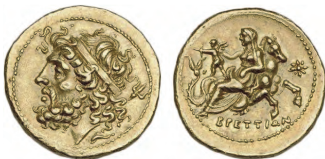
Fig. 10 Gold coin of the Brettii, 4th century BC, with Poseidon and Amphitrite, Aphrodite or one Nereid.

(fig. 10) 35 . It is true that the hippocamp itself is an animal related to Poseidon / Neptune, but since the god is absent, there is no definite proof that the woman is Amphitrite.