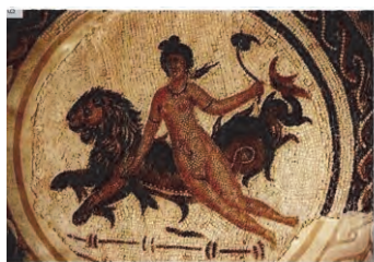
1 - N° 53. Médallion 19.