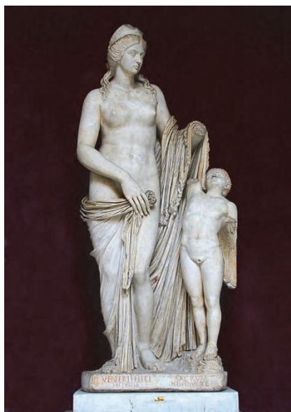
Fig. 19 Venus Felix with an Eros, with a woman's portrait (perhaps Faustina the Younger?)