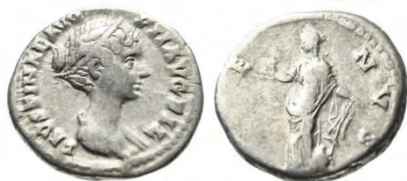
Fig. 20 Silver coin of Faustina the Younger, the reverse showing Venus Genitrix with a dolphin and a rudder

with a flowing veil on her back) she is always transported by a vehicle recalling the shell: never by a hippocamp 77 .