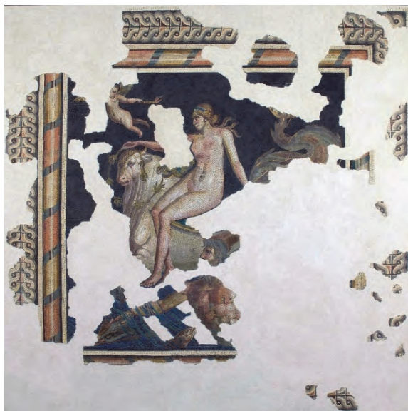
Fig. 26. "Rape of Europa" mosaic preserved in the Archaeological Museum in Aquileia; 1 st century AD with restoration.

alluding to Venus, seem also more likely in the second half of the 2 nd century AD. The silver component, perhaps equivalent to 500 denarii , especially following the reign of Commodus – if our interpretation is right – might be a further argument for this date, between the Antonines and the Severi.