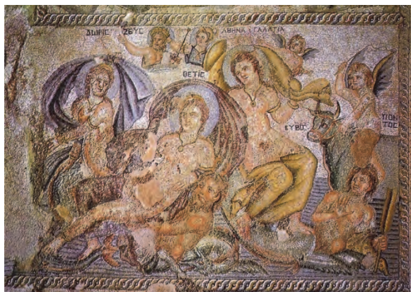
Fig. 23 Mosaic “Judgment of the Nereids”, 4 th century AD.

... ὑπὲρ πόντοιο δὲ κούρη δείματι παλλομένη βοῶν ναυτίλλετο νότω ἀστεμφῆς ἀδιάντος· ἰδὼν δὲ μιν ἡ τάχα φαίης ἢ Θέτιν ἢ Γαλάτειαν ἢ εὐνέντιν Ἐννοσιγαίου ἢ λοφίῃ Τρίτωνος ἐφεζομένην Ἀφροδίτην. καὶ πλόον εἰλπόδην ἐπεθάμβεε Κυανοχαίτης, Τρίτων δ' ἤπεροπῆα Διὸς μυκηθμόν ἀκούων ἀντίτυπον Κρονίῳ μέλος μυκήσατο κόχλῳ αἰείδων ὑμέναιον· αἰρομένην δὲ γυναῖκα θαῦμα φόβῳ κεράσας ἐπεδείκνυε Δωρίδι Νηρεῦς, ξεῖνον ἰδὼν πλωτῆρα κερασφόρον· ἀκροβαφῇ δὲ ὀλκάδα ταῦρον ἔχουσα βοοστόλος ἔπλεε νύμφη, καὶ διερεῖς τρομέουσα μετάρσιον ἄλμα πορείης πηδάλιον κέρας εἶχε, καὶ Ἴμερος ἔπλετο ναύτης. καὶ δολόεις Βορέης γαμίῃ δεδονημένος αὔρη φᾶρος ὅλον κόλπωσε δυσίμερος, ἀμφοτέρῳ δὲ ζῆλον ὑποκλέπτων ἐπεσύρισεν ὄμφακι μαζῶ. ὥς δ' ὅτε Νηρείδων τις, ὑπερκύψασα θαλάσσης, ἐξομένη δελφίνι χυτὴν ἀνέκοπτε γαλήνην, καὶ οἱ αἰρομένης ἐλελίζετο μυδαλέῃ χεῖρ, νηχομένης μίμημα, φέρον δὲ μιν ἄβροχον ἄλμης ἡμιφανῆς πεφόρητο δι' ὕδατος ὑγρὸς ὀδίτης, κυρτώσας ἐὰ νῶτα, διερπύζουσα δὲ πόντου δίπτυχος ἄκρα κέλευθα κατέγραφεν ἰχθύος οὐρή· ὥς ὅγε ἴ ταῦρον ἄειρε. τιτανομένοιο δὲ ταύρου βουκόλος αὐχένα δοῦλον Ἔρωσ ἐπεμάστιε κεστῶ καὶ νομῖν ἄτε ράβδον ἐπωμίδι τόξον αἰρώων Κυπριδίῃ ποίμαινε καλαῦροπι νυμφίον Ἥρης εἰς νομόν ὑγρὸν ἄγων Ποσιδηῖον.