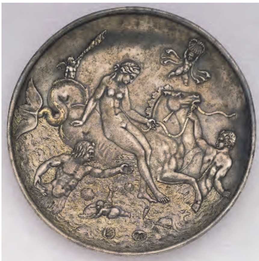
Fig. 2 The Yenikend plate, Hermitage Museum.

The plate is round, 24 cm in diameter, and registered as weighing 1030 g. It has a circular base, 8.2 cm in diameter, one-third of the principal diameter, as is often the case for this kind of Greco-Roman dish. If these numbers are precise and if the plate had not lost anything of its original dimensions, its diameter would be 10 Roman unciae and its weight c. 3 librae . Assuming that the concentration of silver is as high as in similar dishes, one could estimate the original weight of silver at between 300 denarii (for an imperial denarius of 3.4 g, during the reigns of the Julio Claudian emperors) and 500 denarii (for a denarius containing 2.6 g of silver, between the Antonine and Severan dynasties). Since we lack precise analyses of the