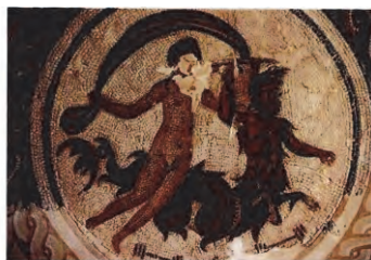
2 - N° 53. Médallion 20.