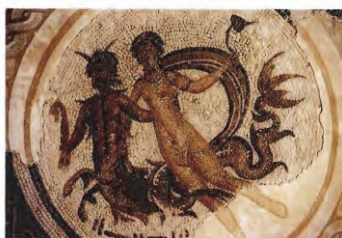
4 - N° 53. Médallion 22.