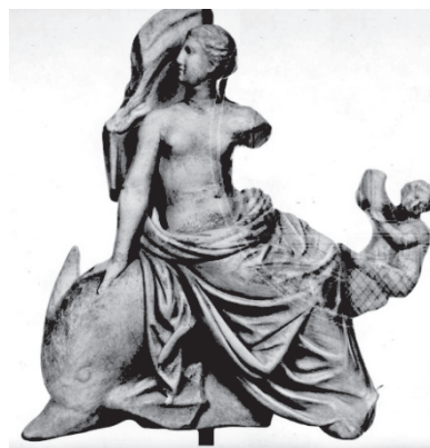
Fig. 15 Statue of Aphrodite on a dolphin discovered in Thasos.