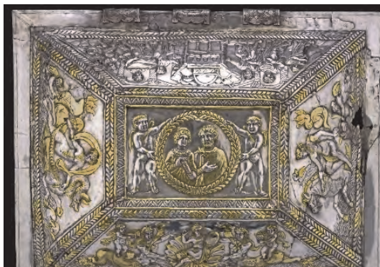
Fig. 9 The Projecta Casket in the Esquiline treasure.

are a common decorative motif that fill space in a harmonious way, respectful of the usual iconographic canons. Sometimes, they can be more than mere decorations and have strong, symbolic meaning, as aquatic deities of beauty and the strangeness of life and the passage to the Underworld. Whatever the meaning of their representations, weak or strong, varied as they were, the iconography of the Nereid is always easily recognizable.