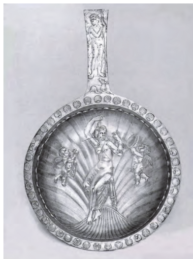
Fig. 14 Silver scoop discovered on the Esquiline and dating back to the 2 nd half of the 4th century AD.

phin – at least this is the interpretation of the archaeologists who discovered it (fig. 15) 62 . A smiling Aphrodite rides one hippocamp of a group of two, on a Ptolemaic sardonyx cameo. The wind blows the veil wrapped around her left arm and right leg above her head, revealing her naked body (fig. 16) 63 . This identification was also suggested for a Roman