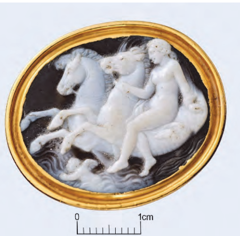
Fig. 16 Cameo representing Arsinoe IV or Berenice IV (?) as Aphrodite, BNF Cabinet des Médailles Luynes.1 (inv.116), middle of the 1 st century BC.

οὐ[χί λίθο]ς στίλβους ἄγαν ἄργυρον, ἀλλὰ θαλάσσης Περσικὸν αἰγιαλῶν ὄστρακον ἐνδέδεται, οὖνομα μαργαρίτις· ἔχει δ' ἐν γλύμματι κοίλωι