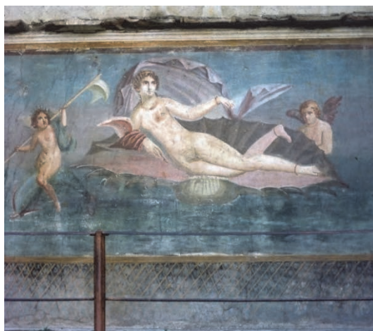
Fig. 11 Pompeii Fresco II.3.3, house of Venus in the shell, southern wall and 8 th peristyle; 4 th style, 62-79 AD.

One of the most beautiful sea snails, the ' nereites ' (nerite) – that we still identify as a member of the Neritidae family – was born from the metamorphosis of one of Aphrodite's / Venus' lovers. The snail represented in the sea, under the feet of our rider, could be one of