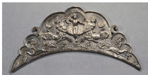
Fig. 21 Silver handle of a dish of the 2 nd -3 rd century AD

Allan dish (Montélimar, France, fig. 21) 79 : Venus appears from a shell supported by two different Tritons, while two dolphins, two Erotes and other maritime animals surround her. One notices here the same number of companions and auxiliaries, comprising a small procession, which has an almost similar composition between the end of the 2 nd and the beginning of the 3 rd century AD. Only the vehicle and the gestures that would have allowed an identification of the goddess are different on our plate. This is why, I think, an ancient viewer would never have identified Aphrodite / Venus on the Yenikend plate.