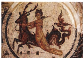
3 - N° 53. Médallion 21.