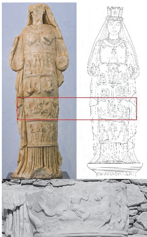
Fig. 13 Ancient copy of Aphrodite's cult statue found in the Bouleuterion, Aphrodisias, 2 nd century AD.

phin – at least this is the interpretation of the archaeologists who discovered it (fig. 15) 62 . A smiling Aphrodite rides one hippocamp of a group of two, on a Ptolemaic sardonyx cameo. The wind blows the veil wrapped around her left arm and right leg above her head, revealing her naked body (fig. 16) 63 . This identification was also suggested for a Roman