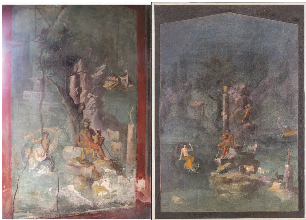
Fig. 27 Two frescoes of the 3 rd Campanian style, showing the love between Galateia and Polyphemus, one from Pompeii I,7,7, house of Amandus the priest, triclinium b, southern wall.

humans. During the 2 nd century AD, Galateia's passion was famous enough to open the series of Lucian of Samosata's Dialogues of the Sea Gods : just like the mother, Doris, the public seemed ready to listen to arguments in favour of a sentimental relationship between the Nereid Galateia and the Cyclops. Aulus Gellius ( Attic Nights 9.9.4-6) compared the erotic provocation of flung apples in Theocritus ( Idylls 5.88-89) and Galateia's mention by Vergil ( Bucolica 3.64-65). In 3 rd century AD Egypt, at the beginning of Athenaeus of Naucratis' Banquet of the Sophists , (1.11 6e-7a), the participants learn the story of the myth of Galateia and Polyphemus: in the first half of the 4 th century BC, Philoxenus of Cythera, in love with one Galateia, mistress of Dionysios, tyrant of Syracuse, composed a poem that played an important part in the tradition about the Nereid. Therefore, as late as the 5 th century AD, Nonnus is not an isolated witness of late prolongations of these traditions: in sophisticated, well-educated circles, until the end of Antiquity, Galateia remained an elegant symbol of beauty and feminine eroticism 95 .