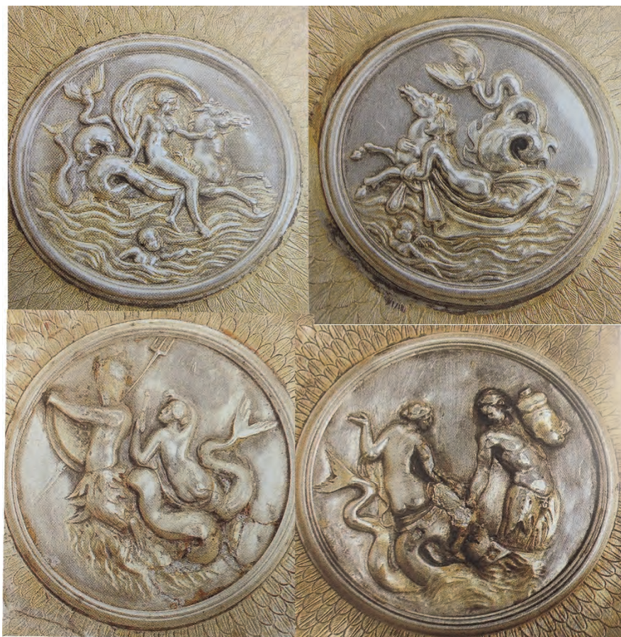
Fig. 6 Five silver medallion plates with Nereids from the Sadovyi treasure.

The same combination appears in the decoration of tableware and in thematic series such as that of the Sadovyi kurgan (1 st century AD, Fig.6) 25 .