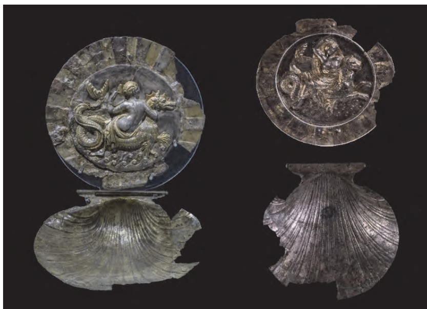
Fig. 3 Silver cosmetic box in the shape of a St. James shell, 2 nd half of the 3 rd century BC.

the drawings 20 . Representations of Nereids can therefore be compared to the evolution of the iconographic types of the three Charitai / Graces, the companions of Aphrodite / Venus, who exposed their completely naked bodies front and back, as sanitary divinities of the baths, from the beginning of the Roman imperial epoch 21 . Born of the dreams of sailors, who imagined the seduction and dangers of the sea in