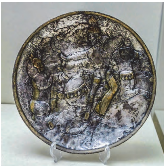
Fig. 29 Silver Sasanian plate with a royal hunt, 3 rd century AD.

elites were more attracted by the Greco-Roman culture, seems real, despite the geographical and historical (dynastic, diplomatic, cultural) links between these two kingdoms and with Armenia (a Roman client kingdom or even province) 109 . We lack the sources to answer modern questions about the very complex history of this neighborhood. Therefore, we cannot know if our plate was obtained directly from the Romans or if it was bought or taken from a neighboring zone, following commercial or diplomatic exchange or conflict. In any case, although rare, such a discovery is not totally surprising: the Caucasus has always had an extraordinary strategic importance and Rome was fully concerned with Caucasian issues during the centuries of its maximum expansion.