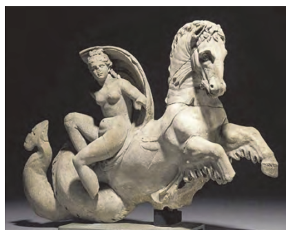
Fig. 12 Marble statuette in private collection.

(dir.), Trésors d'orfèvrerie gallo-romains. Musée du Luxembourg – Paris 8 février – 23 avril 1989 , Paris, 1989, p. 149 (nr. 95), 169-171 (nr. 115-116).