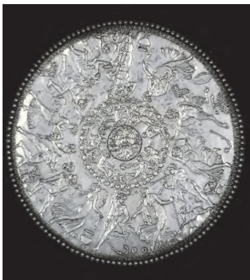
Fig. 8 The main dish of the Mildenhall treasure.

Nereids came together with Erotes , dolphins and other marine fauna. These companions drew attention to the Nereids' power of seduction, or evoked their mythical and transgressive unions with gods, monsters or men 27 . These literary and iconographic traditions remained alive until the end of Antiquity, in a Christian context, as shown by the great Dionysian dish of the Mildenhall treasure (actually discovered at West Row, Suffolk, UK in 1942, along with 34 other pieces of Roman silver tableware, preserved in the British Museum, Fig. 8) 28 . Around Oceanus' (the cosmic river's) head, within a circle marked by scallop shells, there is a series of four Nereids, two of whom ride a hippocampus and a deer seen from both front and back, while interposed among