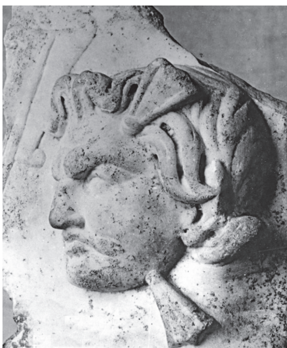
Fig. 25 Double-faced relief with a Triton mask on one side; 2 nd century AD.

The young, beardless Tritons, with short locks, a belt of scales shaped like acanthus leaves around their waists – as one can see already in Pergamum and as reproduced during the 1 st century AD (fig. 24) – also fits a date early in the Empire. This was a period when the older type of bearded Triton or the ichthyocentaur, recalling the Old Man of the Sea and his metamorphic skills, had not yet returned to fashion. Also, a hairstyle for the marine gods tangled with seaweed and crustaceans, familiar on Hispanic and African mosaics, was not yet widespread 92 . The torsos of the Tritons are not yet covered by scales – as described by Pausanias (9.21) and as we see on monuments of the 1 st -2 nd century AD: this is probably a sign that the artist wanted to remain close to his late Classical models (fig. 25) 93 .