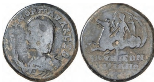
Fig. 17 Coin of Iulia Paula (218-222 AD) from Claudiopolis (Bithynia)

No glint of silver on every side, nor is it [stone] that's mounted here, but Persian shell from the shores of the sea – call it mother-of-pearl: and cupped in the hollow of it