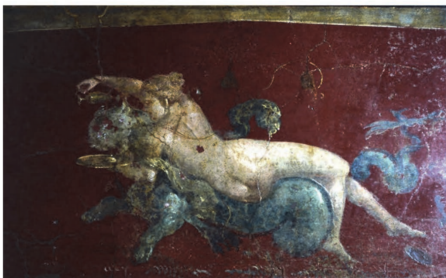
Fig. 4 Fresco of the Villa Arianna in Stabiae, antechamber 8; 4 th style, 54-68 AD.

the form of the Other – pretty woman and / or monstrous animal – the daughters of the Greek god Nereus appear as models of feminine beauty, just like Aphrodite / Venus and the other marine goddesses, in contrast to the strangeness of the fantastic beings who bear them on the waves. Favorable and pleasing to the gods, heroes, humans and animals of all kinds, the Nereids symbolize the attraction of multiple crossings, from one shore to another of the sea or from one end to the other of one's