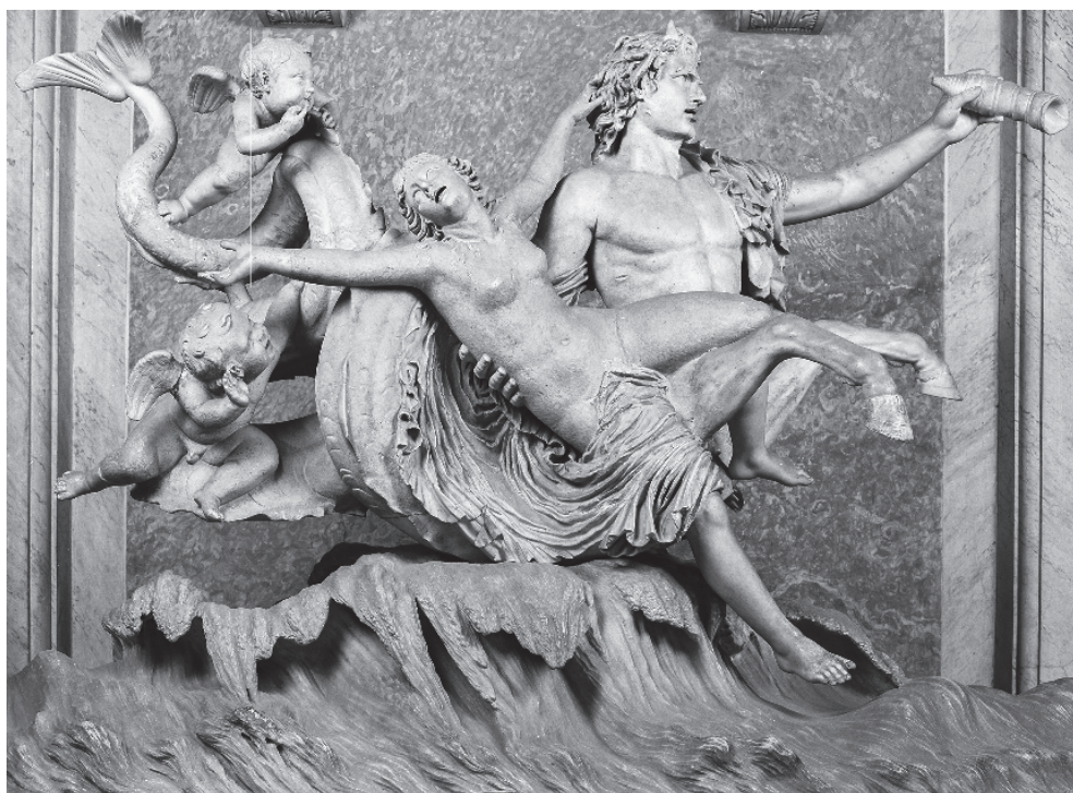
Fig. 22 Hellenistic statuary group composed of a Nereid, a Triton and two Erotes

Gates, was not far from the Ocean and the Underworld – as imagined by the ancient Greeks and Romans. Nonetheless, there is nothing to prove that the deposit of this plate in the tomb was related to the Nereids' funerary function.