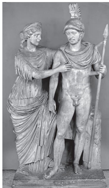
Fig. 18 Statuary group with Venus of Capua and Mars

Faustina reproduced the statue of Venus Genetrix on the reverse of many of her coins, sometimes together with a rudder and a dolphin (fig. 20). Yet, regardless of this wide diffusion of representations of maritime Aphrodite from the second half of the 2 nd century AD, none of the known representations differs from the iconographical stereotypes going back to Late Classical and Hellenistic times, and none looks like the women on our plate. Even if the goddess is represented as a Nereid, in a similar attitude to that of our plate (but half covered and