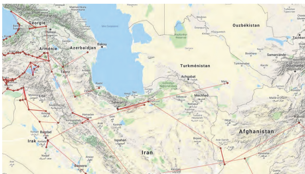
Fig. 30 Reconstruction of the network of paths following the Tabula Peutingeriana

Peutinger Table is important proof of a network of paths, which made possible, at least at some time, the indirect transportation of exotic products across Asia beyond the Taurus (fig. 30).