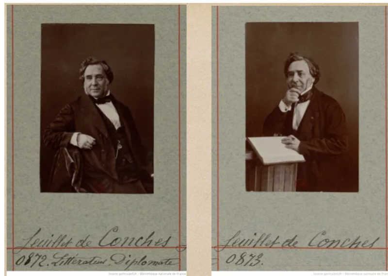
Feuillet de Conches

Counterfeit artists soon learned to avoid such material blunders and to use period-appropriate paper. The master in this domain was undoubtedly Félix-Bastien Feuillet (1798-1887), whose manifold activities are familiar to connoisseurs but deserve to be more widely known. Feuillet, a tanner's son who styled himself "de Conches" (based on his mother's maiden name), was a lifelong employee of the French ministry of foreign affairs, rising up the ranks to the position of chief of protocol and introducer of ambassadors during the Second Empire. An eloquent art historian and self-proclaimed curieux , he was the most voracious and celebrated manuscript collector of his generation, although he saw his reputation attacked by allegations of theft and forgery. In the 1860s especially, he was publicly accused of fabricating numerous letters by Marie Antoinette and her entourage. His contemporaries were apparently less aware of the fact that, since the 1840s at least, he also excelled at producing fake autographs of seventeenth-century French writers, in particular the great "classic" poets La Fontaine, Boileau, and Racine. 1