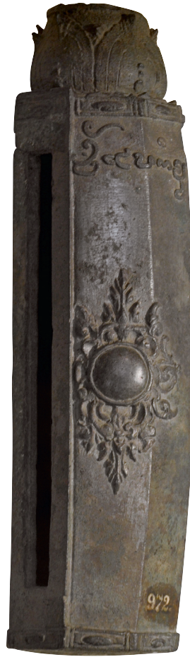
Figure 11. — Slitdrum (2c), possibly 1322/1323 CE, Mojokerto, East Java. Bronze, H. 26 cm; D. 7.1 cm. MNI, 972.

(c) Jakarta, MNI, inv. no. 972; h. 26 cm, diam. 7.1 cm; found in Mojokerto, East Java. 114 Inscription applied in relief in relatively simple Kawi script along its top. Photos together allowing the whole inscription to be read have been published in THOMSEN 1980, no. 38; FONTEIN, SOEKMONO & SATYAWATI SULEIMAN 1971, no. 86; MIKSIC & ENDANG SRI HARDIATI SOEKATNO 1995, no. 52. Our fig. 11 shows all but the final akṣara . All the publications of this specimen repeat the result obtained by Brandes (in GROENEVELDT 1887, p. 248, n. 1):