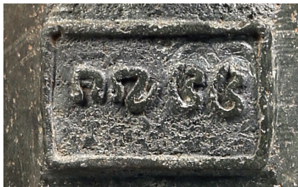
Figure 13. — Slitdrum (2e), 1422/1423 CE. Bronze, H. 43 cm. Private collection, USA.