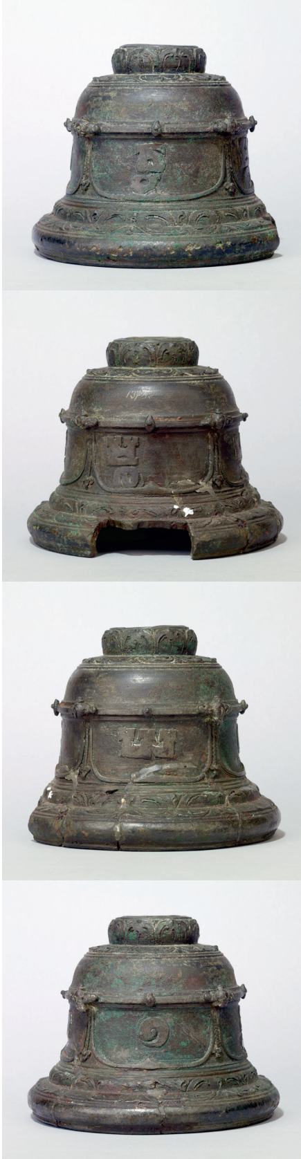
Figure 5. — Bell (1k), 10 th –11 th century, Java. Bronze, H. 13.9 cm; D. 16.5 cm. Acquired by Wolf Curt v. Schierbrand (1807–1888), before 1865. Museum für Völkerkunde Dresden, Staatliche Kunstsammlungen Dresden, 1378.

(k) Dresden, Museum für Völkerkunde, cat. no. 1378; h. 13.9, diam. 16.5 cm; photograph published in MEYER 1884, Tafel 5, no. 8, showing only the spiral punctuation sign. Inscription in relief (fig. 5) using the same type of script and punctuated again by the same spiral sign as observed on 1.1j above. It was read vṛmmaya by STUTTERHEIM 1924, p. 290, who did not understand what this might mean. The correct reading is clearly dhṛmmaya . While the variation ra/r̄ after a consonant is very common in Old Javanese manuscripts and inscriptions (e.g. the word dravya spelled as dṛvya ), variation ar/r̄ before a consonant seems to be much rarer. Still, the word dhṛmma here can only be interpreted as a spelling variant of dharma , 63 and ya can be interpreted as a pronoun. 64 If we are correct in separating ya , and if we take into account for dharma the meaning ‘donation’ (cf. Malay/Indonesian derma ), which certainly existed in Old Javanese even though it is not clearly recorded in OJED , 65 then the sense might be ‘this is a donation.’ Alternatively, the inscription might be read as a single word, representing in idiosyncratic shape the word dharm(m)āya , in which case it means ‘for the sake of dharma .’