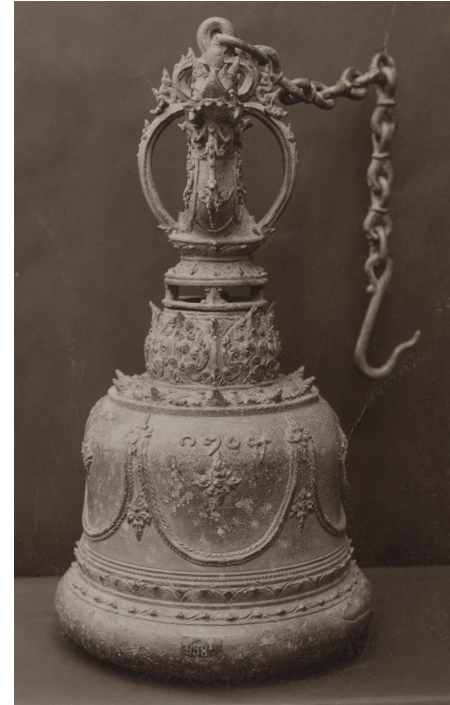
Figure 3. — Bell (1g), 1286/1287 CE, Gunung Grongga, East Java. Bronze, H. 39 cm; D. 21 cm. Formerly Museum Batavia, 958f. Photograph OD 1628, courtesy of the Kern Institute collections, Leiden University Library.

are visible; a picture of the other side, which bears the first letter, is not available. Both letters preceding the ng are quite unclear on the photo. [...] I read: rgatang ; gatang probably stands for gantang = to hang, hanging bell; the first letter, on the other side of the bell, is therefore likely to have been a b with pēpēt , and the complete inscription should be: bērgatang . 60