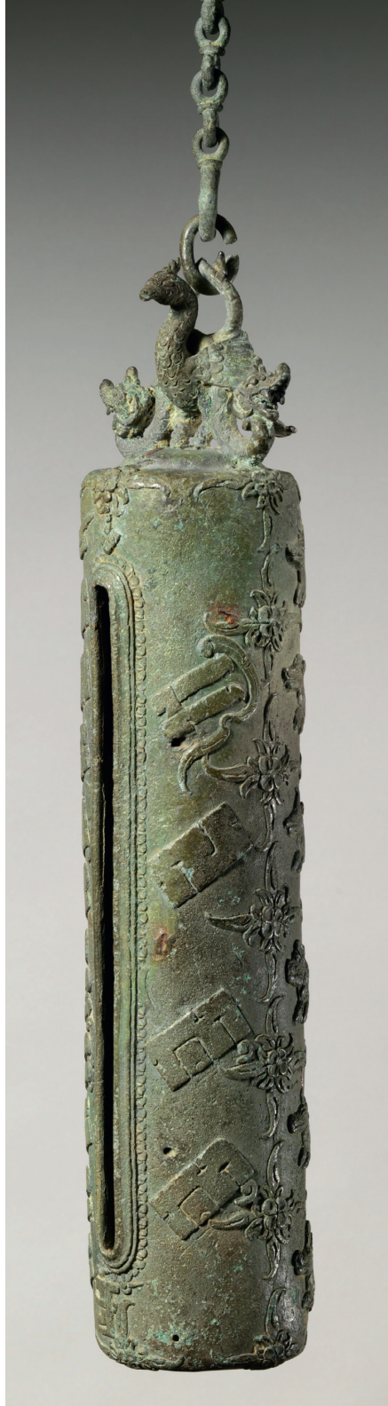
Figure 14. — Slitdrum (2f), 13 th –14 th century. Bronze, H. 43.8 cm. MMA, 1987.142.31.

we see on specimen f below. But otherwise this slitdrum is unusual for both its shape and its near total lack of ornament. The fact that it stands out from all other