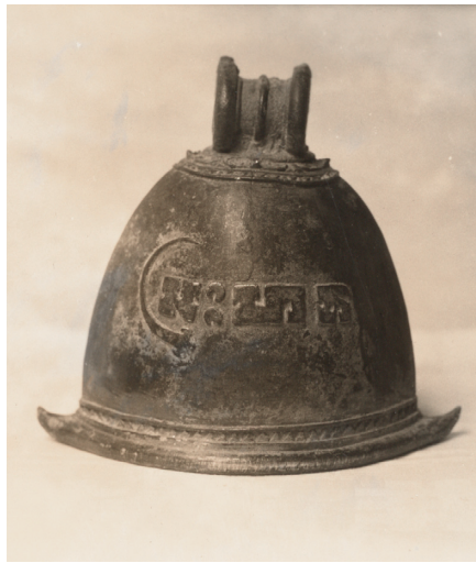
Figure 7. — Oval bell with clapper, 950–1050 CE, Campurdarat, East Java. Bronze.

possibly intended as a passive irrealis of the verb sumrahi (base srah ), meaning ‘to be entrusted with.’ 78