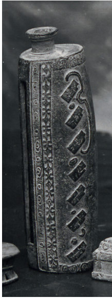
Figure 17. — Slitdrum (2i), 13 th –14 th century, Pura Penataran, Sukawati, Gianyar, Bali. Bronze, H. 25 cm. From photograph OD 9071, courtesy of the Kern Institute collections, Leiden University Library.

OD 9071 (OV 1928, p. 52), an extract from which is here reproduced as fig. 17 . Nothing seems to have been published about this specimen besides the very brief remarks in OV 1927, p. 109, and the inscription applied in relief from bottom to top in quadrate script, visible to the right of the slit in the OD photo, has not yet been deciphered. We tentatively read sañ lumlañ i patik ‘The one that vanished in Patik.’ This is reminiscent of the frequent designations of deceased kings as sañ mokta riñ PLACE NAME and similar expressions, commonly found in Old Javanese inscriptions and literature. 126 It seems less likely that we are dealing again with a name for the object.