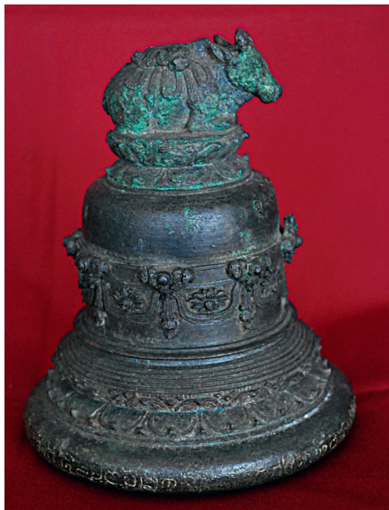
Figure 1. — Bell (1a), 3 February 906 CE, Tlogopakis, Jawa Tengah. Bronze, H. 16.5 cm; D. bottom 14 cm; D. top 7 cm. Pusat Arkeologi Nasional, PUSPAN/AK/Pr/b.1.

Text: 51 °im śaka 885 cetramāsa, tithi pratipāda śukla, °irikā divāśa rakryān