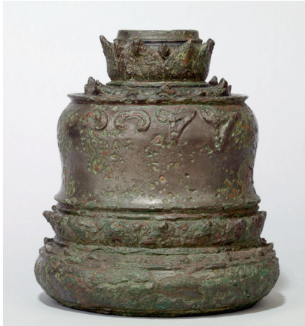
Figure 2. — Bell (1d), 1266/1267 CE, Java. Bronze, H. 17 cm; D. 4.8–12 cm. Acquired by Wolf Curt v. Schierbrand (1807–1888), before 1865. Museum für Völkerkunde Dresden, Staatliche Kunstsammlungen Dresden, 1379.

(d) Dresden, Museum für Völkerkunde, cat. no. 1379; h. 17 cm, diam. 4.8–12 cm; photograph published in MEYER 1884, Tafel 5, no. 9. Inscription in relief, correctly read by STUTTERHEIM 1924, p. 290 as the Śaka millésime 1188, i.e. 1266/1267 CE (fig. 2).