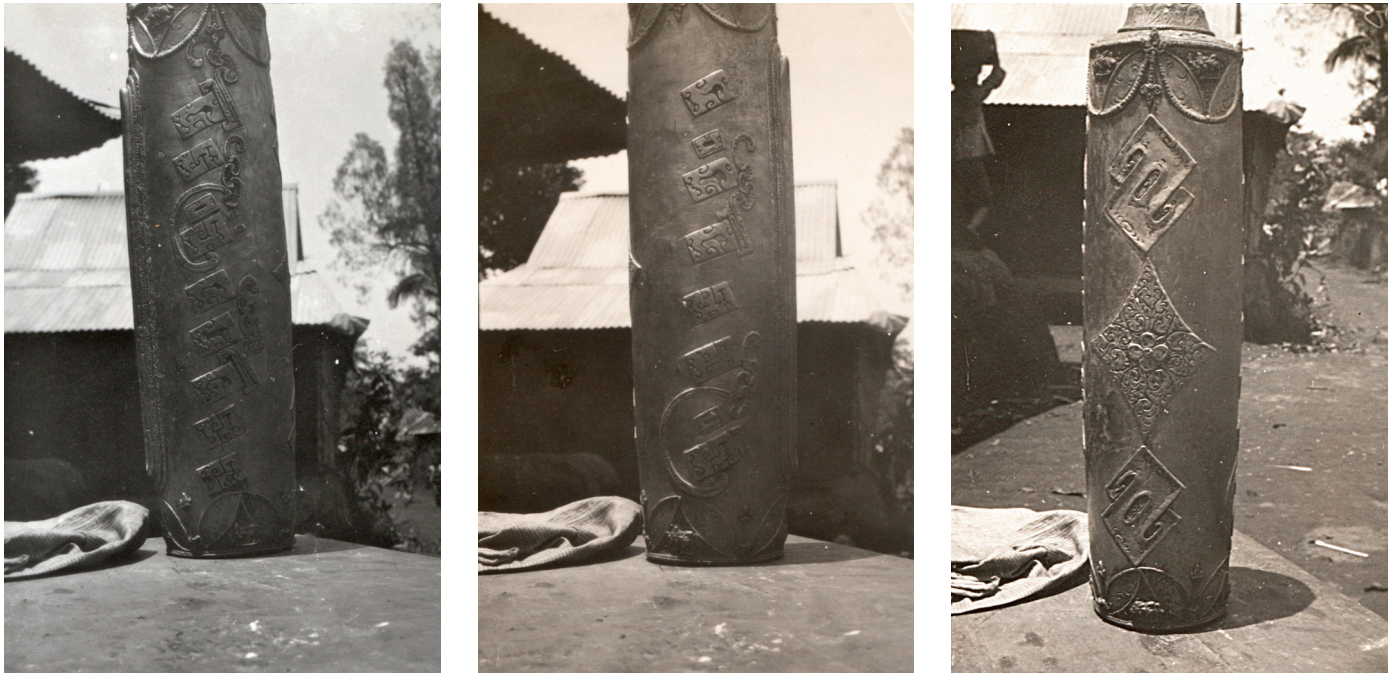
Figure 18. — Slitdrum (Zi), 14 th –15 th century (?), Pujungan, Bali. Photographs OD 10896, 10899, 10900, courtesy of the Kern Institute collections, Leiden University Library.

and ‘East Javanese’ material culture, and certainly did not coincide with the arising of those differences. Well into the reign of Sindok, artistic and epigraphic practices show continuity with the preceding period. The changes in the manufacture of bronze utensils that took place subsequently do not concern only ornamentation applied to such utensils, but also the nature of the inscriptions applied to them, the technique used for applying inscriptions, and even the types of utensils that were manufactured to begin with.