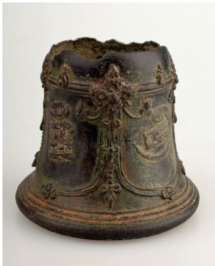
Figure 6. — Bell (1), 1050–1150 CE, Java, Indonesia. Bronze, H. 9.5 cm. Leiden, Rijksmuseum voor Volkenkunde, 1630-42.

is decorated with a simple thick moulding with corners flapping up at the sharp angles. The top is a suspension ring or a tube, usually on an ornamental border, often of lotus petals, made separately and then welded onto the body. The opening of the tube runs in the direction of the long axis of the oval section. When suspended on a cord or chain one of the long sides of the bell will touch the body of its wearer, probably an elephant, or perhaps a horse. The clapper is a ball on a chain decorated at the bottom with tiny additions.