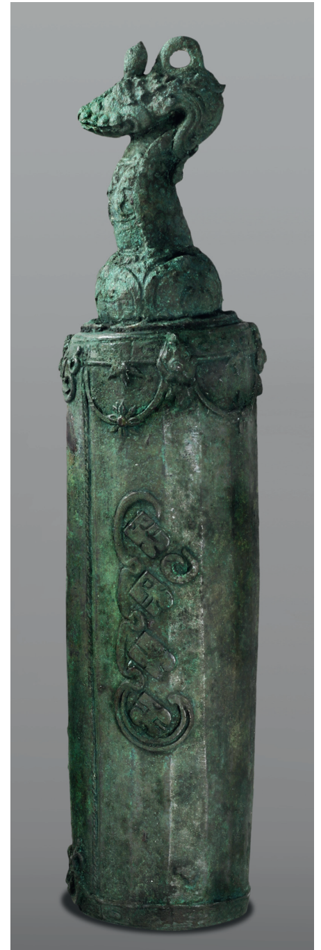
Figure 16. — Slitdrum (2h), 13 th –14 th century. Bronze, H. 35.9 cm; D. 9 cm. Private collection, USA.