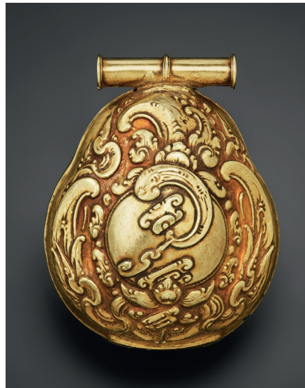
Figure 9. — Pellet bell with terrifying head, 13 th –14 th century. Gold, H. 6.6 × 5.2 × 4.4 cm. Yale University Art Gallery, 2008.21.119.

decorative motifs are applied almost symmetrically. On one side we find a large one-eyed kāla head with three additional teeth (cf. the detail of slitdrum 2g in fig. 15 ). 96 The central bulging eye is represented as three circles, diminishing in size towards the inside and touching at their bottom tip. Along the bottom line of the bell, meanders are intertwined with the teeth and fangs of the kāla head. The bulging eye is crowned by four lotus petals, with irregular curves above them. The other side has almost the same decoration but without the teeth at the bottom. Additionally the bulging eye, here one central circle, is covered by one short meander and some elegantly curving calligraphic characters. These motifs belong to the East Javanese and, more specifically, to the Singasari-Majapahit period.