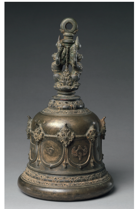
Figure 4. — Bell (1j), 950–1050 CE, Java, Indonesia. Bronze, H. 34.9 cm. MMA, 1987.142.182a, b. Bronze, H. 34.9 cm.

But here we rather have what in correct Sanskrit would be sarveṣṭagaṅa (i.e. sarva-iṣṭagaṅa ), meaning ‘all desirable qualities.’ We tentatively propose to see in the word sarva ‘all’ a connection with the function of