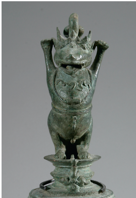
Figure 12. — Slitdrum (2d), top piece dated 1324/1325 CE. Bronze, H. 35.6 cm; D. 7.6 cm. San Francisco, Asian Art Museum, 2010.553.