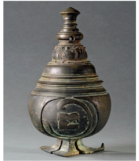
Figure 8. — Pellet bell on three feet, 950–1050 CE, Java, Indonesia. Bronze, H. 20.3 cm. Private collection, Amsterdam. Photographs courtesy of the Documentation Centre for Ancient Indonesian Art.

A hole is made in the very upper tip to insert a suspension ring or cord. The bell can hence stand on its own or be suspended. Its shape resembles a fruit, probably a breadfruit ( artocarpus altilis ). 86 It is easy to understand how a dried breadfruit with its seeds could serve as a sound-making device. In the Central Javanese period this came to be imitated in metal. Some early items still show explicit representations of their model. 87 Later copies, like the inscribed one we present below and a very similar one without inscription, 88 no longer show it. 89 Measurements vary from 13 to 20 cm in height. 90