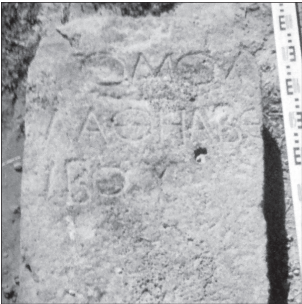
2. Epitaph of Gomollathe, Daughter of Abeibos.