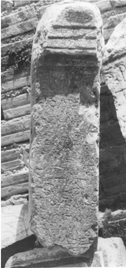
Fig. 22.5. Larissa Museum inv. n. 318 - IG IX 2 1040 c