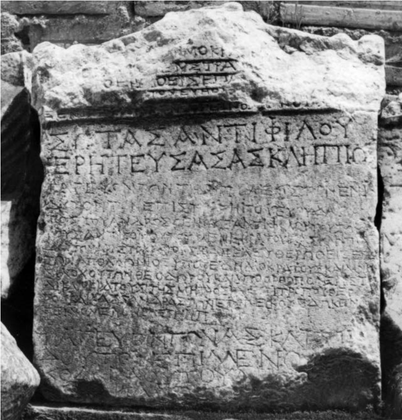
Fig. 22.4. Larissa Museum inv. n. 318, front face - IG IX 2 1040 a-b