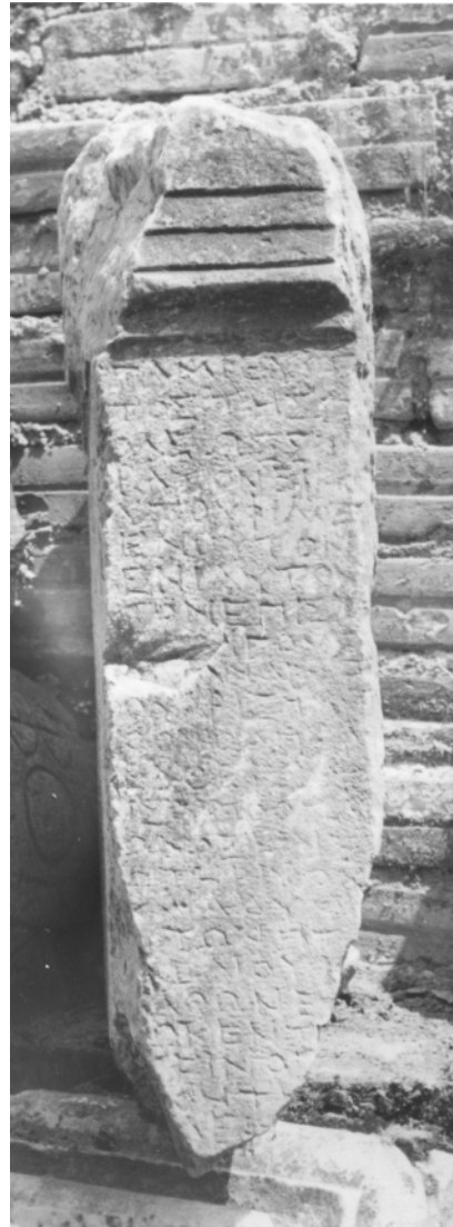
Fig. 22.6. Larissa Museum inv. n. 318 - IG IX 2 1040 d

run across several objects or fragments? The recommended practice taught in the EpiDoc training sessions 16 is very flexible, permitting the use of the textpart subdivision both for purely textual units or text areas