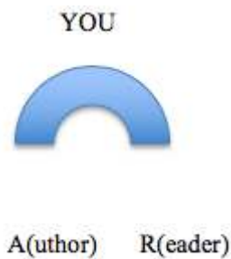
FIG. 4: ETHICAL SHARING OF EXPERIENCE THROUGH "YOU"