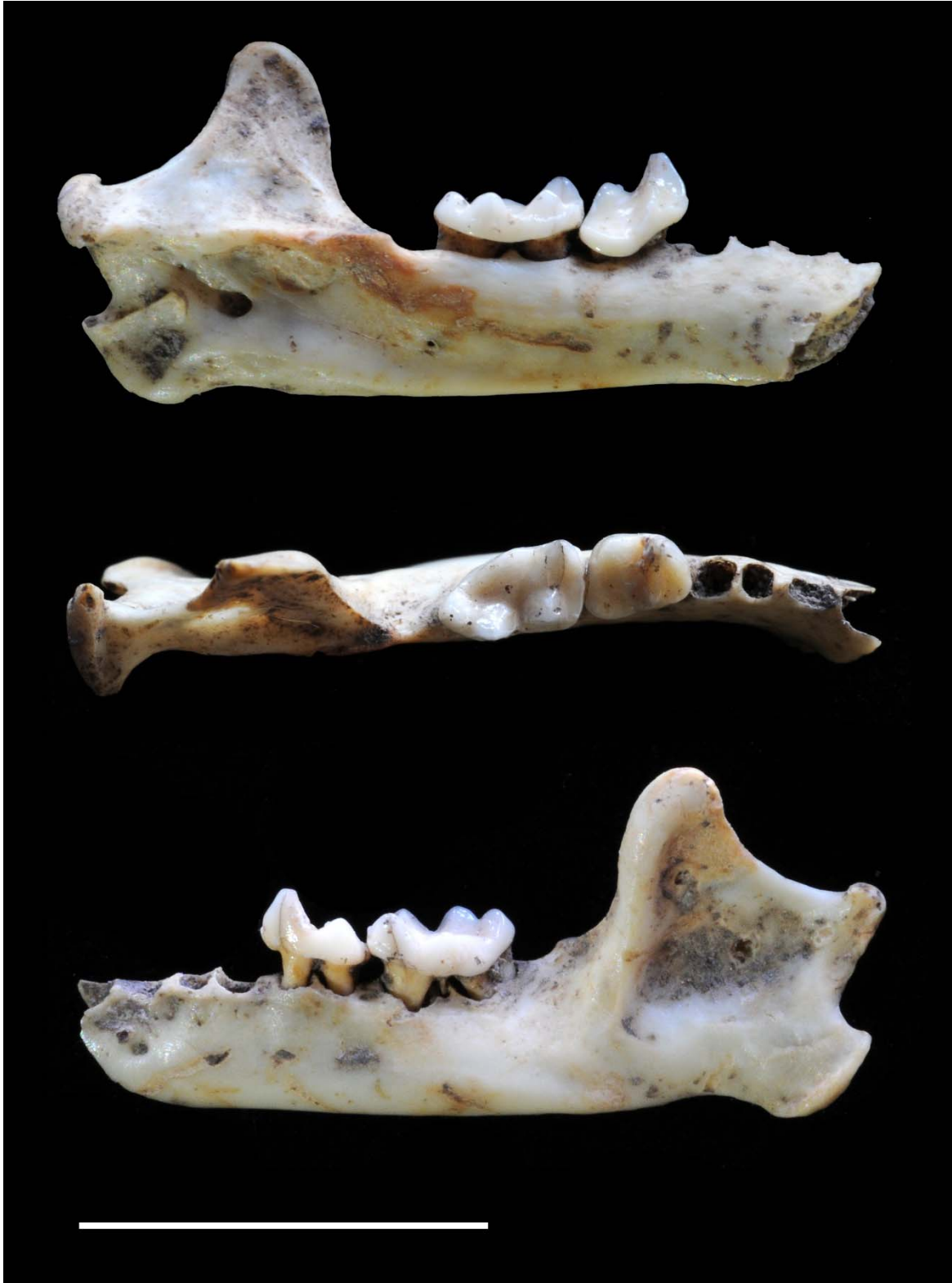
FIG. 1. Lateral, medial and occlusal views of left dentary of C. improvisum (FOL 00-C001) from the pre-Columbian site of Folle Anse, Marie-Galante (F.W.I.). Scale bar = 10 mm