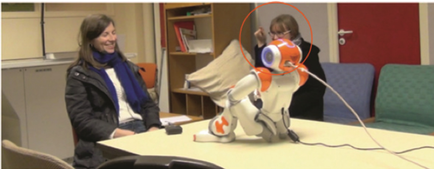
Fig. 2. Multimodal byplay from the participant’s friend

Broadly, as the participants are provided several times with ‘their’ measures during the game, we observed that one thing they could do is ordering them in a temporal frame. Like in this extract (2), participants can use the new measure to proceed an update/summary. Let’s focus on P2’s behavior. As P is provided with her measures from N, P2 is drawing in the air a curve (Fig. 2). This curve accounts for an analysis of P’s heart rate evolution. This metaphoric gesture [33] is achieved during the stream of N’s speech that is directed towards P. Therefore, insofar as the primary exchange is the one between P and N, P2’s conduct is configured as a secondary scene or byplay [20]. This byplay functions as a co-expressive way to deal both with her friend’s reflexive turn, and with the specific participation frame [21].