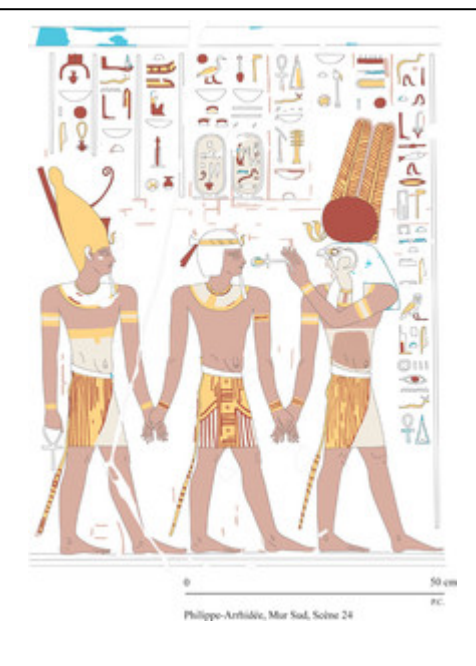
Figure III.3.2. Karnak, outer southern wall of Philipp Arrhidaeus' bark shrine.

For publications concerning temples, having the handcopy accompanied (alongside it, if possible) by a normalized digital version of the hieroglyphs (online, with critical apparatus), a layout plan (of the temple and the wall), and finally a photographic copy gives the reader access to all the information essential for Egyptology (Karkowski 2003; Thiers 2003; Jordan, Bickel, and Chappaz 2015; Biston-Moulin and Thiers 2016; Figure III.3.3). This is a major improvement over typographical editions offering only the typography (old lead cast or digitized) running from right to left (Edfu, Dendera, Kom Ombo, Esna, Athribis) or traced editions (Opet, Deir Shelwit, Tod I) accompanied by an indicative summary of the iconography or the scenes depicted—but without taking into account the hieroglyphs—and sometimes by layout plans. An intermediary method of presenting a proportional copy showing the hieroglyphs as arranged in the original scene (Traunecker 1987) but usually separating them from the iconography (Coptos, el-Qal'a, Qasr elAguz) has also been proposed. All these methods proved their worth during the time they were used, in terms of not only the scope of the task in hand but also the readability of the reliefs studied and the economic constraints of publications.