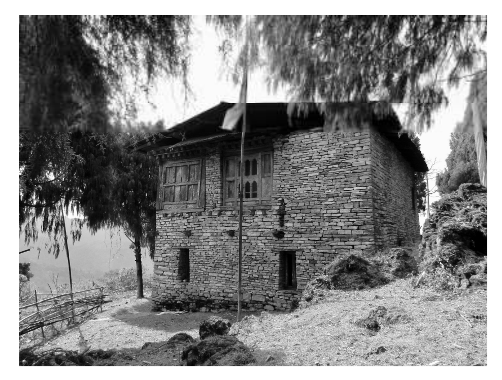
The stone house of the Khoche

Every three years a household from each class is nominated to stay in the respective 'class house' near the temple. That household takes care of the respective house and fields for three years. After the term the tenant goes back to his/her own house and land, and another 'class tenant' of the same class takes over. These community houses have two kitchens so that two families can stay in the house and cook separately. This relates to the fact that the rotation system is extended beyond the three-year term and a fixed transition period exists. The class house is not only inhabited by the family serving the three-year term but also. for one and a half years, by the family who served the term before; this family helps the new tenant with the transition of responsibilities. In other words, a newly chosen tenant family first shares the house with the 'old' tenant for one and a half years, then the old tenant leaves and the 'new' tenant family lives in the house on its own for three years and then for another one and a half years it shares the house with the next newly chosen tenant family. This means that each family nominated to be the class house tenant actually lives in the house for a total of six years. A three-year tenure ends on the 30th day of the 12th Bhutanese