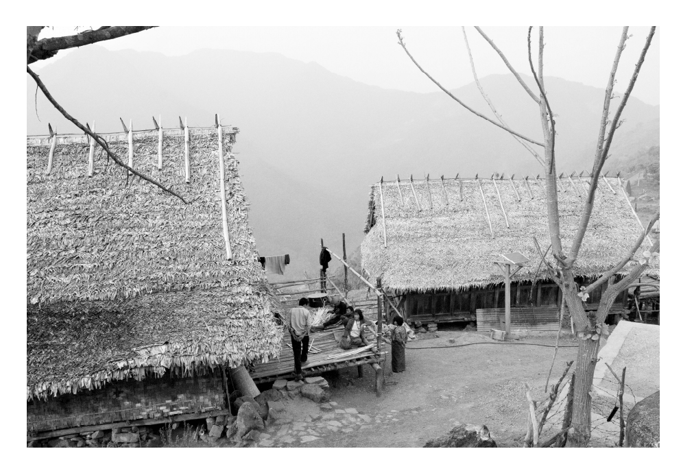
Lhamenpa and Brela houses around the temple

month. The new tenants' arrival is celebrated with a feast and a pig killed by the people of their class. All the class tenants are responsible for initiating activities taking place in the temple. They must also take care of renovating and replacing the roof of the house and contribute financially or in kind to the yearly festival of mchod pa la . The people of their own class construct and renovate the three class houses.<sup>11</sup>