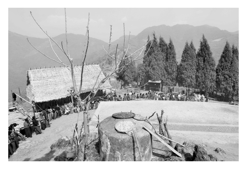
Ngangla Trong community waiting for the Gantey Trulku near the temple

over by the jungle. Often an elderly person is left in the house to take care of it but then the food rations have to be provided.