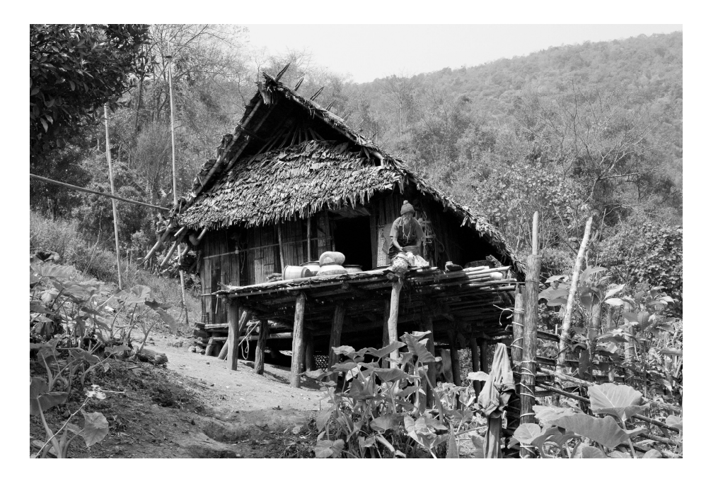
A traditional house in the vicinity of Ngangla Trong

The climate of Ngangla Trong is pleasant and dry in the winter, from October to March, but the area is subject to very strong winds from north and south. In the rainy season, which starts as early as April and lasts till September, the weather is terribly wet and life is difficult, with rodents, snakes, and leeches everywhere. The swollen rivers are then impossible to cross.