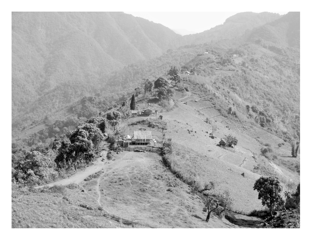
Ngangla Trong ridge