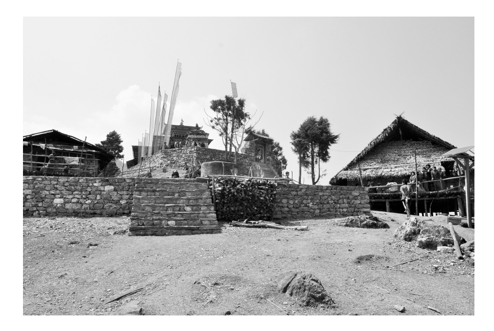
Temple and houses

We engaged you for three years, Now take the hands of our daughter ( bomey (Kh.)), Be loving and kind to her, Do not change your preferences, Do not look for other flowers; Let us not hear about quarrels, Let us not hear about divorce.<sup>17</sup>