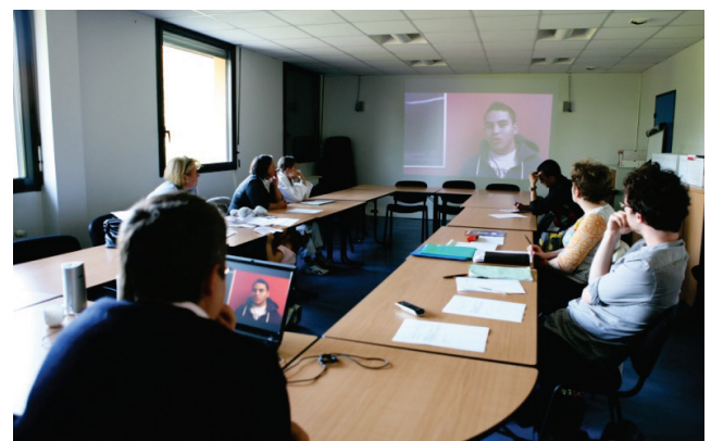
Information meeting with footage of a former college student

The costs incurred by the program are essentially those of conception and production of the DVDs and the guides made available to the principals for identifying the target students, and managing the information meetings. They are, therefore, fixed costs, which do not change with the number of pupils involved in the programme.