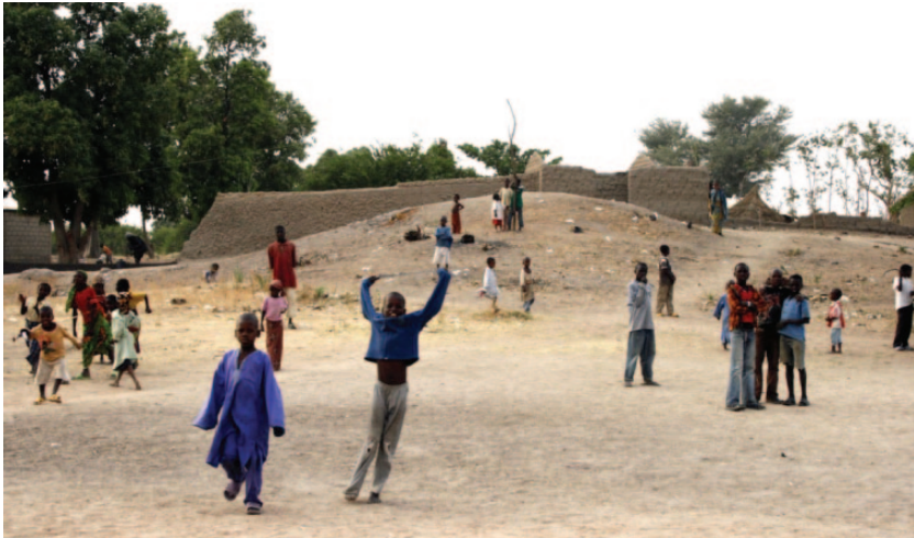
Figure 2. Great waste heap in front of the village chief's compound, Ouro Jiddere, March 2011.

In this article, I will focus on the heaps located in Kaliao which used to be the second capital town of the Guiziga kingdom of the Bui Marva (that is, kings of Marva), after the first one located at Marva (present day Maroua) had been stormed and subjugated at the end of the 18th century by Muslim Fulani raiders from present day Nigeria. Between