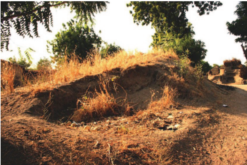
Figure 4. Great waste heap of the Bui Marva, Kaliao, December 2008.

At Kaliao, the large trash heap has been preserved up to the present day, as a last testimony of the bygone heydays of Guiziga Bui Marva sacred kingship, although the kingdom had passed onto the rule of the lamidate of Maroua (see Figure 4). Its kladings,