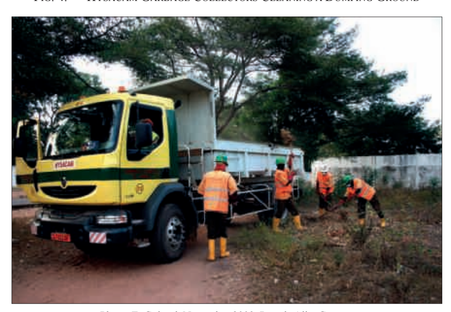
Fig. 4. — Hysacam Garbage Collectors Cleaning a Dumping Ground

This new public waste management system allowed the municipal institutions to win back a semblance of authority over both cities and their inhabitants by restoring their control over waste and limiting its invasion, especially in the main central public spaces. However, although this system is purported to be "modern and scientific," it does not seem to change either representations and, to some extent, the practices resorting to waste for sorcery purposes. Quite the opposite occurs: in an astonishing demonstration of their great plasticity, these practices continue and persist by adapting to the technical changes introduced by Hysacam.