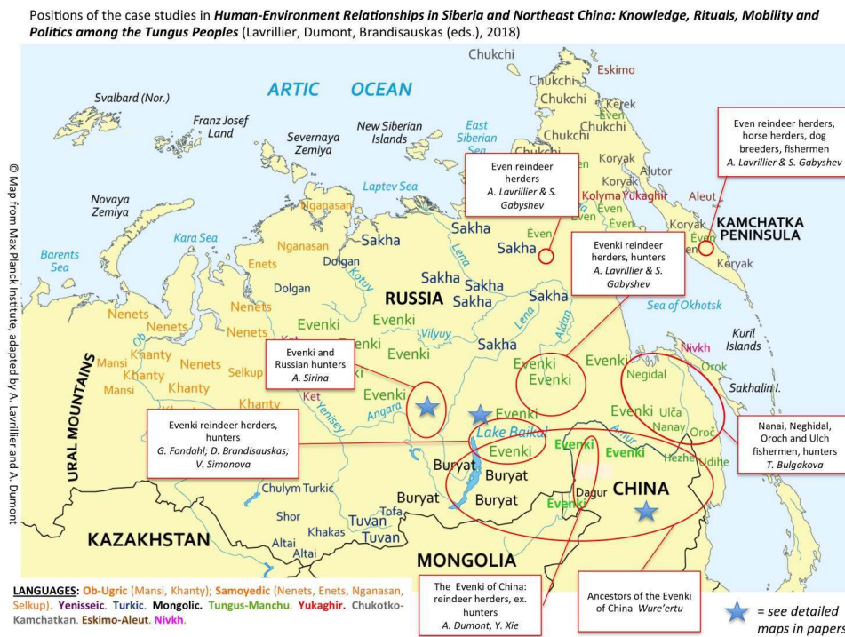
Figure 2. Positions of the case studies in the present volume

© Max Planck Institute (adapted by Alexandra Lavrillier and Aurore Dumont)