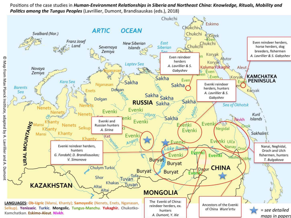
Figure 2. Positions of the case studies in the present volume

© Max Planck Institute (adapted by Alexandra Lavrilier and Aurore Dumont)