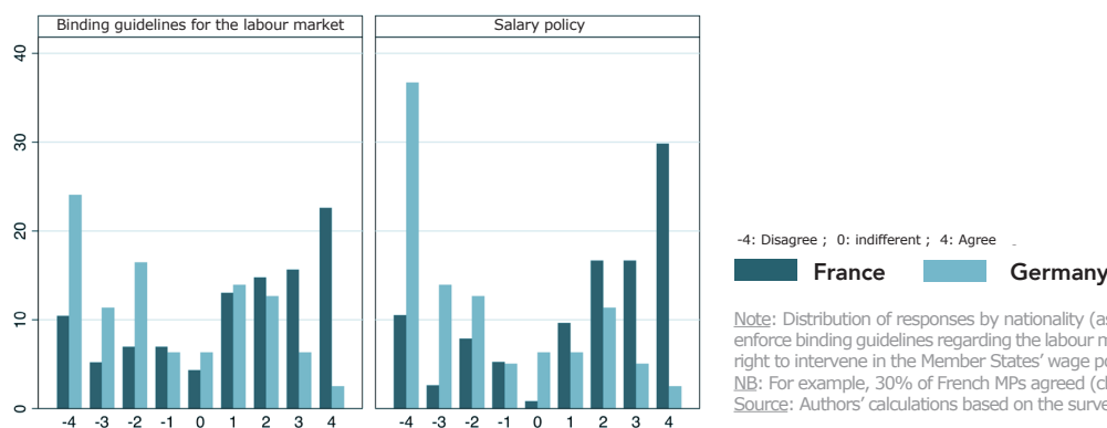
FIGURE 1: BINDING GUIDELINES RELATED TO THE LABOUR MARKET AND WAGE POLICY

Note: Distribution of responses by nationality (as a percentage) to the questions on the EU being able to enforce binding guidelines regarding the labour market on the Member States, and on the EU having more right to intervene in the Member States' wage policies. NB: For example, 30% of French MPs agreed (checked box '4') with the question on wage policy.