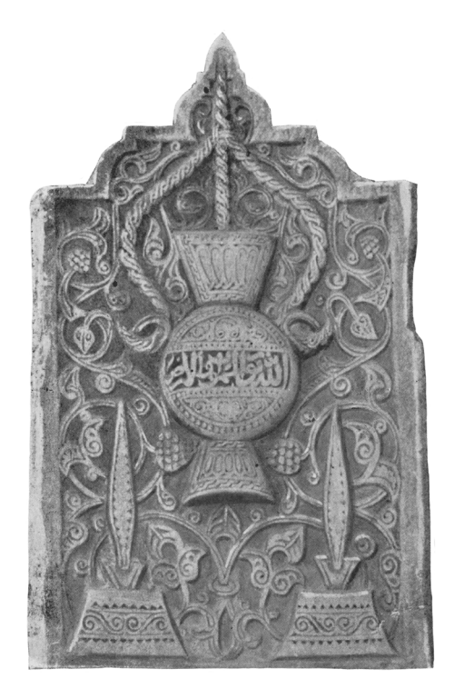
Fig.3. Hanging lamp, panel from the al-Budayriyya madrasa (Cairo, 14th c.). After HERZ BEY, M. 1896, 10, fig. I.19.

If the featured representation of a lamp can contribute to the sacralization of a space, then lights themselves can carry a divine symbolism. In the mosque, light seems in fact to represent, more than an essential or necessary object, a signature of the religious edifice itself. Thus, in miniatures, the mosque is distinguished from secular places (hotels, palaces...) by the presence of lamps suspended from the arches of the prayer room - the presence of a minbar or of a mihrab is optional (BARRUCAND, M. 1994). The identification of hanging lamps allows the reader to understand that the imagined scene is happening in a mosque. In the parchments discovered in the Great Mosque of Sana'a, figure two absolutely unique fragments that both represent a mosque. These two folios were undoubtedly placed face to face at the beginning of a Quran (GRABAR, O. 1996). In these