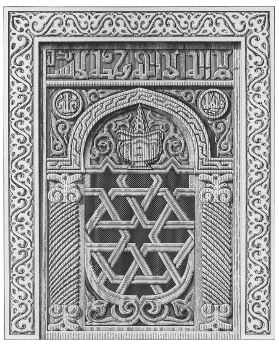
Fig.2. Lamp suspended to an arch represented on a window of the façade of al-Aqmar mosque (Cairo, 12th c.). After MOSQUES OF EGYPT, 1949, 28.

According to Doris Behrens-Abouseif, the lamp suspended in a niche that figures on a panel on the façade of the al-Aqmar mosque in Cairo ( Fig. 2 ) represents the caliph (BEHRENS-ABOUSEIF, D. 1992).