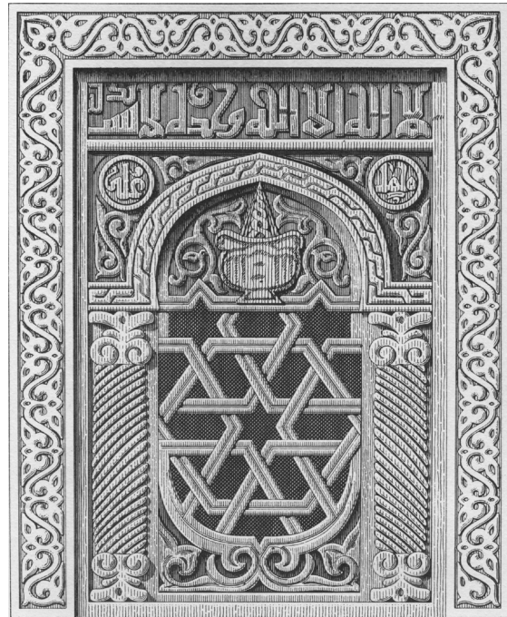
Fig.2. Lamp suspended to an arch represented on a window of the façade of al-Aqmar mosque (Cairo, 12th c.).

According to Doris Behrens-Abouseif, the lamp suspended in a niche that figures on a panel on the façade of the al-Aqmar mosque in Cairo ( Fig. 2 ) represents the caliph (BEHRENS-ABOUSEIF, D. 1992).