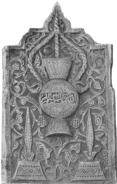
Fig.3. Hanging lamp, panel from the al-Budayriyya madrasa (Cairo, 14th c.). After HERZ BEY, M. 1896, 10, fig. I.19.

If the featured representation of a lamp can contribute to the sacralization of a space, then lights themselves can carry a divine symbolism. In the mosque, light seems in fact to represent, more than an essential or necessary object, a signature of the religious edifice itself. Thus, in miniatures, the mosque is distinguished from secular places (hotels, palaces...) by the presence of lamps suspended from the arches of the prayer room – the presence of a minbar or of a mihrab is optional (BARRUCAND, M. 1994). The identification of hanging lamps allows the reader to understand that the imagined scene is happening in a mosque. In the parchments discovered in the Great Mosque of Sana‘a, figure two absolutely unique fragments that both represent a mosque. These two folios were undoubtedly placed face to face at the beginning of a Quran (GRABAR, O. 1996). In these