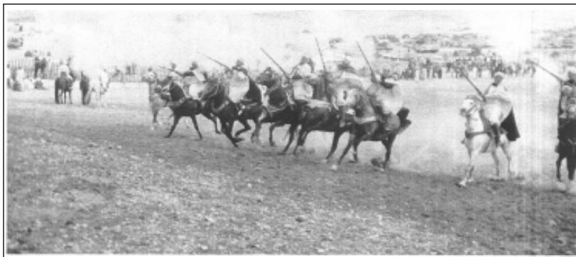
Fig. 2. Fantasia, Asla.

Cane fighting is a leisure well appreciated during the festival. The fighter's equipment is really light: usual clothes and a wooden cane. Fights are non violent. The aim of this game is to show dexterity by touching the sparring partner with the cane. It is a revival of Bedouin fights which formerly took place with Arab swords. But this game is less appreciated than the fantasia , the competition of the Bedouin cavalries (picture 2). Without contest, fantasia is the main playful celebration during the festival. It attracts numerous people. The fantasia of the Sid Ahmad Majdûb's festival is the most impressive one. Several cavalries come from the entire west Algeria in order to participate in it. The fursan (horse riders) are organized by fraction (of tribe) or by village. They all compete during the festival. Thus cavalry's competitions are also, in some manners, inter-fraction, intertribal or inter-village competitions. The cavalries of the Awlâd Nhar—a tribe located south of Tlemcen (north of Asla)—are considered the most impressive ones. Fantasia is a competition between tribes or villages but it symbolizes also the resistance's history of the region. As it was said, numerous insurrections occurred in