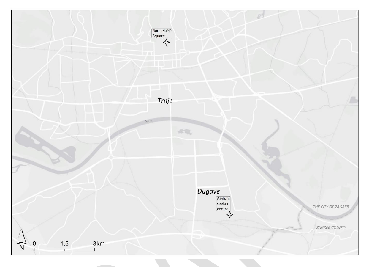
Figure 1. Locations of Dugave and Trnje neighbourhoods in relation to Zagreb's centre (Ban Jelačić Square)<sup>4</sup>

The theoretical framework of this paper is grounded on the plethora of discussions related to asylum seeker issues and general attitudes on immigration in scholarly literature. Apart from considering the way asylum seekers are depicted and the influence of socio-demographic characteristics on attitude formation, we focused special attention on contact theory, as well as theories related to group threat (conflict) hypothesis. Along with confronting the contact and conflict approach, the focus of the research is set on a location/neighbourhood framework. Finally, as stated by van Kempen and Wissink (2014), focusing the research on the residential location alone would be too narrow, given the spatial mobility of people, as well as communication technologies. In relation to this, we also pay special attention to the influence of media. Following the relevant information for the understanding the obtained results. The description of the research sample and methodology will be followed by the presentation and discussion of definitions of asylum seekers given by respondents, their first source of information on the subject of asylum, attitudes towards asylum seeker based on the dimensions of social contact, economy/health, ethnocultural similarity, asylum seeker credibility estimation, as well as attitudes based on locational attributes of asylum seeker reception.