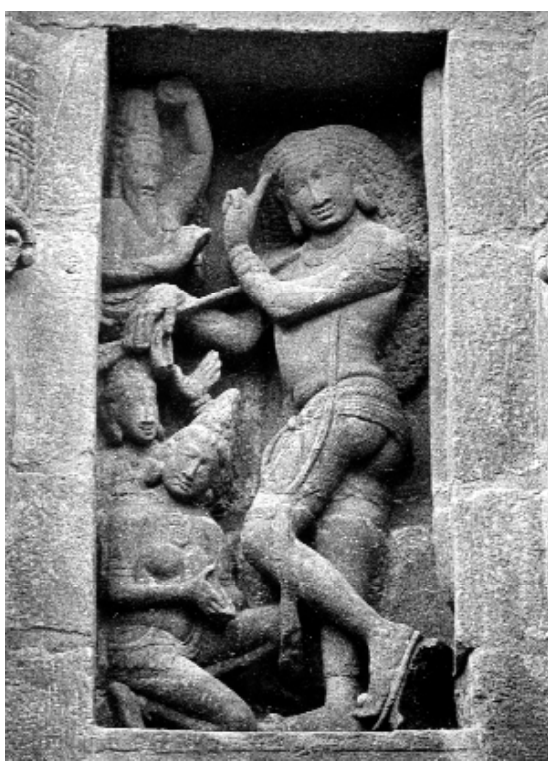
Fig. 4 – Kāñcipuram, Kailāsanātha, Bhikṣāṭana, 7th century.

demon; in either case the deity descends to earth, and it is that deity's adventures on earth which are depicted.