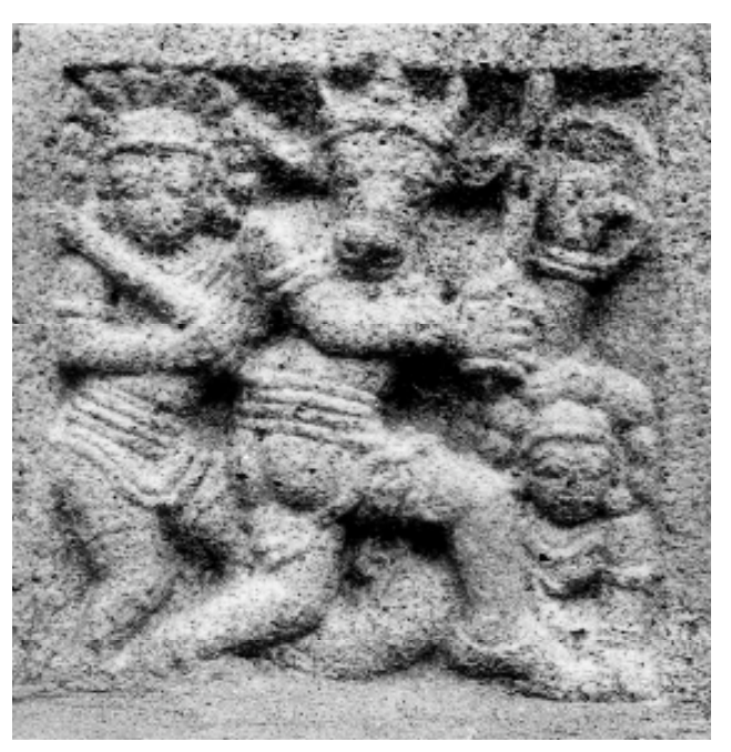
Fig. 6 – Tirumangalam, Sāmavedīśvara temple, 10th century, Mahişa. (Photo: EFEO-Evenisse N 40 19).

The base of the temples is also seen to be an intermediary space, close to the ground and connected with it, where divine incarnations gamble or play the roles given them in the texts, putting on the costume of the boar, of the naked mendicant or of the Goddess mounted on a lion. This is the realm of the l\bar{l}l\bar{a} of the gods, the cosmic play which intervenes between gods and humans. The prescription in the Mancis anhitamay also be understood thus. According to some authors, Rāma may be represented on Cola Saiva temples as the model of the king<sup>10</sup> but I am not sure that in this corpus Rāma has always been considered as a royal incarnation. These temples were not founded by kings; it is often a matter of reconstruction, and the link with royal power hardly appears in the inscriptions except during a specific period at Tirubhuvanai which, once more, is seen to be an exception.<sup>11</sup> It is, however, certain that the illustrations of the Rāmāy aņa, some of the forms of the Goddess and of Śiva doing battle or, again, the stories of Krsna, correspond to