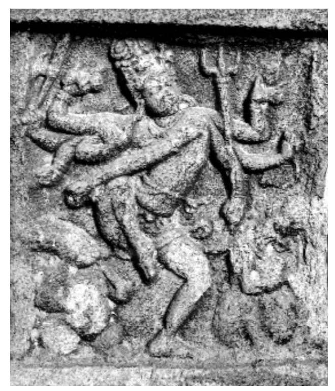
Fig. 10 – Pullamangai, Brahmapurīśvara temple, 10th century, dancing Śiva.

In the first Cola series the narrative mode appears, in any case, to be essentially Vaisnava and, as with the placing of the friezes, this Vaisnava thematic must have been connected with their mundane character. In fact representations connected with the world of dance and music (Fig. 9) are quite numerous in these temples, on the order of 15 and 20 per cent per temple. They are sometimes inserted for the sake of solution of continuity with the cycles, all the more so as the dancing forms of gods are equally present: those of Siva (Fig. 10) but also those of Kṛṣṇa dancing with pots and playing the flute (Fig. 11). In the Hoysala temples this type of representation often marked the boundary between one narrative cycle and the next: it remains very common. We are familiar with religious festivals whose atmosphere seems very close to the presiding spirit of the representations on the bases. At the time of festivals dedicated to Siva, plays were performed featuring the avatāras of Viṣṇu, such as the Mahāvīracarita and the Uttararāmacarita of Bhavabhūti, which have Rāma for their hero and were performed in honour of Lord Kalapriya, one of the forms of Siva. The inscriptions evoke, too, the drummers who made their instruments resonate during those festivals just as they do