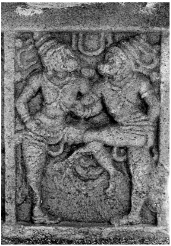
Fig. 12 – Tirumangalam, Sāmavedīśvara temple, 10th century, the fight of Sugrīva and Vāli.

a play in a theatre. The poses taken by certain characters evoke the world of dance in the same way. The fight between two monkeys, Sugrīva and Vāli, in the Rāmāyaņa, for example, is obviously in the form of a dance (Fig. 12) and sometimes has no significance beyond its decorative value. We find it represented completely out of context in Saiva temples such as that at Darasuram, where it is the only representation having to do with Rāma but where it is, however, represented at least four times. It may, too, have inspired the pose of Narasimhafighting Hiranyakaśipu, which also appears in distinctly dancing mode in, for example, the temple in Tirumangalam (Fig. 13). The outstandingly aesthetic nature of these representations where the wrestlers" limbs correspond to one another emphasizes the theatrical character of certain narrative representations. It is true that other representations of deities, such as those of battles or of leaping gods and demons, indirectly evoke the world of dance and theatre. The base of a temple is a theatre where the living gods appear and where "appears adorned with peacock feathers, red ochre and with buds, Mukunda-Krsna who sometimes dresses up to play the role of a wrestler, friend !".20