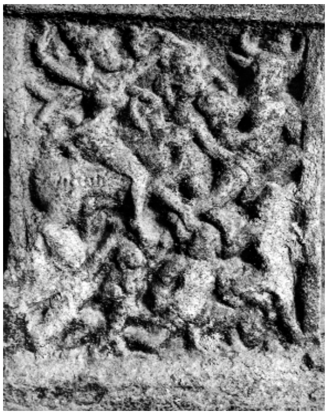
Fig. 7 – Puļļamangai, Brahmapurīšvara temple, 10th century, Mahişāsuramardinī. (Photo: EFEO-Evenisse N 36 32).

(Fig. 7), of Kumbakonam and of Pāccil (Fig. 8) are constructed on the same plan as that of the famous bas-relief of Mahiṣāsuramardinī in Mahabalipuram. It is mainly the Śaiva scenes, including those that bring the Goddess into the picture, which are constructed according to an iconography that hardly alters from temple to temple.<sup>13</sup> Even if some of the representations of avatāras are also often very like one another,<sup>14</sup> the sculptors have shown