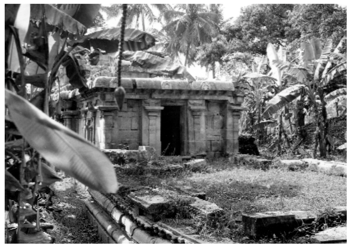
Fig. 1 - Tiruchennampūndi, Śadaiyār temple, 10th century. (Photo: EFEO-Evenisse N 26 30).

beginning of the 10th to the beginning of the 11th century. It comprises, in the region of the Kauverī delta, the Śadaiyār temple of Tiruchennampūņdi (Fig. 1), the Nāgeśvara of Kumbakonam, the Brahmapurīśvara of Pullamangai, the Naltuñai Isvara of Puñjai, the Tirumerratīśvara of Pāccil, the Sāmavedīśvara of Tirumangalam, and farther North, near Pondicherry, the Varadarājaperumāļ of Tirubhuvanai (Fig. 2). To this body corresponding to a totality of about six hundred representations, I add the small Vaisnava temple of Konār, near the village of Tirumālpūr, not far from Kāñcīpuram and dating from the second half of the 10th century.<sup>1</sup> The narrative series in this temple appear on the pilasters<sup>2</sup> and not on the plinths but is of the same type of representation and, moreover, the Vaisnava character of the temple makes it possible to add to observations made on the comparison between the Saiva corpus of the Kauverī delta and the Vaisnava Varadarājaperumāl.