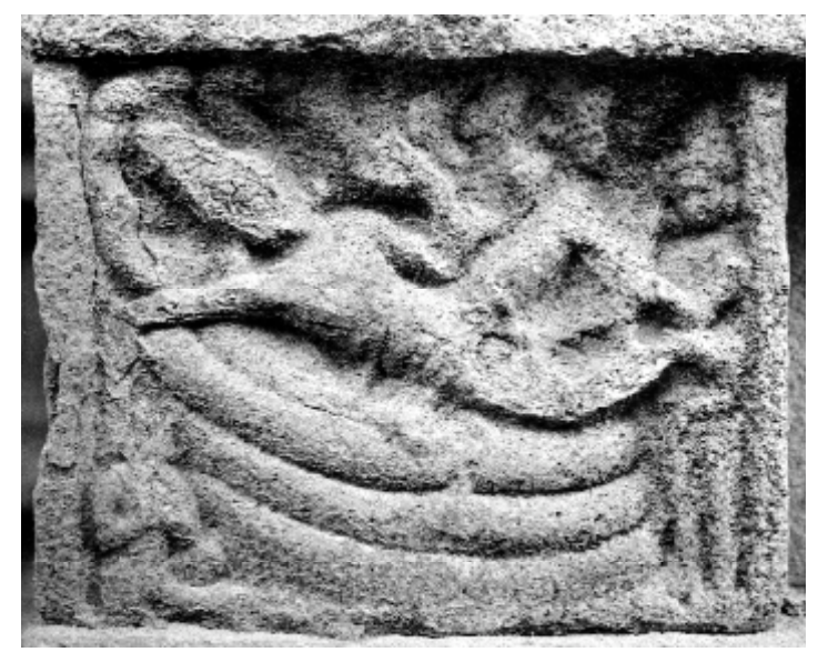
Fig. 14 – Pullamangai, Brahmapurīśvara temple, 10th century, Raņganātha. (Photo: EFEO-Evenisse N 38 16).