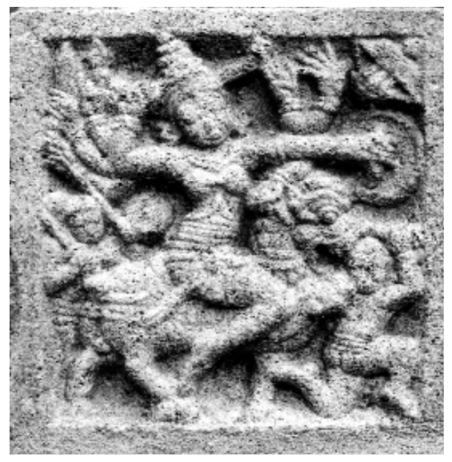
Fig. 5 – Tirumangalam, Sāmavedīśvara temple, 10th century, Mahişāsuramardinī. (Photo: EFEO-Evenisse N 40 20).

of the niches: its functions as an intermediary between two parts of the temple, the base and the exterior walls, may explain this. Lastly, as in the series at Tirumaṅgalam, though placed further down in the temple, most of the series are situated on the extensions of the pilasters punctuating the walls of the buildings; their wide rectangle would certainly appear to be providing a base for the images for the worship, both those on the niches and those found inside the interior of the building.