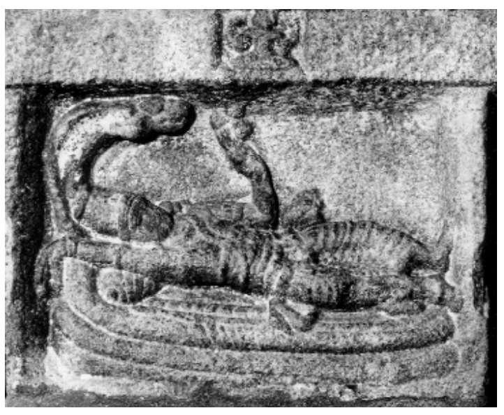
Fig. 15 – Tirubhuvanai, Varadarājaperumāļ temple, 11th century, Ranganātha.

tumes ( veṣa , as quoted by Couture, Id .: 323) which gives him a human or half-animal form.<sup>22</sup>