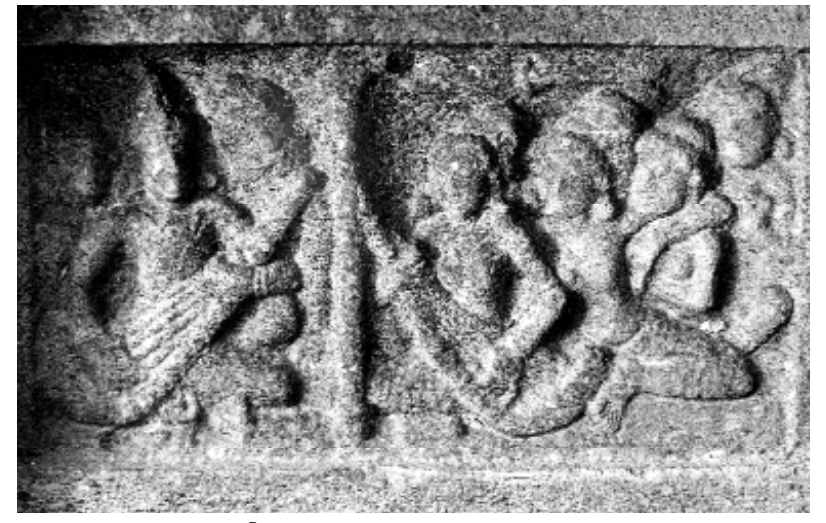
Fig. 9 – Puñjai, Naltuñai Īśvara temple, 10th century, musicians. (Photo: EFEO-Evenisse N 6 30).

The presiding spirit of these representations in V a iṣṇava narrative cycles appearing in series of otherwise Śaiva representations, and scenes of dance and music corresponds very well with the spirit of these rejoicings. The world of the theatre, of the divine action represented and played out on the earth, comes close to the Cōla Śaiva series on the bases. The way they are divided into small panels irresistibly evokes the sequence of scenes of