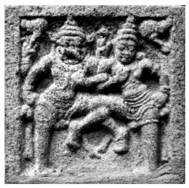
Fig. 13 – Tirumangalam, Sāmavedīśvara temple, 10th century, the fight of Narasimha and Hiraņyakašipu. (Photo: EFEO-Evenisse N 39 20).

The spirit which animates the theatrical representations in the temples is close to the little world populating the narrative series and it evokes one of the fundamental concepts of the Vaisnava tradition. André Couture (2001) in the course of a study of the use of vocabulary referring to the idea of the avatāra, brings to light the special link apparent in the Mahābhārata, the Harivaņśa and the Purāņas between the world of theatre and the manifestations of Vișnu. This connection seems to me to be illustrated by the narrative series of the Cola temples too. Avatarana designates, in the theatre, the entrance of the actors onto the scene, ranga, just as the same term designates the appearance of the god here below. The fight of Kṛṣṇa against his uncle's wrestlers staged by Kaṃsa, on a rang a, in the town of Mathurā, is also represented as the scene in which are revealed the powers of the god who manifests himself in the world. It is, however, the whole collection of episodes from the childhood of Kṛṣṇa, in the Harivamśa, which must be considered as an entrance onto the scene, an avatarana.21 It may be said that what appears on the scene is the visible form of the god, human or visible to the human eye, which Kṛṣṇa evokes in the Bhagavadgītā (XI, 8), that which plays on earth amongst men and women after having put on the cos-