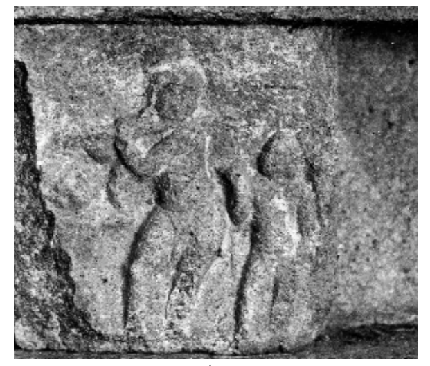
Fig. 11 – Tiruchennampūņḍi, Śaḍaiyār temple, 10th century, Kṛṣṇa playing flute.