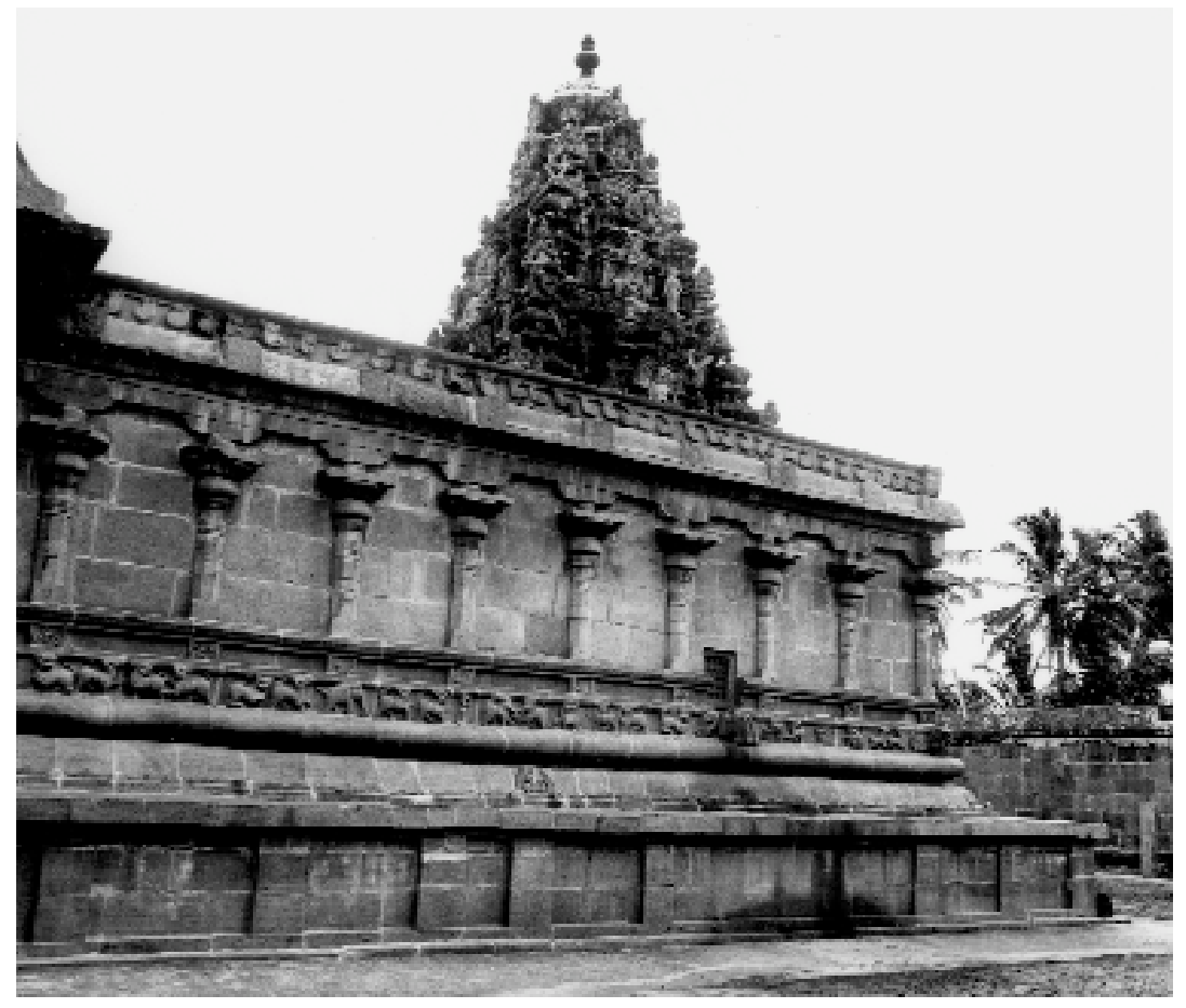
Fig. 2 - Tirubhuvanai, Varadarājaperumāļ temple, 11th century.

engraved on a reused block in the shrine to the Goddess is a little later and may indicate that the foundation of the temple also predates the Cola period. We have to notice also that, anyway, the site is attached to the corpus of the Tēvāram, devotional Śaiva hymns attributed to the 7th century: a temple existed here as soon as the 7th century. So here too it is a case of a reestablishment. The earliest Cola inscription of confirmed date is 934 (Rangaracharya 1919, vol. II: no. 34, p. 1237). T.V. Mahalingam (1967: 83-84), in attributing the title "Parakeśarivarman", found in three inscriptions, to Parāntaka I, puts the even earlier date of 910 on the first epigraphic reference. This title being, however, common amongst Cola kings the attribution remains unconfirmed. David T. Sanford (1974: 182-183) dates the temple from the second half of the 9th century. It should be mentioned that Sanford considers the narrative series of the Nageśvara to be very little earlier than those in the Pullamangai temple. The dating of the later temple is also, however, a subject of controversy even if dated from the beginning of the 10th century, that means even if we do not take into account that, as a temple attached to the corpus of the Tēvāram, the temple has existed in one form or another