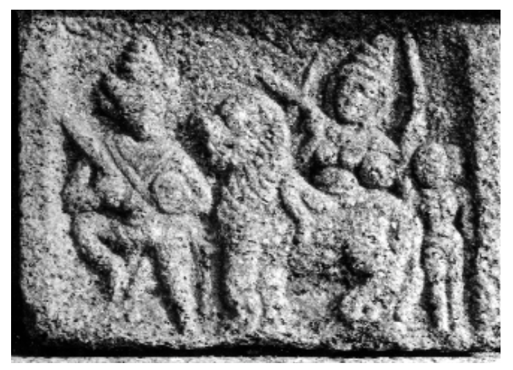
Fig. 8 – Pāccil, Tirume<u>r</u>ratīśvara temple, Mahişāsuramardinī.

(Fig. 7), of Kumbakonam and of Pāccil (Fig. 8) are constructed on the same plan as that of the famous bas-relief of Mahiṣāsuramardinī in Mahabalipuram. It is mainly the Śaiva scenes, including those that bring the Goddess into the picture, which are constructed according to an iconography that hardly alters from temple to temple.<sup>13</sup> Even if some of the representations of avatāras are also often very like one another,<sup>14</sup> the sculptors have shown