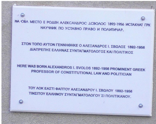
Figure 2: The board about A. Svolos in Kruševo, January 2011.

birth-house of Alexandros Svolos used to stand 40 . This board contains the following text: “Here was born Alexandros I Svolos 1892-1956 prominent Greek professor of constitutional law and politician”.