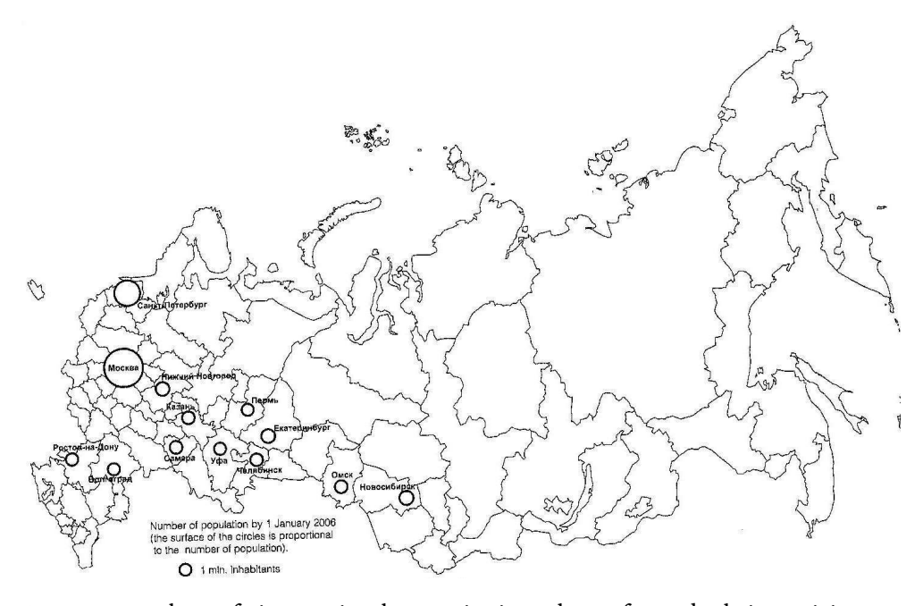
Figure 1. The largest cities of Russia.

A great number of international organisations have focused their activity on Yekaterinburg, a city formerly closed to such intervention. Its administration has been actively supporting and participating in international projects since 1992 (funded by US Aid, USIA, TACIS, the Know How Foundation, etc.). American aid, in particular, was granted to support the construction of condominiums. Altogether, the municipality participated in more than 50 large-scale projects. Several NGO's that were created temporarily as a result of these projects have continued their activity as municipal or independent institutions ( Centre for Energy-Saving, Centre of Environmental Education, Centre for Civil Initiatives , etc.). The work on international projects shaped a community thinking in a new way and prepared for international cooperation.