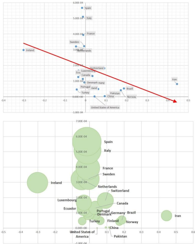
Figure 1: Health Expenditures change (2013-17) versus Covid-19 mortality rates

Note : lagged covariates have been used as instruments to compute GMM regressions