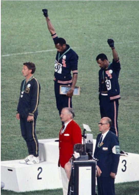
Figure 6. Black Power salute at the Mexico Olympics, 1968