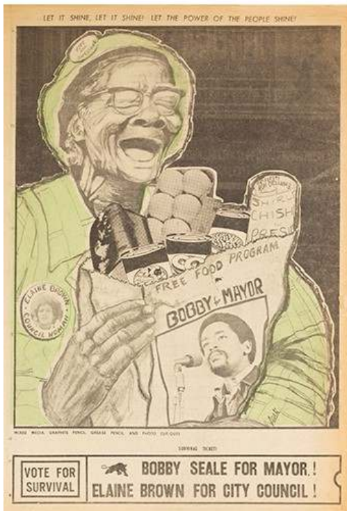
Figure 10. Illustration by Gayle Dickson: "Let it shine"