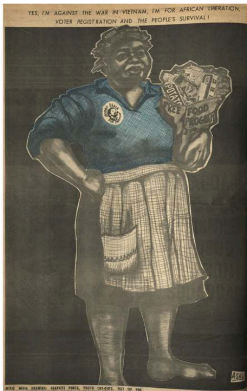
Figure 9. Illustration by Gayle Dickson, in the BPP newspaper The Black Panther , July 1 st 1972

of whom, for example, held their shopping wrapped in the party newspaper, one of which showed the slogans of Bobby Seale's campaign for Oakland City Hall in 1973 (Figure 8), and the other the announcement of the party's "Free Food Program" for the poorest people (Figure 9) (Farmer 2017, 85-89). 14 Obviously, BPP sympathizers and militants were not just angry young men.