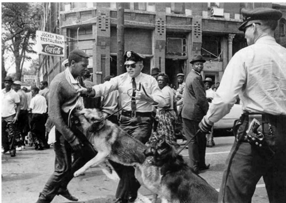
Figure 3. Walter Gadsden attacked by police dogs in Birmingham on May 4, 1963