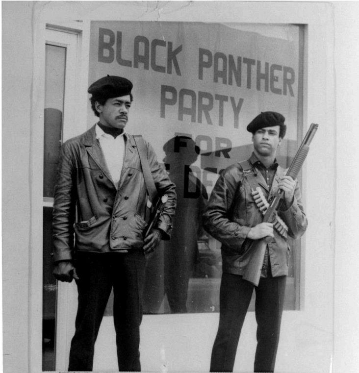
Figure 7. Bobby Seale and Huey Newton, co-founders of the BPP, 1967, in front of their headquarters in Oakland, CA