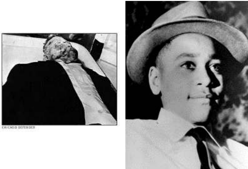
Figure 1. The body of Emmet Till (left) and a picture taken on Christmas Eve (right)