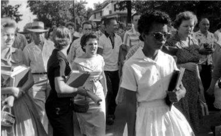
Figure 2. Hazel Massery yells at Elisabeth Eckford

This attitude shocked the public at the time because it was the opposite of the restraint that a young girl from the South was supposed to adopt. The tactic of non-violence by black students often used the notion of respectability, which implies dignified behavior at all times, in effective opposition to the invective and violent acts of white supremacists in the South.