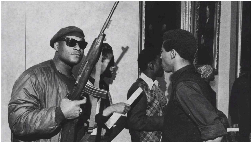
Figure 5. Gun-toting Black Panthers invade the California Capitol in 1967