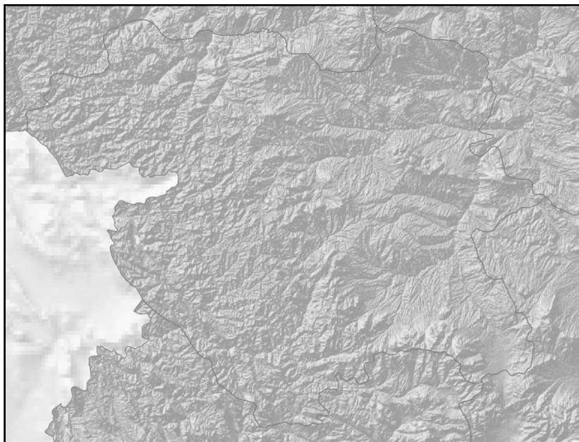
Figure 1: Background map for Kordestan Province (Map design: Robert Oikle, GCRC. Source: http://iranatlas.net )

Secondly, we brought together settlement-related geographic data (NCC 2016, Roostanet 2016) and open-access demographic data for all populated places of Kordestan from the 2011 census of Iran (ISC 2011), which was the most recent available census data at the time of research. However, because the geographic data has not been made publicly available in tabular format, members of the research team spent several hundred hours reconstructing georeferenced (GPS) coordinates for each settlement.