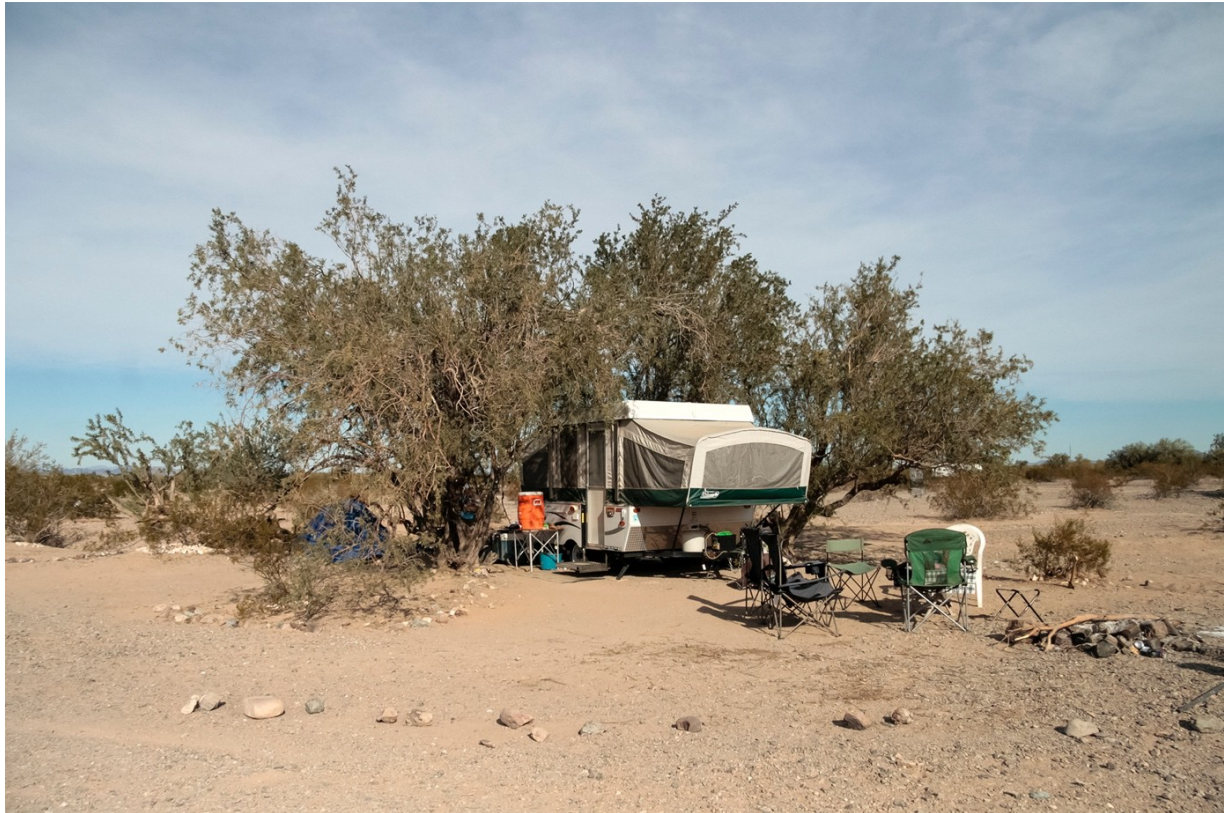
Figure 2. Guppy's camp, a typical camp of North La Posa: a few chairs around a fire pit, in front of a trailer placed close to vegetation