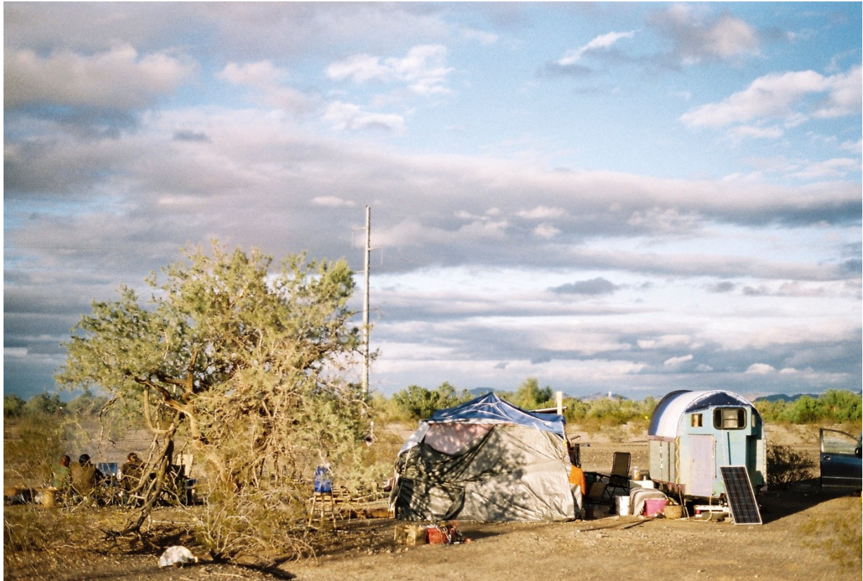
Figure 4. Betty's camp during an afternoon of December