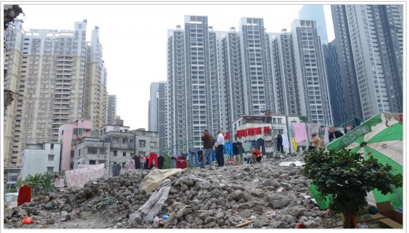
An urban village in Guangzhou city core being swallowed up by urban encroachment. A group of migrant tenants was still living in what was left of the village before being expelled. Guangdong province. December 2016.

villagers. Therefore, rural collectives managed to keep their rural residential land (宅基地, zháijiīdì) and, in some cases, the village's spare land (留用地, liúyòngdì) that could be used for collective purposes, public facilities and industrial and commercial uses (Wang 2017). While keeping their juridical status of rural villages, these rural knots have gradually been sewn into the urban fabric, being converted into 'villages within the city.' In other words, although they have been geographically integrated into sprawling metropolises and surrounded by modern districts and skyscrapers, chéngzhōngcūns retain the collective ownership of rural land as well as their original management model, being administered