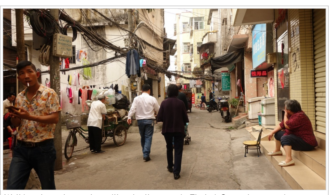
Walking through an urban village's alleyways in Zhuhai, Guangdong province. March 2017.

Meanwhile, non-residential buildings such as factories and commercial facilities have also been developed in chéngzhōngcūns – especially those located in the PRD region – attracting foreign investment that has helped to create suitable industrial areas. Some of the so-called world factories (that is, labour-intensive manufacturing industries producing goods mostly for the world market) are actually located in chéngzhōngcūns (Lin 2006; Wang et al. 2009; Hao et al. 2012). Therefore, many migrants have found in urban villages not only a cheap place in which to settle but also a convenient place to work and live.