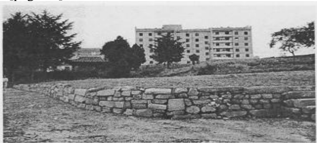
Kyŏngdok Palace (above); han'ok in central Kaesŏng (below) (Photographs by author, 26/8/2003 and 30/1/2003)