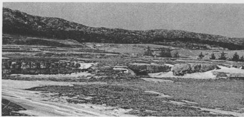
Manwŏltae Palace (Photographs by author, 30/1/2003 and 26/8/2003)