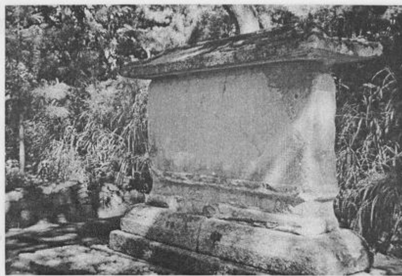
Kwangt'ong Poje sōnsa (above) and temple site (below) east and west respectively of King Kongmin's tomb (Photos by author, 28/8/2003)