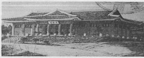
Kaesong pangmulgwan (Kaesong purip pangmulgwan, Kaesong purip pangmulgwan annae , 1936)