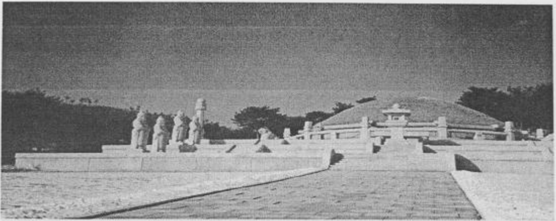
Tombs of King T'aejo (above) and King Kongmin (below) (Photographs by author, 31/1/2003)