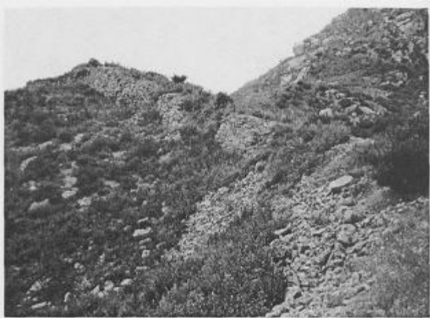
The exterior wall (Photographs by author, 26/8/2003)