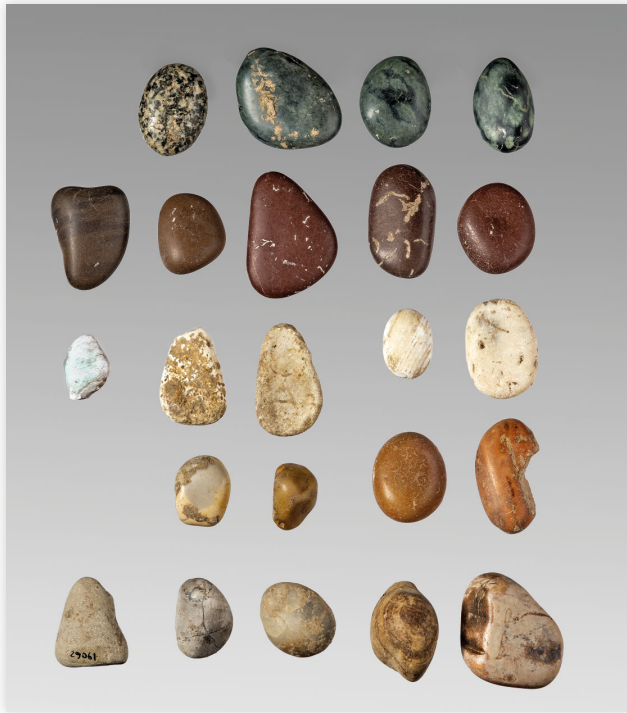
Figure 3. Pebbles from burial Certosa 392. Museo Civico Archeologico di Bologna, Photograph by Marco Ravenna.