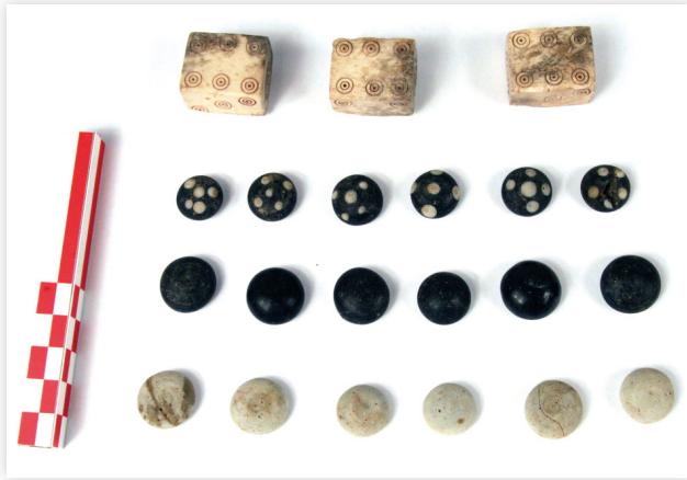
Figure 1. Three groups of sic glass counters and three dice from burial Arnoaldi 132. Museo Civico Archeologico di Bologna, Photograph by Marco Ravenna.