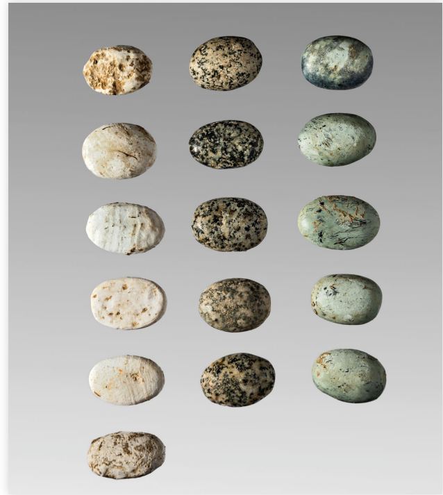
Figure 4. Pebbles from burial Arnoaldi 110. Museo Civico Archeologico di Bologna, Photograph by Laura Minarini.

Montefortino, and Todi, and seems to have travelled even north and west of the Alps. [13] We see that these glass counters, including those belonging to the earliest glass counters found in the Etruscan cemeteries at Bologna, demonstrate highly sophisticated glass making.