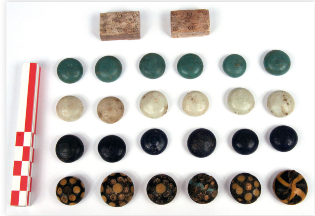
Figure 2. Four groups of six glass counters and two dice from burial Arnoaldi 128. Museo Civico Archeologico di Bologna, Photograph by Laura Minarini.

games. [11] A comprehensive study would have to start with an autopsy of the excavation diaries, in order to be able not only to catalogue the game related finds, but also to analyse their relation to other grave goods, to anthropological data (sex and age of the deceased), to the social status, to the burial rites (inhumation, cremation), the typology of the grave and to determine the date and provenance of the objects. Based on the catalogue, I would then like to forward some preliminary observations and raise some questions.