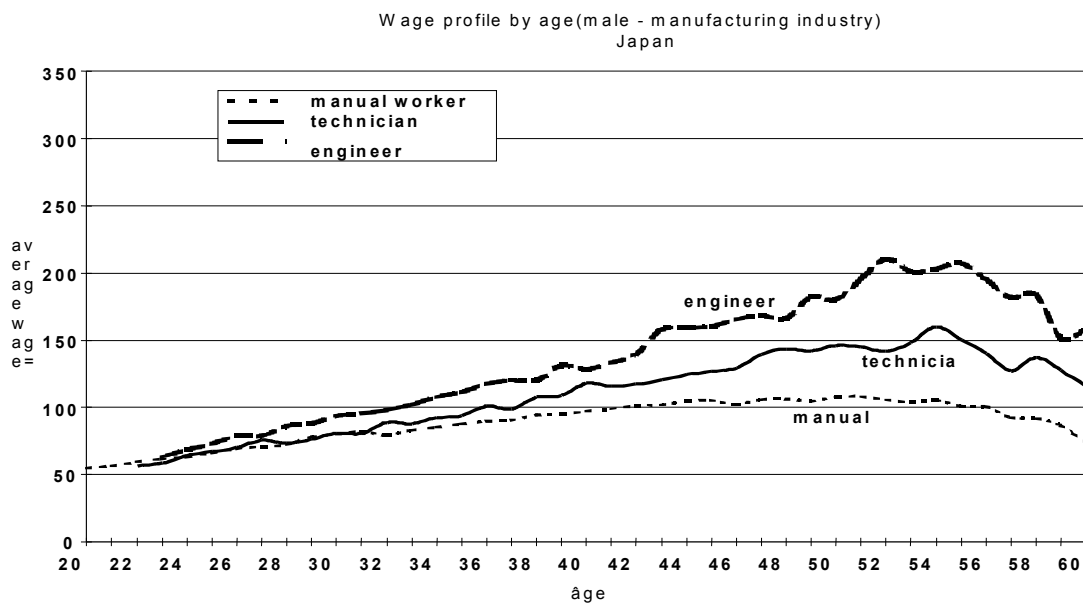
Table 1 below shows the progression of several categories of employees along the pay scale in accordance with age. Although they are very crude, these wage curves provide some interesting information, not only on the structure of the hierarchy at any given time but also on career paths of dependent employees in the two countries.