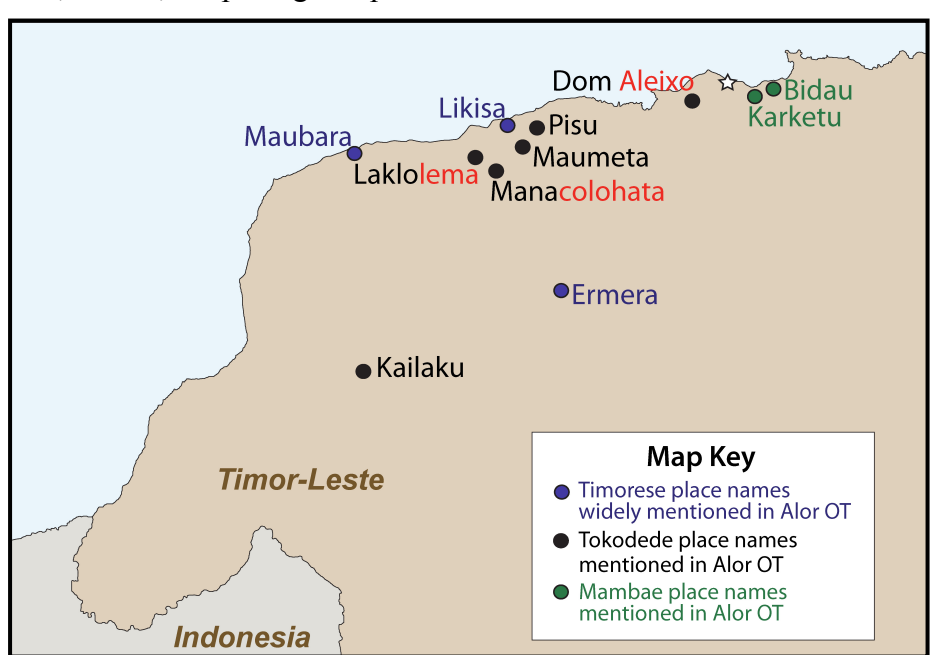
Map 2: Timorese place names occurring in oral traditions in Alor

The importance of Timor for the groups of south-eastern Alor can also be observed in cultural practices commemorating migrations from Timor. For example, the founders of the village of Kailaku where Manet, a Kamang-cluster language, is spoken, brought the name for their village with them from Timor. The place name shows clear signs of a Timorese origin, containing an Austronesian etymon kai 'tree' (< PMP *kahiw 'tree, wood') and laku 'civet' in Timorese languages such as Tokodede, Kemak and Tetun. Indeed Kailaku (often spelled Cailaco) is still a large village in the Kemak-speaking region of East Timor today. In Erana, a village on the south coast of Alor, Timorese origins are commemorated by the practice of naming pigs after the villages in Timor from which they are said to have migrated. There are two names: Pis Maumet and Bidau Keriket. "Pis Maumet" looks to be a minor corruption of the names of two villages close by one another in the Tokodede region just outside of Likisa: Pis = Pisu, and Maumet = Maumeta. "Bidau Keriket" are the two placenames Bidau and Karketu, both former villages thought to have been in the Mambae of the north-central coast, but now small neighbouring suburbs within the capital Dili. Such commemoration of Timorese place names in Alor points to the importance placed on Timor as an origin location and, in turn, the prestigious position of Timor within Alor.