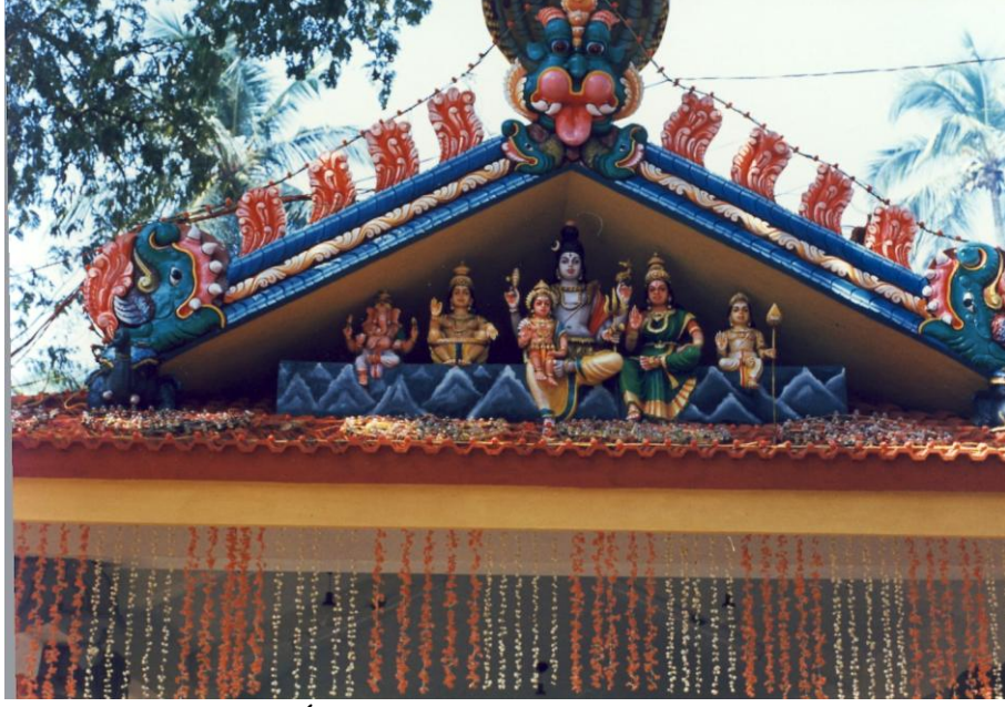
Fig. 16.4: Cāttan on Lord Śiva's lap, Kanadi Dēvasthānaṃ 1994.

During the festivals of the most successful temples, a huge crowd of /p. 466/ devotees congregates, and the story of the god—already alluded to—is sung as part of the ceremonies. In this story, Cāttan appears as a full-fledged god, also called Māyāttan or Māyā, (illusion) and evoked as a beautiful, golden child. Cāttan is now the son of Śiva and of Pārvatī who momentarily took the guise of a tribal girl, Kuḷivāka, for whom Śiva had felt a sudden passion (Fig. 16.5). Kuḷivāka then brings up the child in the forest until he fulfills his mission—to kill an Asura. His purpose accomplished, Cāttan does not wish to go to Kailāsa and prefers to stay among mortals, for he has still a lot of deeds to perform on earth. 34