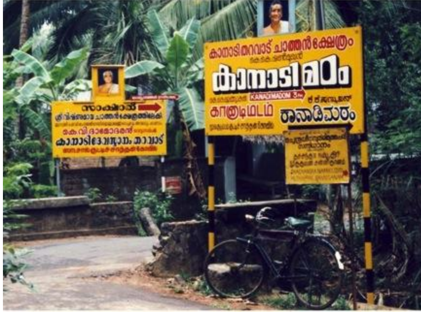
Fig. 16.1: Boards advertising rival branches of the Kanadi family in Peringottukkara (1994), courtesy author.