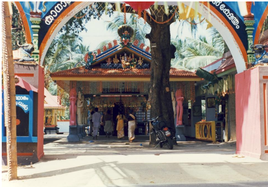
Fig. 16.3: Kanadi Dēvasthānaṃ in 1994, entrance and maṇḍapaṃ in front of the shrine

In these shrines, Cāttan is said to directly give his advice by ritually possessing a human medium (which is a hereditary charge): there is no need here of consulting an astrologer. The relationship between the client and the god is expressed in terms of devotion (the fact that temple owners may be doing a brisk business out of devotees' faith may explain the development of this devotional attitude, but does not invalidate the /p. 465/ devotion of the devotees themselves). Many devotees have at home a bronze effigy of the god mounted on a buffalo (see Fig. 16.6), or of a tantric maṇḍalaṃ engraved on a metal plaque that is regularly charged with power at festival times.