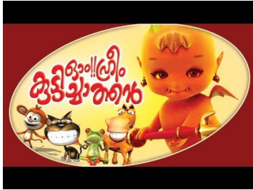
Ōṃ Hṛīṃ Kuṭṭicāttan (from website)

These images were not reproduced in the published version