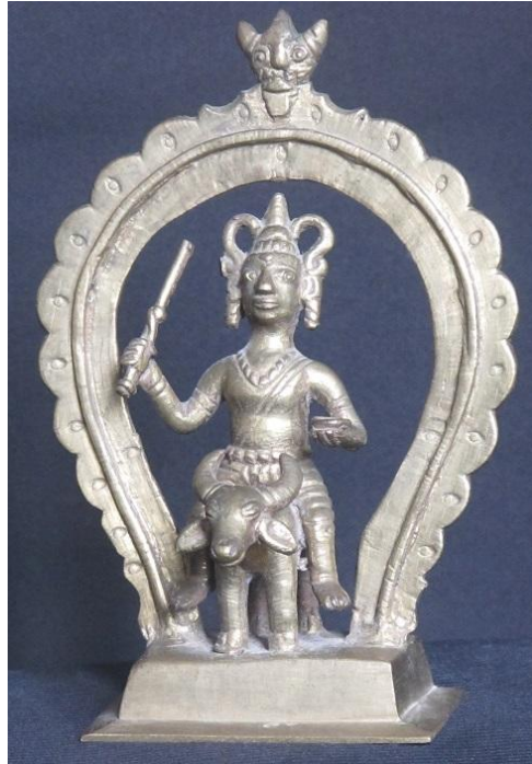
Fig. 16.6: Bronze cast of Cāttan, similar to the ones cared for in some devotees' house, courtesy author

Indeed, in these Cāttan temples, the deity is addressed as Svāmi, Lord, or Bhagavān, pointing to an ascribed high divine status and stressing a devotional dimension. He is said to be a brother of Ayyappan/Śāstā (Fig. 16.4), and the name Cāttan itself is sometimes said to be a variant of Śāstā.