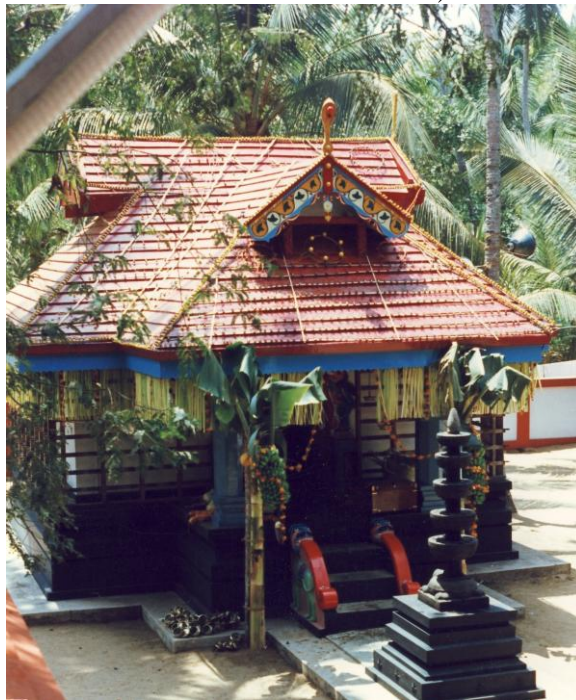
Fig. 16.2: Kanadi Dēvasthānam in 1991, shrine of Cāttan, courtesy author.

There, Cāttan is simultaneously a mantravādi's deity and a lineage's presiding god, permanently installed and regularly worshipped (see Fig. 16.2 and 16.3 for an illustration of the development of one such shrine between 1991 and 1994). 33