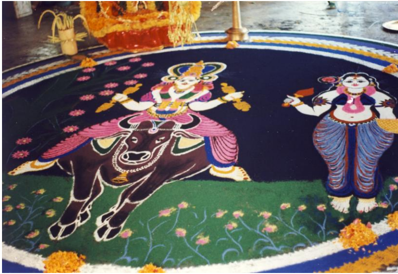
Fig. 16.5: Kaḷaṃ of Cāttan with Kuḷivāka, Kanadi Dēvasthānaṃ 1994, courtesy author.

During the festivals of the most successful temples, a huge crowd of /p. 466/ devotees congregates, and the story of the god—already alluded to—is sung as part of the ceremonies. In this story, Cāttan appears as a full-fledged god, also called Māyāttan or Māyā, (illusion) and evoked as a beautiful, golden child. Cāttan is now the son of Śiva and of Pārvatī who momentarily took the guise of a tribal girl, Kuḷivāka, for whom Śiva had felt a sudden passion (Fig. 16.5). Kuḷivāka then brings up the child in the forest until he fulfills his mission—to kill an Asura. His purpose accomplished, Cāttan does not wish to go to Kailāsa and prefers to stay among mortals, for he has still a lot of deeds to perform on earth. 34