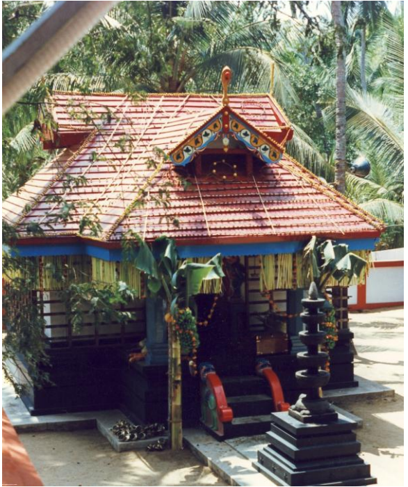
Fig. 16.2: Kanadi Dēvasthānam in 1991, shrine of Cāttan, courtesy author.

There, Cāttan is simultaneously a mantravādi's deity and a lineage's presiding god, permanently installed and regularly worshipped (see Fig. 16.2 and 16.3 for an illustration of the development of one such shrine between 1991 and 1994).<sup>33</sup>