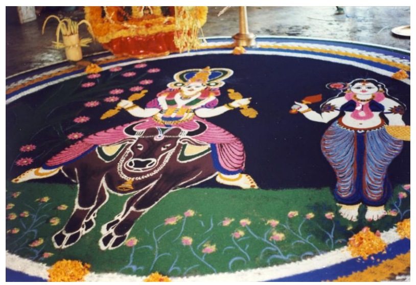
Fig. 16.5: Kalam of Cāttan with Kulivāka, Kanadi Dēvasthānam 1994, courtesy author.

During the festivals of the most successful temples, a huge crowd of / p. 466 / devotees congregates, and the story of the god—already alluded to—is sung as part of the ceremonies. In this story, Cāttan appears as a full-fledged god, also called Māyāttan or Māyā, (illusion) and evoked as a beautiful, golden child. Cāttan is now the son of Śiva and of Pārvati who momentarily took the guise of a tribal girl, Kuļivāka, for whom Śiva had felt a sudden passion (Fig. 16.5). Kuļivāka then brings up the child in the forest until he fulfills his mission—to kill an Asura. His purpose accomplished, Cāttan does not wish to go to Kailāsa and prefers to stay among mortals, for he has still a lot of deeds to perform on earth.<sup>34</sup>