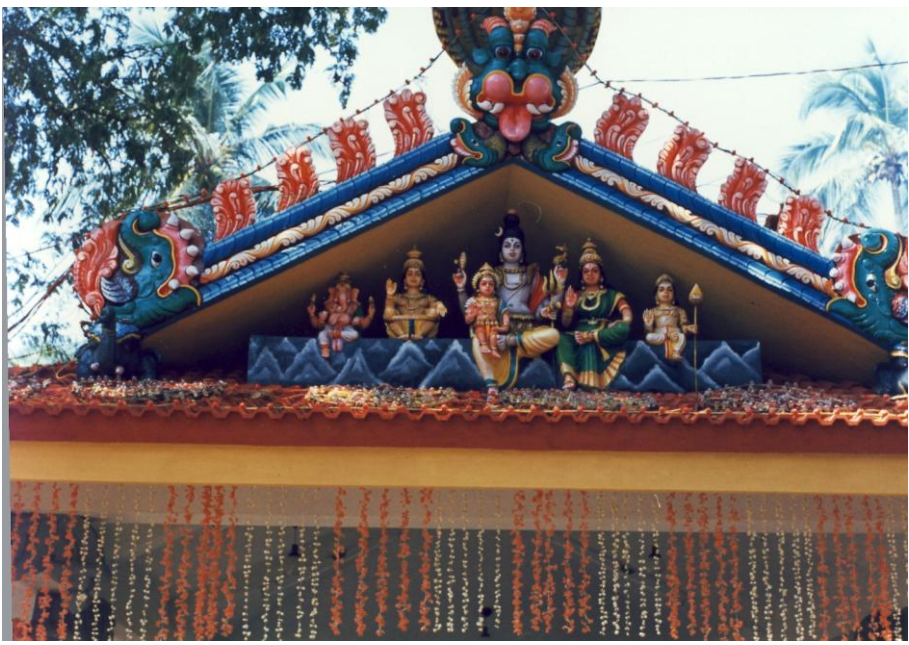
Fig. 16.4: Cāttan on Lord Śiva's lap, Kanadi Dēvasthānam 1994, courtesy author.

During the festivals of the most successful temples, a huge crowd of / p. 466 / devotees congregates, and the story of the god—already alluded to—is sung as part of the ceremonies. In this story, Cāttan appears as a full-fledged god, also called Māyāttan or Māyā, (illusion) and evoked as a beautiful, golden child. Cāttan is now the son of Śiva and of Pārvati who momentarily took the guise of a tribal girl, Kuļivāka, for whom Śiva had felt a sudden passion (Fig. 16.5). Kuļivāka then brings up the child in the forest until he fulfills his mission—to kill an Asura. His purpose accomplished, Cāttan does not wish to go to Kailāsa and prefers to stay among mortals, for he has still a lot of deeds to perform on earth.<sup>34</sup>