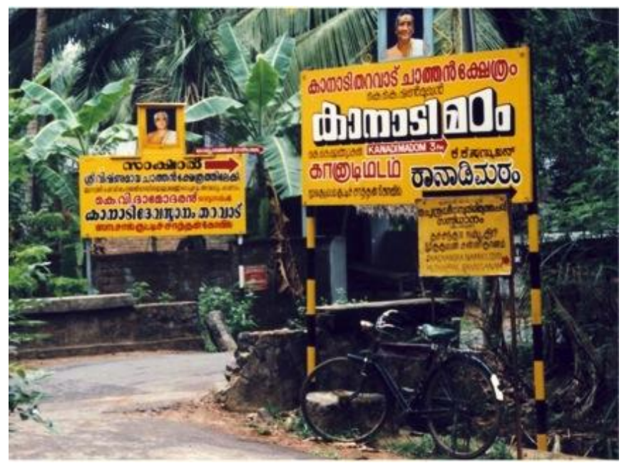
Fig. 16.1: Boards advertising rival branches of the Kanadi family in Peringottukkara (1994), courtesy author.