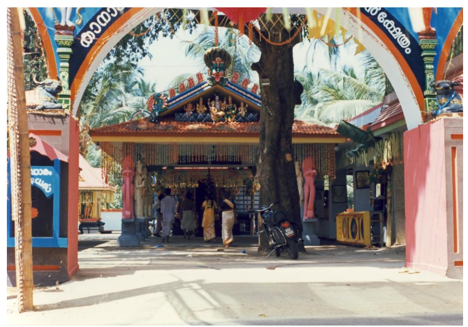
Fig. 16.3: Kanadi Dēvasthānam in 1994, entrance and mandapam in front of the shrine

In these shrines, Cāttan is said to directly give his advice by ritually possessing a human medium (which is a hereditary charge): there is no need here of consulting an astrologer. The relationship between the client and the god is expressed in terms of devotion (the fact that temple owners may be doing a brisk business out of devotees' faith may explain the development of this devotional attitude, but does not invalidate the / p. 465 / devotion of the devotees themselves). Many devotees have at home a bronze effigy of the god mounted on a buffalo (see Fig. 16.6), or of a tantric maṇḍalaṃ engraved on a metal plaque that is regularly charged with power at festival times.