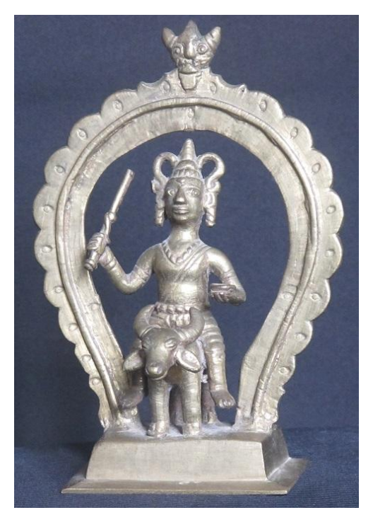
Fig. 16.6: Bronze cast of Cāttan, similar to the ones cared for in some devotees' house

Indeed, in these Cāttan temples, the deity is addressed as Svāmi, Lord, or Bhagavān, pointing to an ascribed high divine status and stressing a devotional dimension. He is said to be a brother of Ayyappan/Śāstā (Fig. 16.4), and the name Cāttan itself is sometimes said to be a variant of Śāstā.