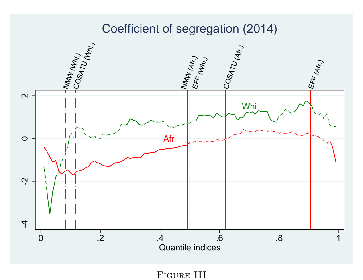
RIF-regression coefficients of Segregation with target groups The dashed parts of the curves represent the effects not significantly different from zero at the 5 percent level. "Afr" and "Whi" refer to Africans and Whites, respectively.